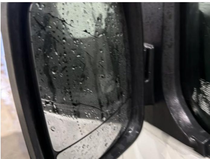
7: Door Mirror Glass ns Broken Replace