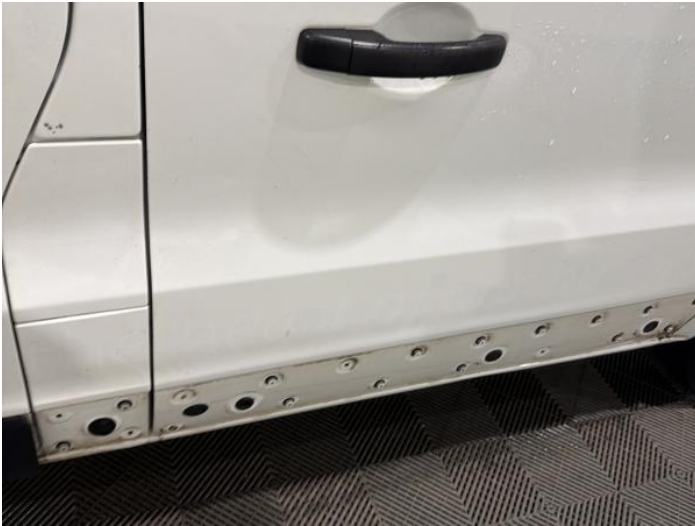
9: Door Moulding nsf Missing Replace