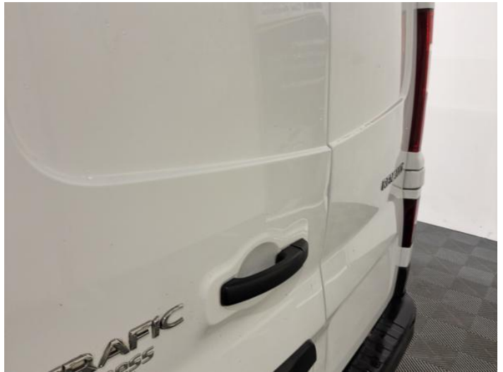
12: Boot Lid Dented With Paint Damage