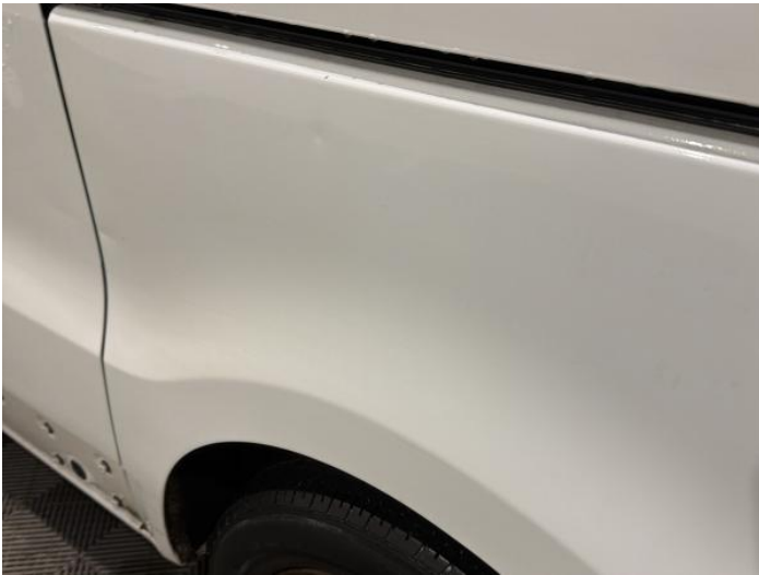
11: Qtr Panel nsr Dented With Paint Damage