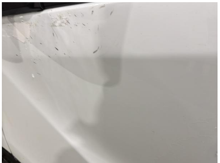
8: Door nsf Chipped Multiple Chips