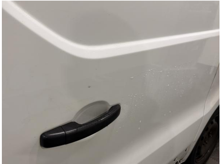
10: Door nsr Dented With Paint Damage