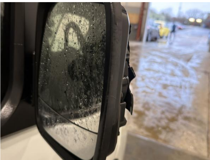
19: Door Mirror Glass os Broken Replace