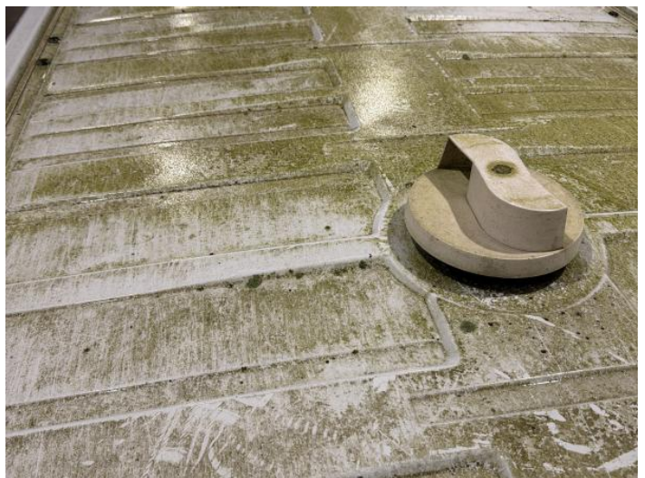
14: Roof Dented Over 30mm