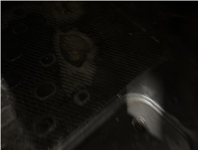
3: Carpets Front Torn Over 10mm