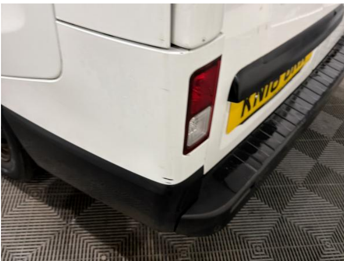
13: Bumper Rear Scratched 25 to 100mm Thru Paint