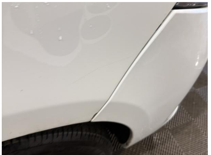
20: Wing osf Dented With Paint Damage