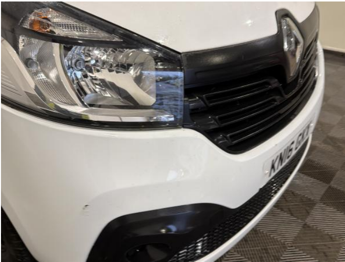
5: Bumper Front Scratched Over 100mm Thru Paint