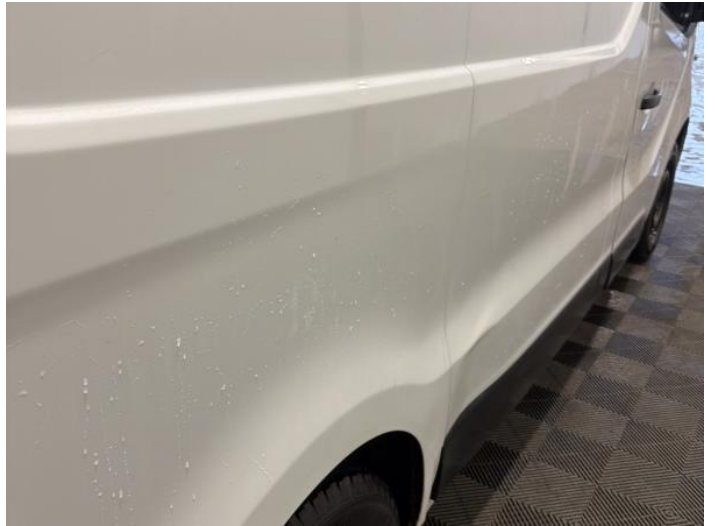
16: Qtr Panel osr Dented With Paint Damage