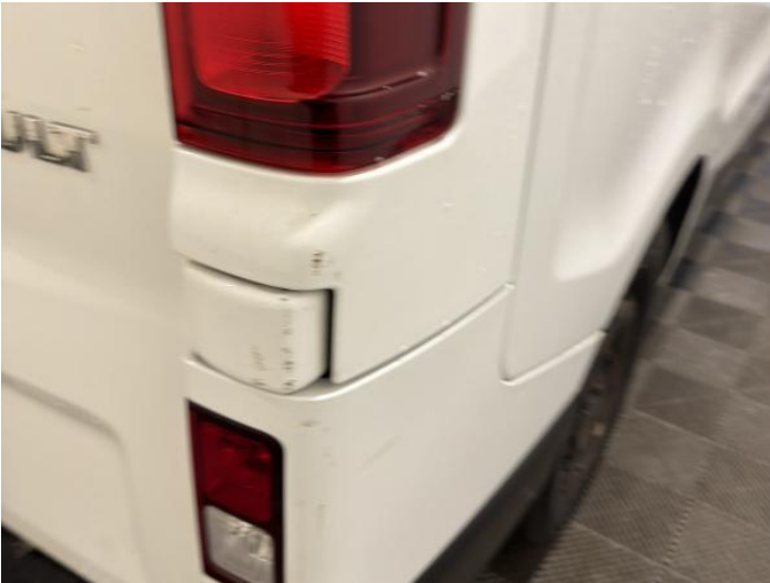
15: Bumper Rear Scratched 25 to 100mm Thru Paint