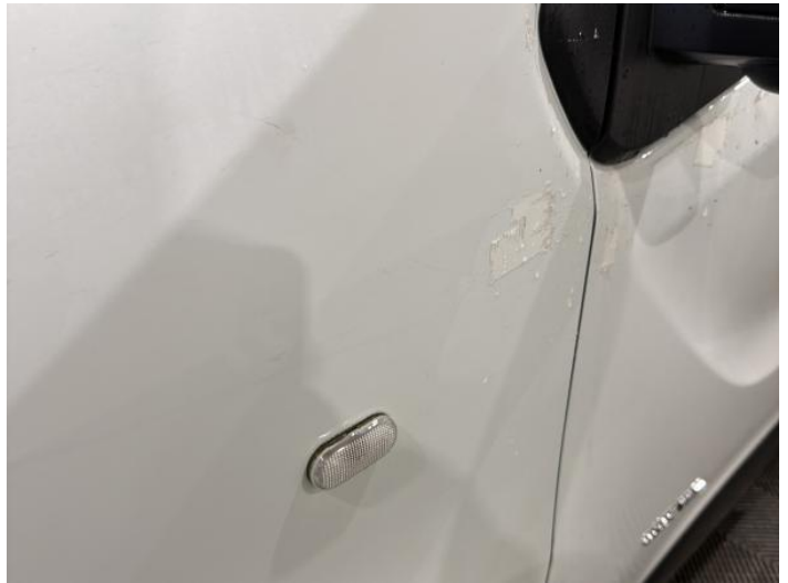
6: Wing nsf Poor Previous Repair Poor Paint