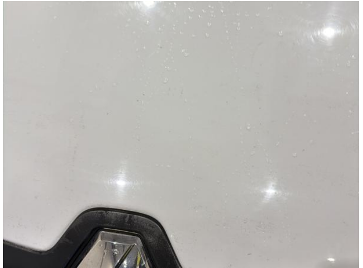
4: Bonnet Chipped Multiple Chips