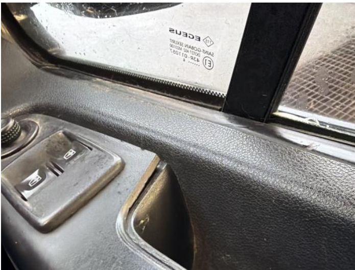
1: Handle Inner osf Damaged Replace