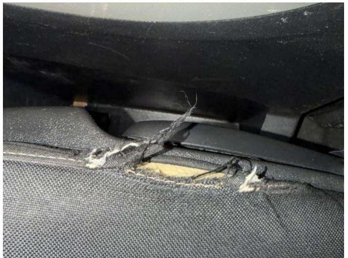
2: Seat Base Cover osf Torn Over 3mm