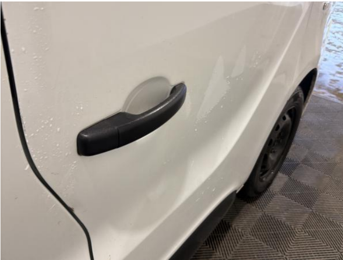
17: Door osf Dented With Paint Damage