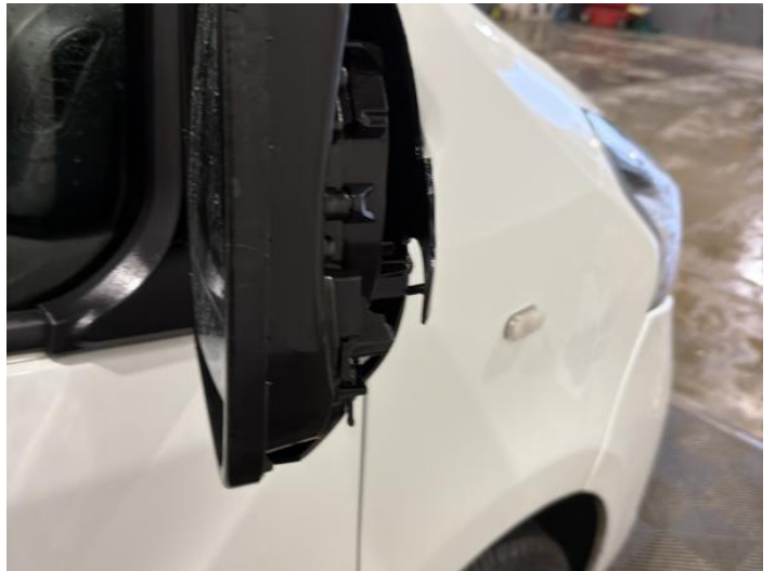
18: Door Mirror Assy osf Broken Replace