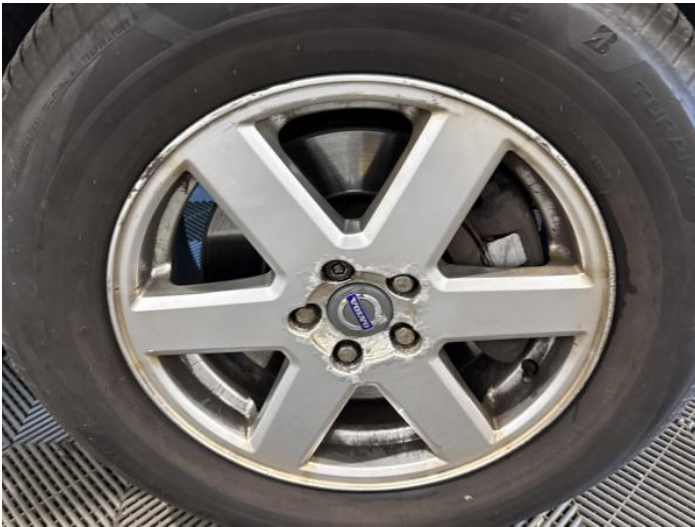
17: Wheel osf Scratched Over 50mm