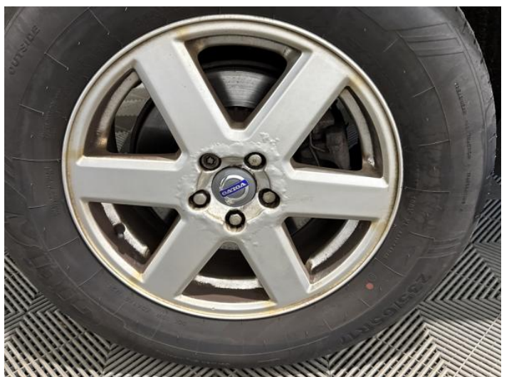
14: Wheel osr Corroded Light