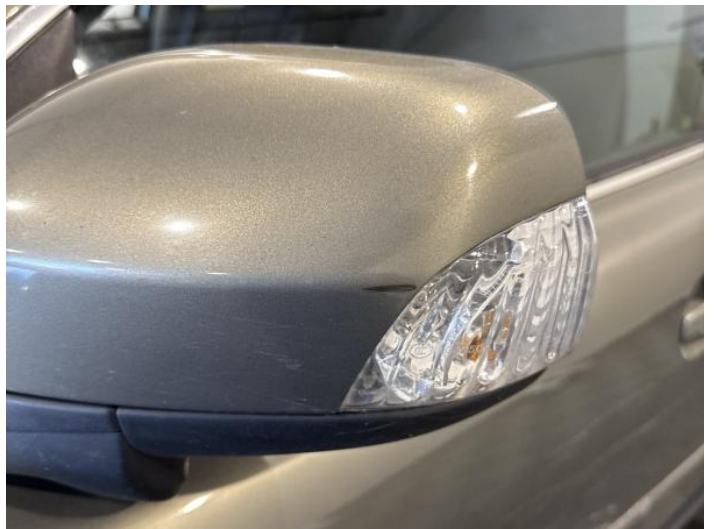
6: Door Mirror Assy nsf Scratched (Painted) UpTo 25mm Thru Paint