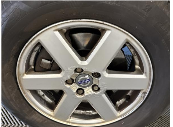
4: Wheel nsf Scratched Over 50mm