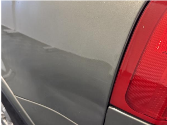
10: Qtr Panel nsr Dented Over 30mm