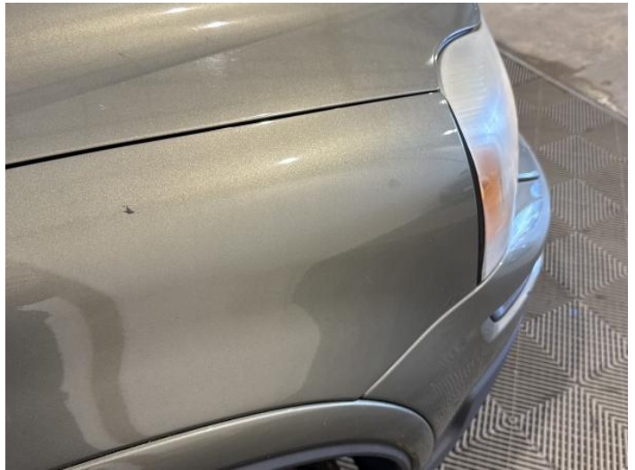
18: Wing osf Chipped 1 To 5