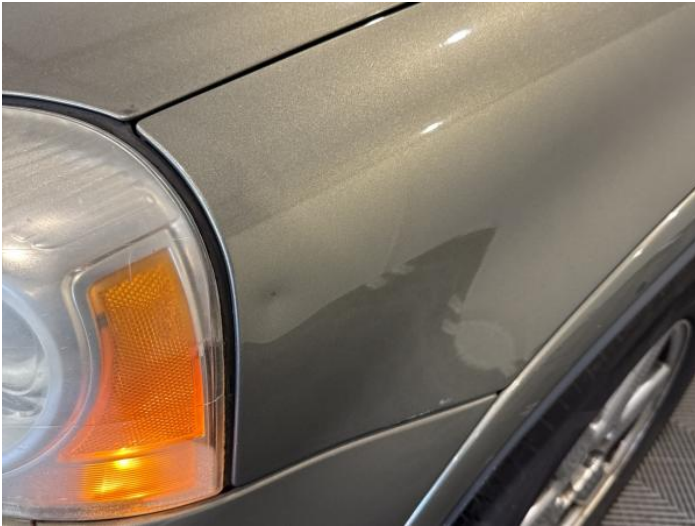
3: Wing nsf Dented Between 10mm + 30mm