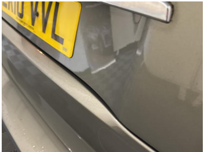
12: Tailgate Dented Between 10mm + 30mm