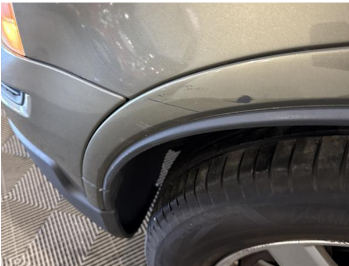
5: Wing Front Arch Extension ns Scratched (Painted) Over 25mm Thru Paint