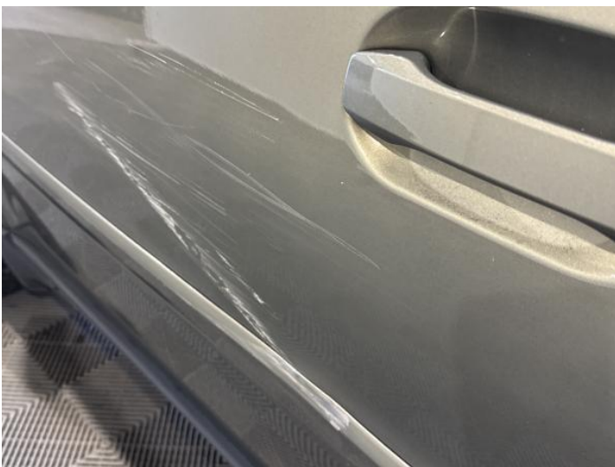
7: Door nsf Dented With Paint Damage