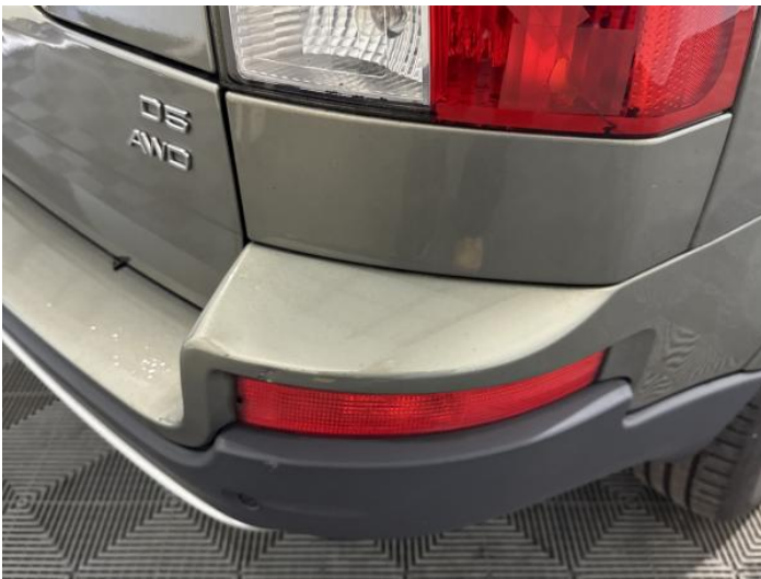
11: Bumper Rear Scratched 25 to 100mm Thru Paint