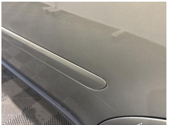
8: Door nsr Scratched Over 25mm Thru Paint