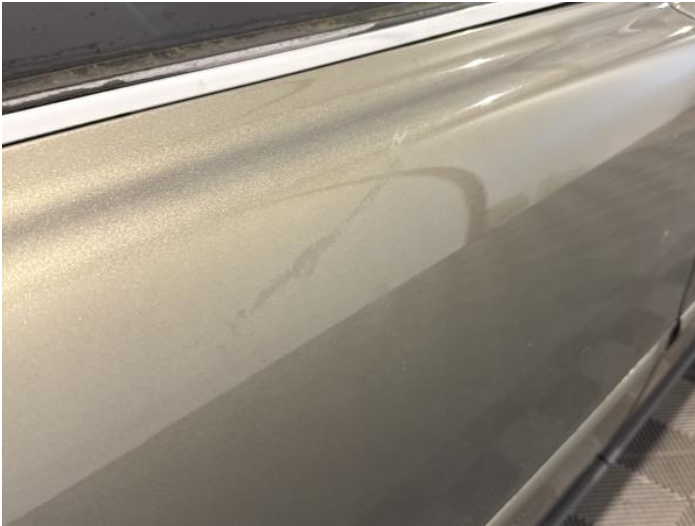
15: Door osr Scratched Over 25mm Thru Paint