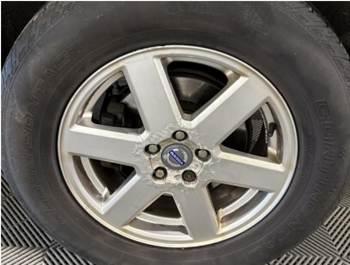
9: Wheel nsr Corroded Light