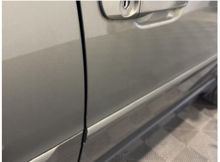
16: Door osf Chipped Edge Chip