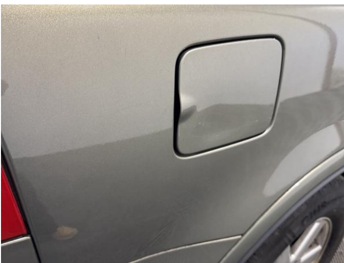
13: Qtr Panel osr Scratched Over 25mm Thru Paint