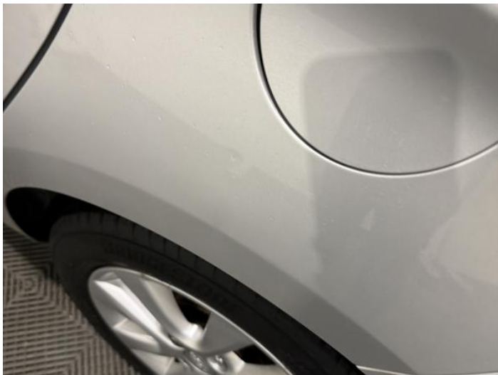
9: Qtr Panel nsr Dented Over 2 UpTo 10mm