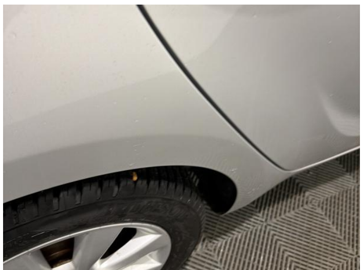
14: Qtr Panel osr Dented Between 10mm + 30mm