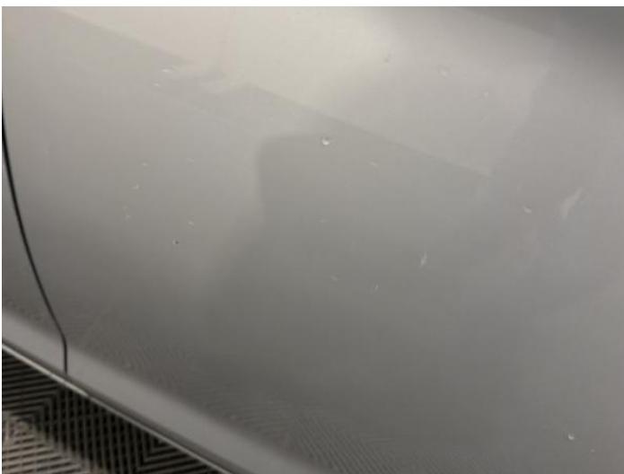
7: Door nsr Chipped Multiple Chips