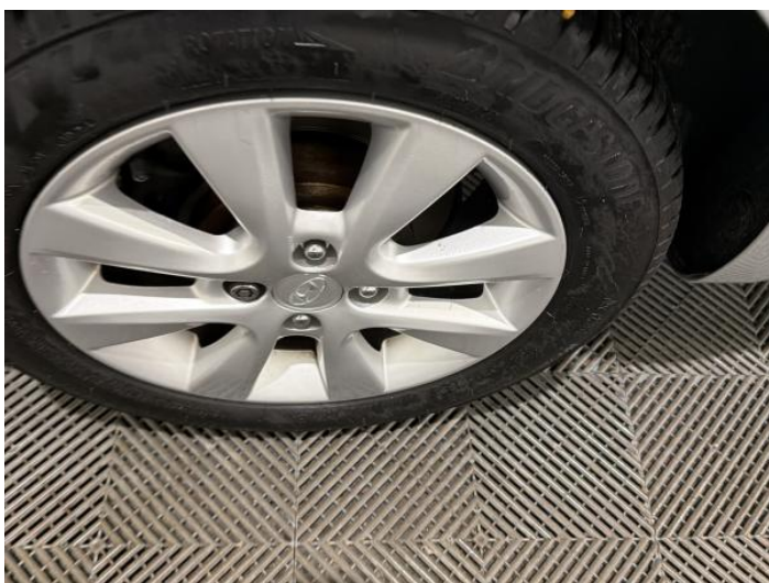
13: Wheel osr Scratched Up To 50mm