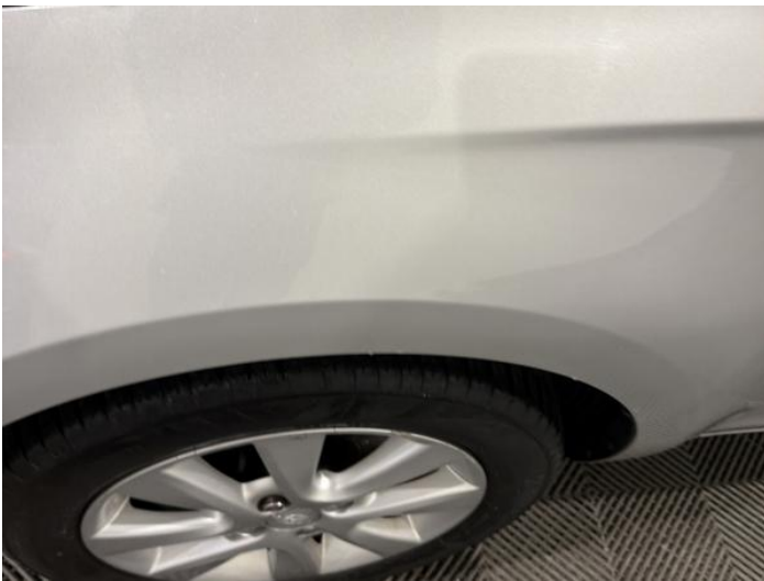
5: Wing nsf Chipped 1 To 5