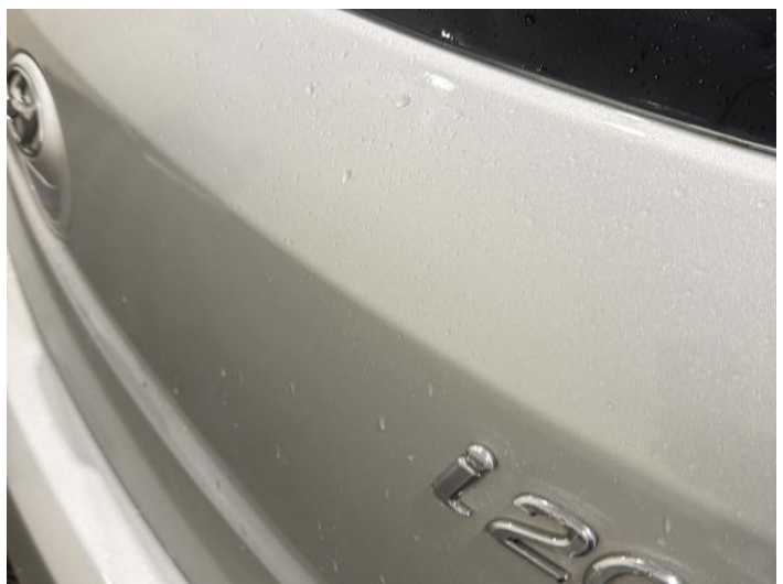
12: Boot Lid Dented Over 2 UpTo 10mm