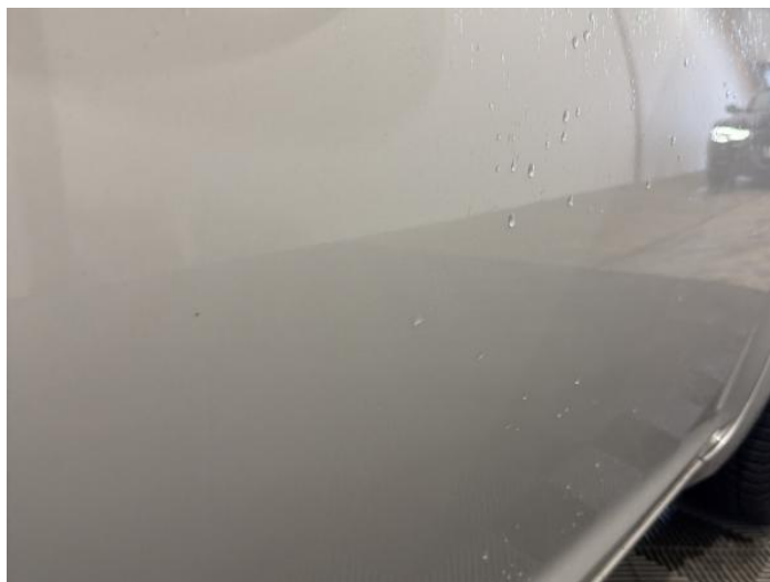
16: Door osf Dented Over 2 UpTo 10mm