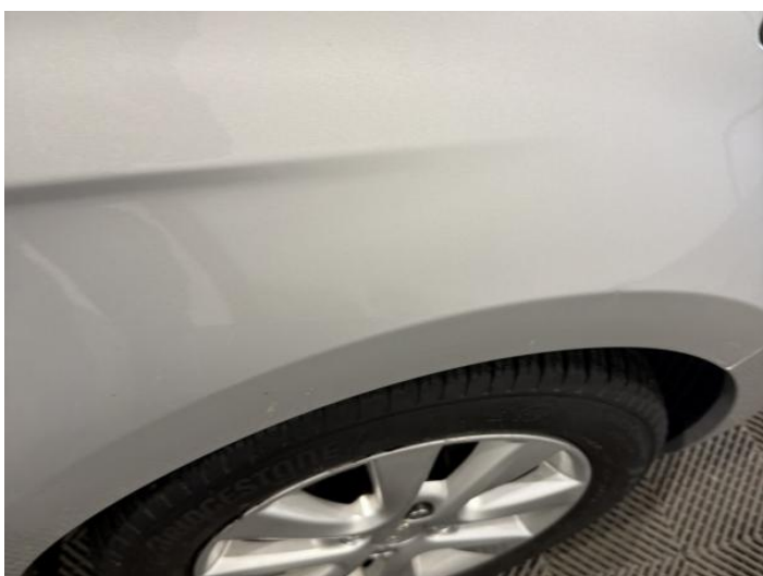
17: Wing osf Dented Over 2 UpTo 10mm