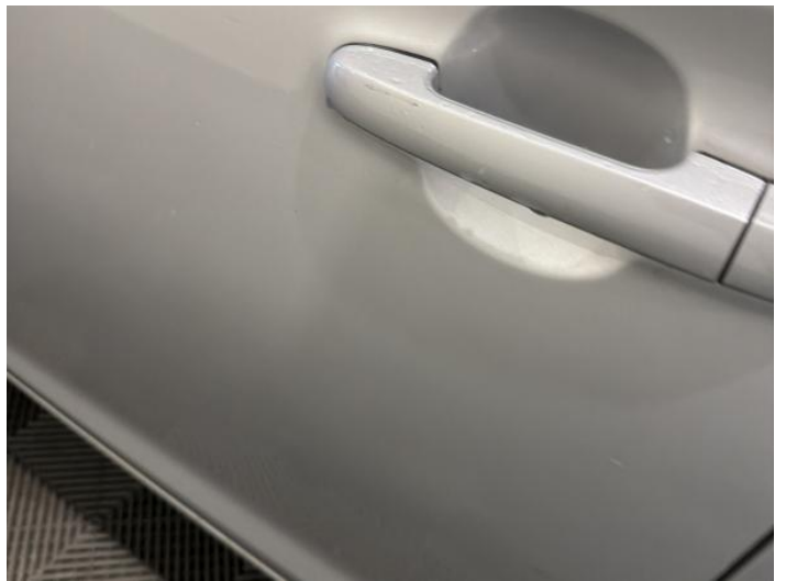
6: Door nsr Chipped Multiple Chips