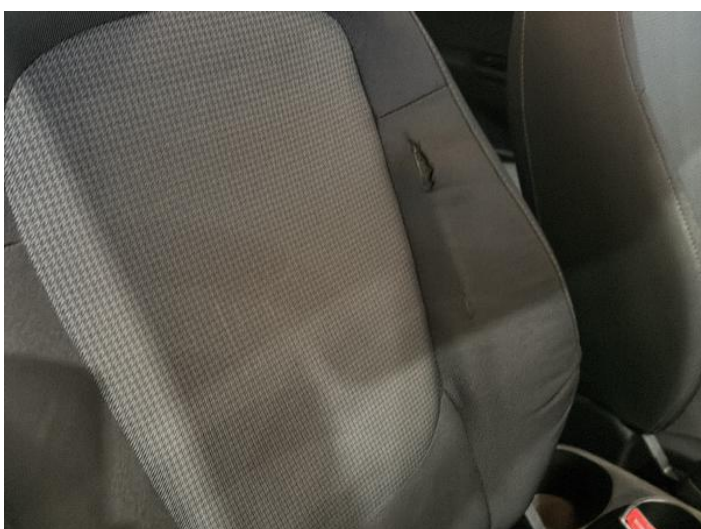
19: Seat Back Cover osf Torn Over 3mm