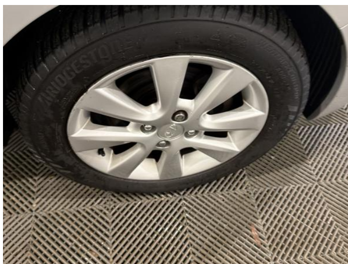
18: Wheel osf Scratched Over 50mm