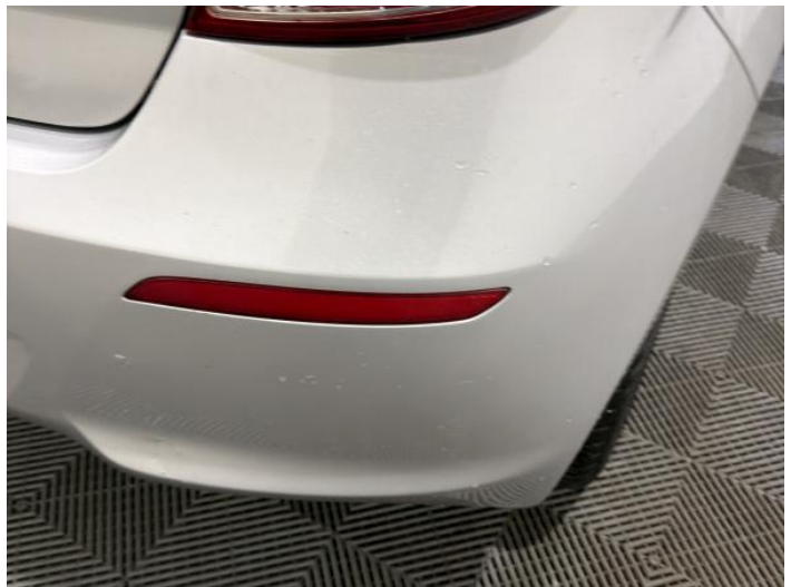
10: Bumper Rear Scratched 25 to 100mm Thru Paint