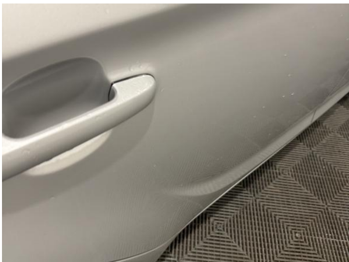
15: Door osr Chipped 1 To 5