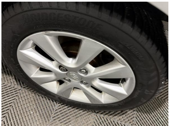
8: Wheel nsr Scratched Over 50mm