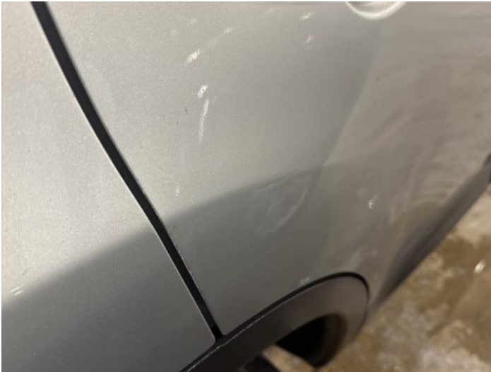
15: Door osr Scratched Over 25mm Thru Paint