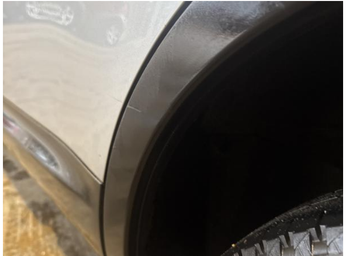
10: Qtr Panel Moulding ns Scuffed (Unpainted) UpTo 100mm