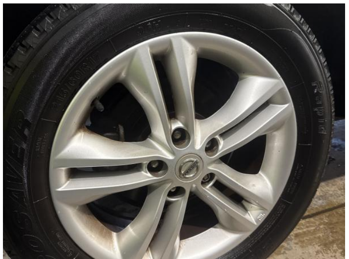
14: Wheel osr Scratched Up To 50mm