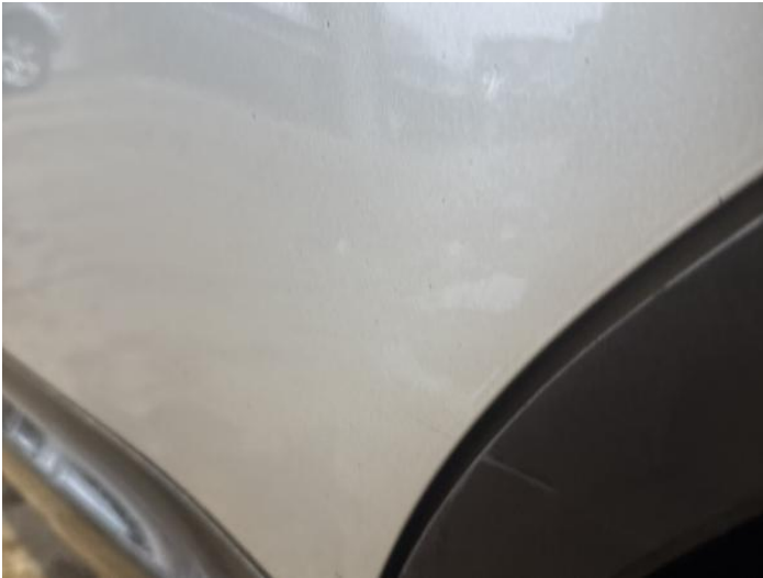
9: Door nsr Scratched UpTo 25mm Thru Paint