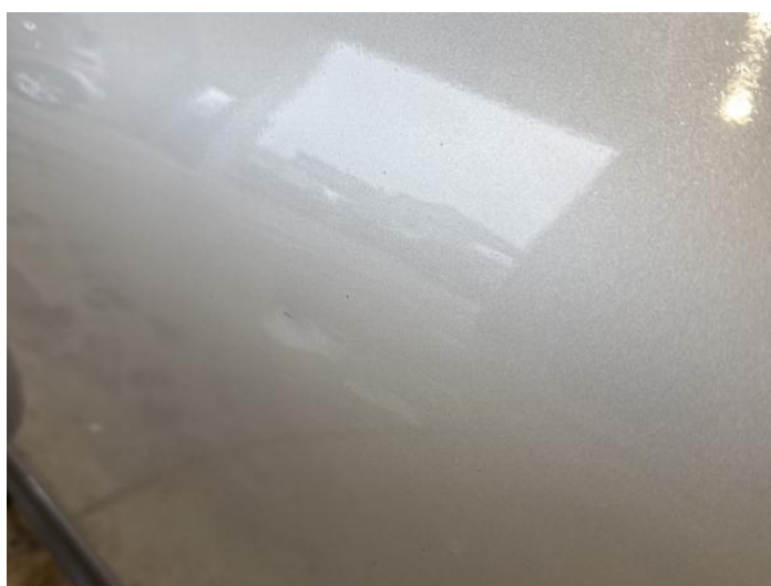
8: Door nsf Dented Between 10mm + 30mm