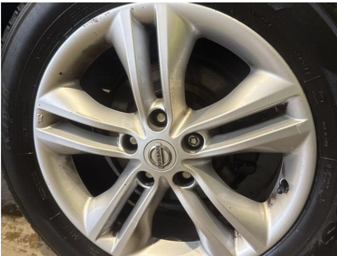
11: Wheel nsr Scratched Over 50mm