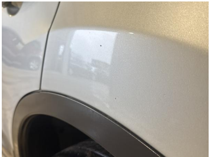
12: Qtr Panel nsr Dented Between 10mm + 30mm