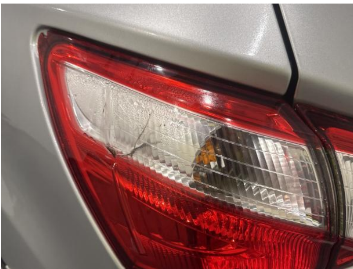
19: Lamp nsr Broken Replace