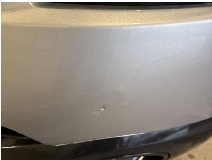
3: Bumper Front Dented With Paint Damage