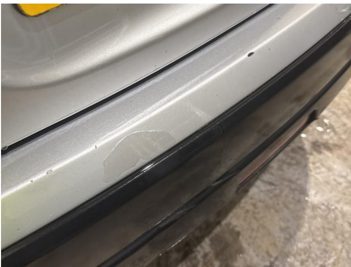
13: Bumper Rear Poor Previous Repair Paint Flake