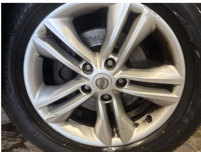
5: Wheel nsf Scratched Over 50mm