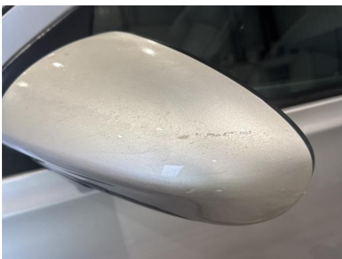
7: Door Mirror Assy nsf Scratched (Painted) Over 25mm Thru Paint