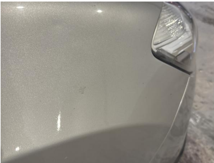
17: Wing osf Scratched UpTo 25mm Thru Paint