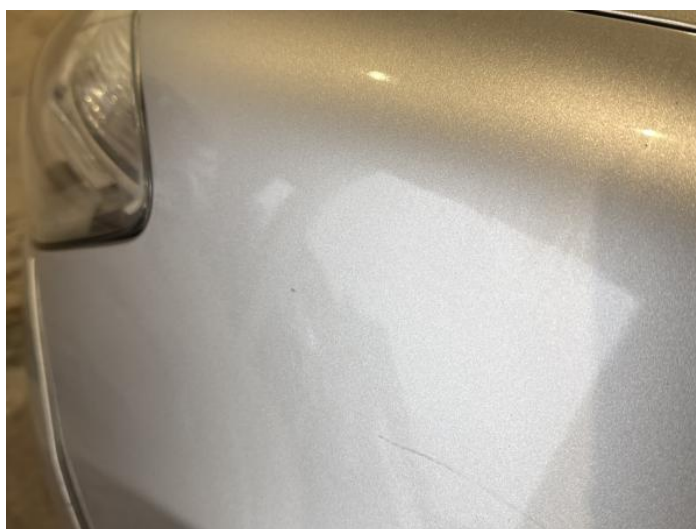
6: Wing nsf Scratched Over 25mm Thru Paint