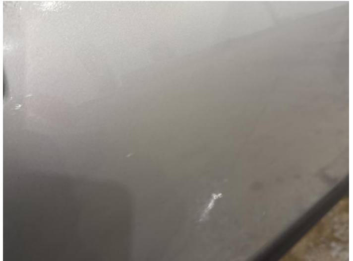
16: Door osf Scratched UpTo 25mm Thru Paint