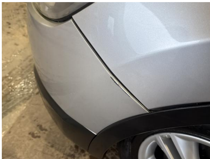
2: Bumper Front Insecure Action Required