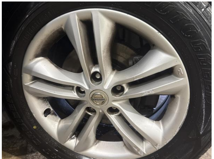
18: Wheel osf Scratched Over 50mm