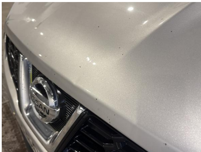
4: Bonnet Dented Over 30mm