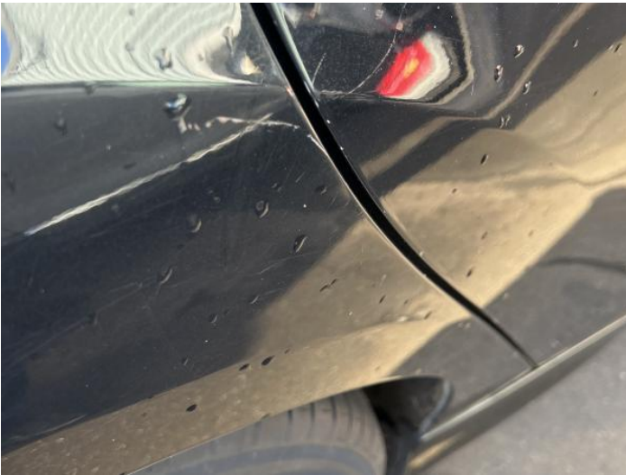
5: Qtr Panel osr Scratched Over 25mm Not Thru Paint