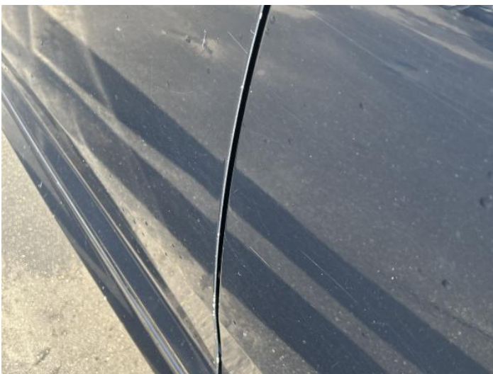
13: Door nsf Chipped Edge Chip