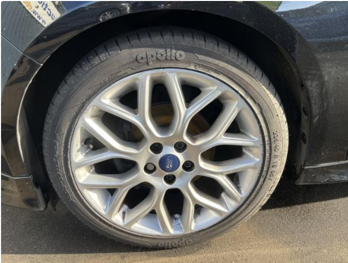
15: Wheel nsf Scratched Over 50mm