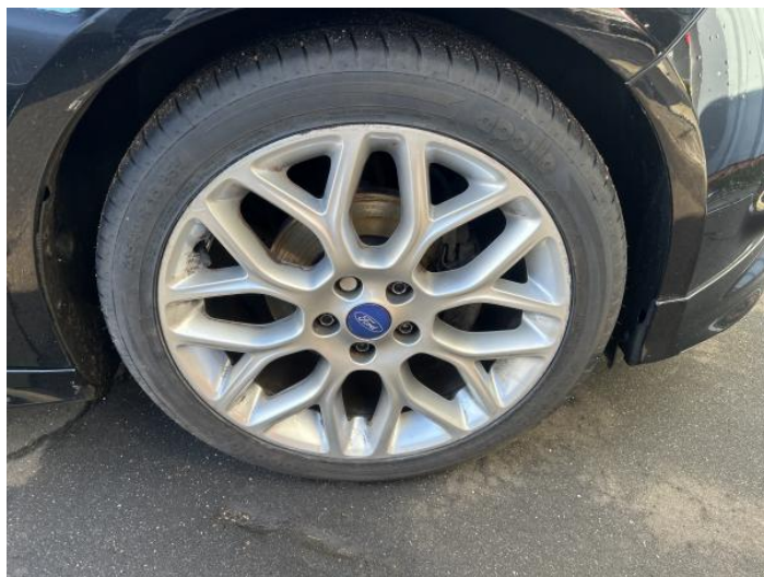
2: Wheel osf Scratched Over 50mm