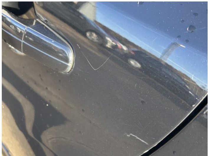
12: Door nsr Scratched Over 25mm Not Thru Paint