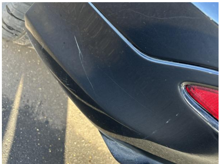
8: Bumper Rear Scratched Over 25mm Not Thru Paint