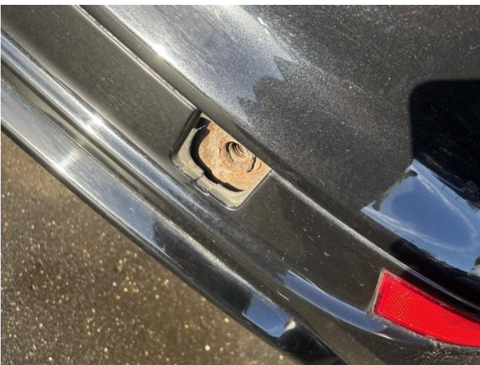
7: Rear TowEye Cvr Missing Replace