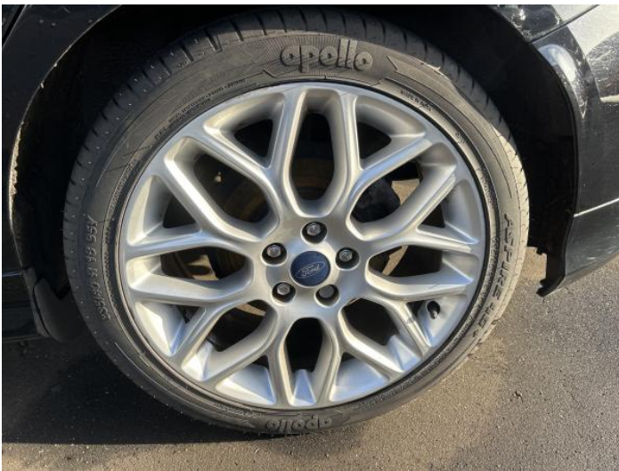
11: Wheel nsr Scratched Up To 50mm