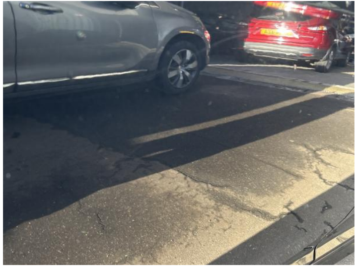
4: Door osr Scratched Over 25mm Not Thru Paint