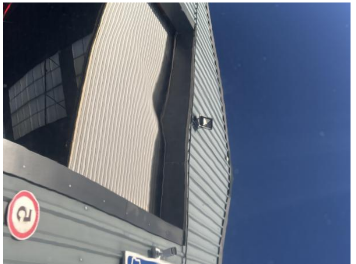
18: Bonnet Dented Over 30mm