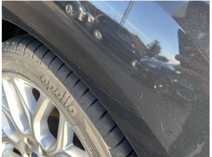
10: Qtr Panel nsr Scratched Over 25mm Not Thru Paint