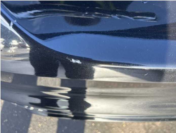
9: Bumper Rear Chipped 1 To 5