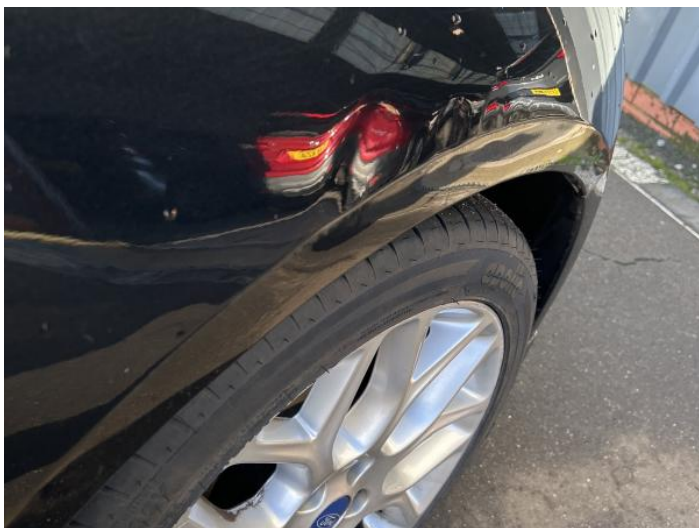
1: Wing osf Dented Over 30mm