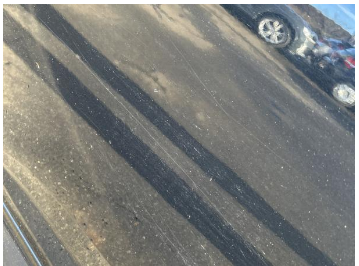
14: Door nsf Scratched Over 25mm Not Thru Paint