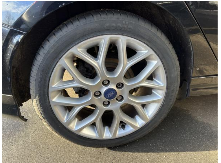
6: Wheel osr Scratched Up To 50mm