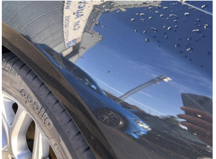
16: Wing nsf Scratched Over 25mm Not Thru Paint