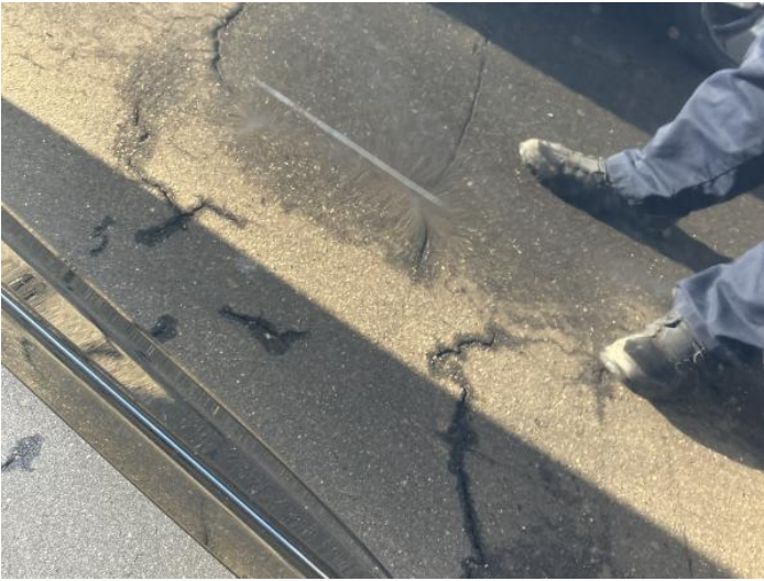
3: Door osf Scratched Over 25mm Thru Paint