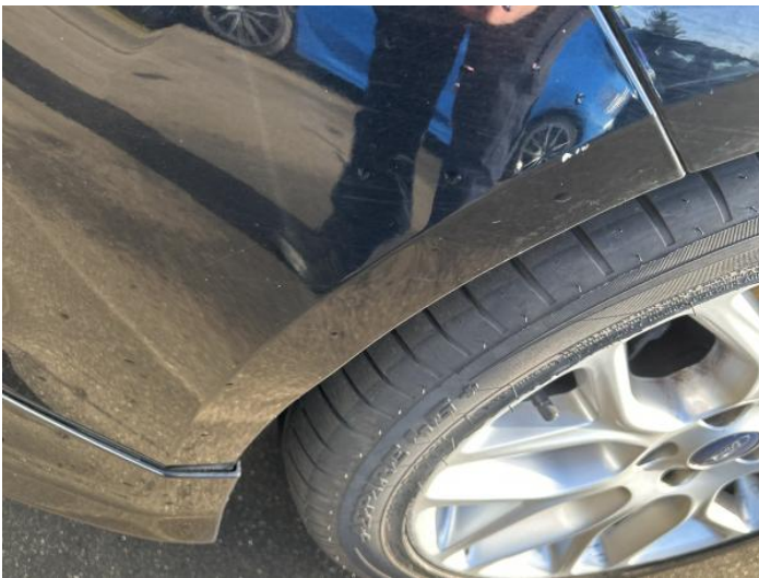
17: Bumper Front Chipped 1 To 5