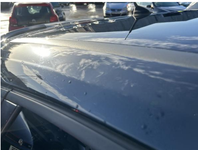
19: C Post os Dented Over 30mm