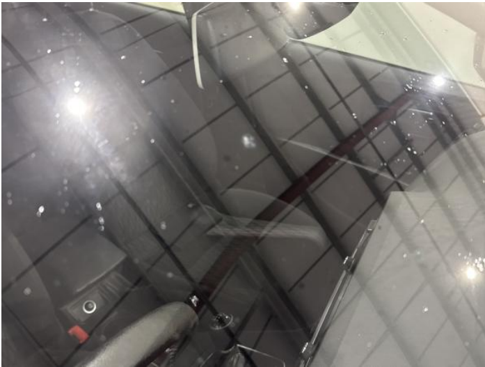
17: Screen Front Chipped UpTo 10mm