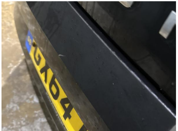
10: Bumper Rear Scratched 25 to 100mm Thru Paint