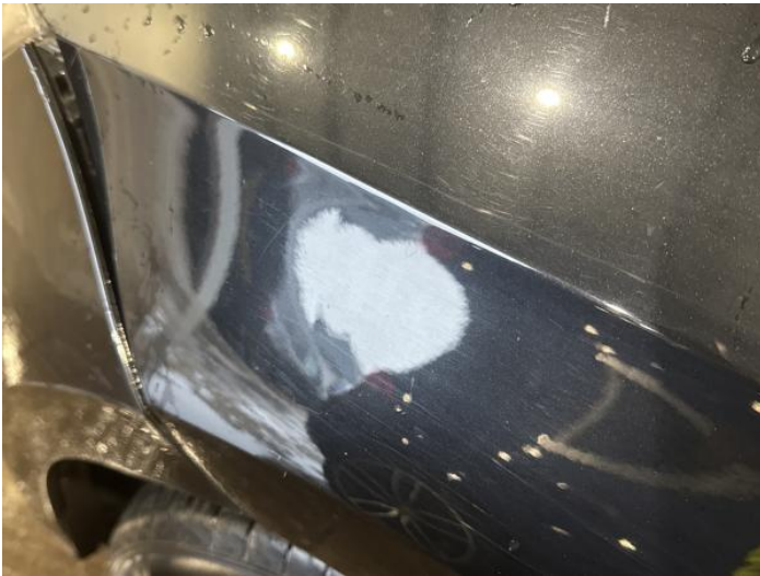
5: Wing nsf Scratched UpTo 25mm Thru Paint