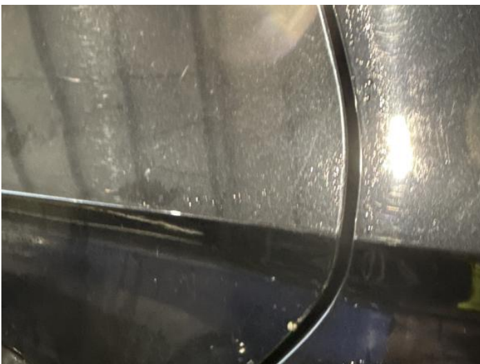
7: Door osr Chipped 1 To 5