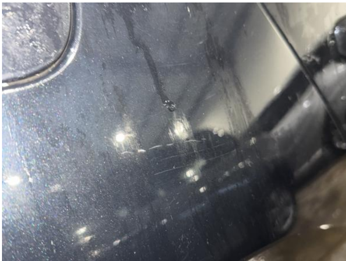
11: Qtr Panel osr Scratched Over 25mm Thru Paint