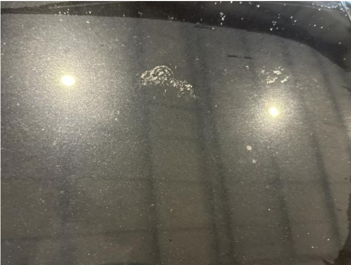
16: Roof Scratched Over 25mm Thru Paint