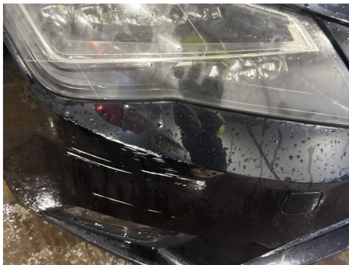
2: Bumper Front Scratched Over 100mm Thru Paint