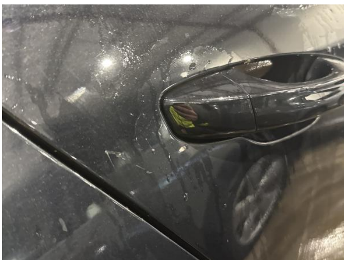
13: Door osr Scratched Over 25mm Thru Paint