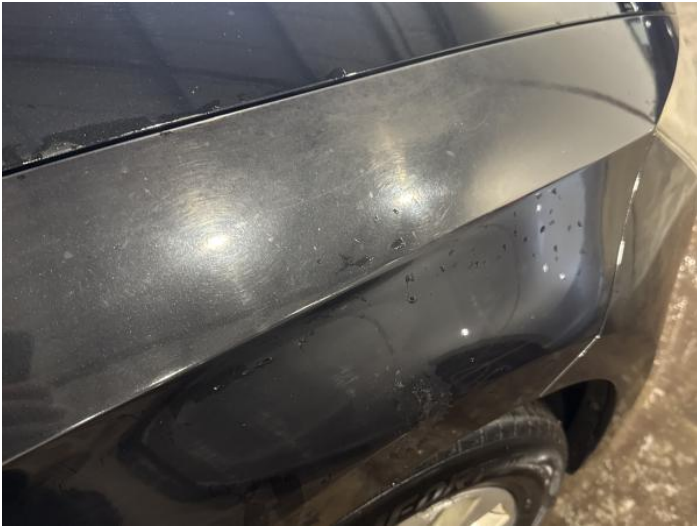
15: Wing osf Scratched Over 25mm Thru Paint