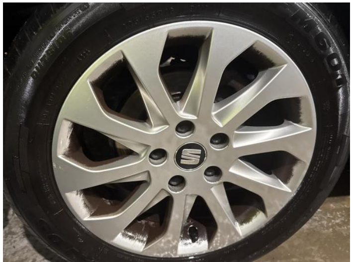
12: Wheel osr Scratched Up To 50mm