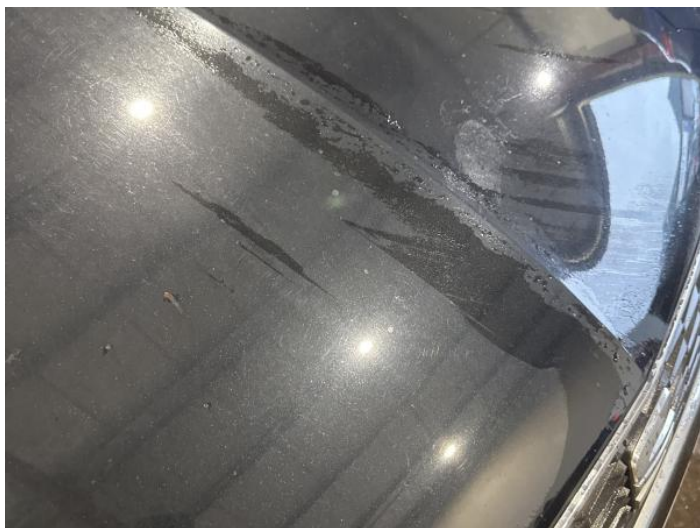
1: Bonnet Chipped Multiple Chips