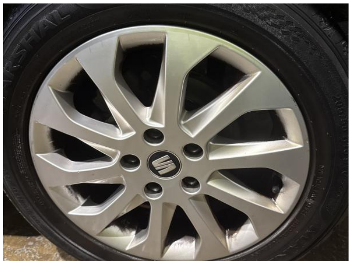
8: Wheel osr Scratched Over 50mm