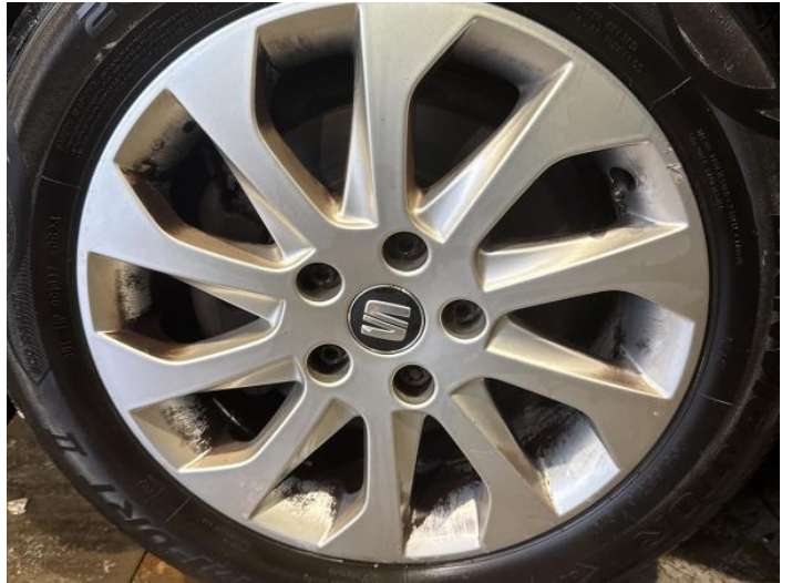
4: Wheel nsf Scratched Over 50mm