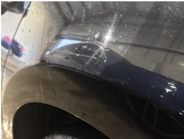
9: Qtr Panel nsr Dented Between 10mm + 30mm