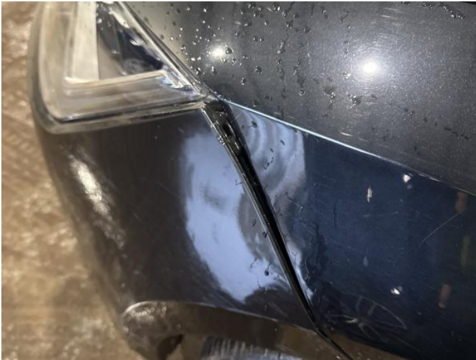
3: Bumper Front Insecure Action Required