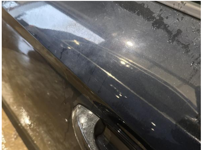
6: Door nsf Scratched Over 25mm Thru Paint