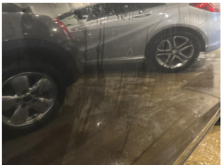
14: Door osf Scratched Over 25mm Thru Paint