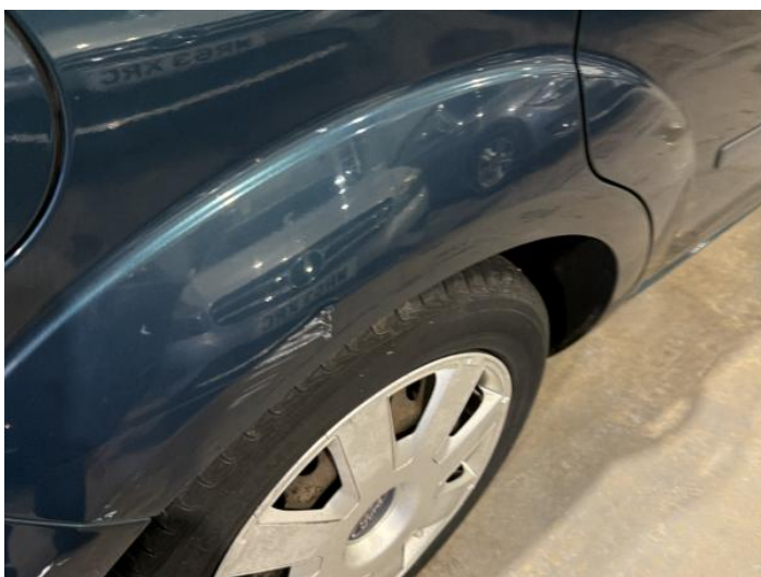
13: Qtr Panel osr Dented With Paint Damage