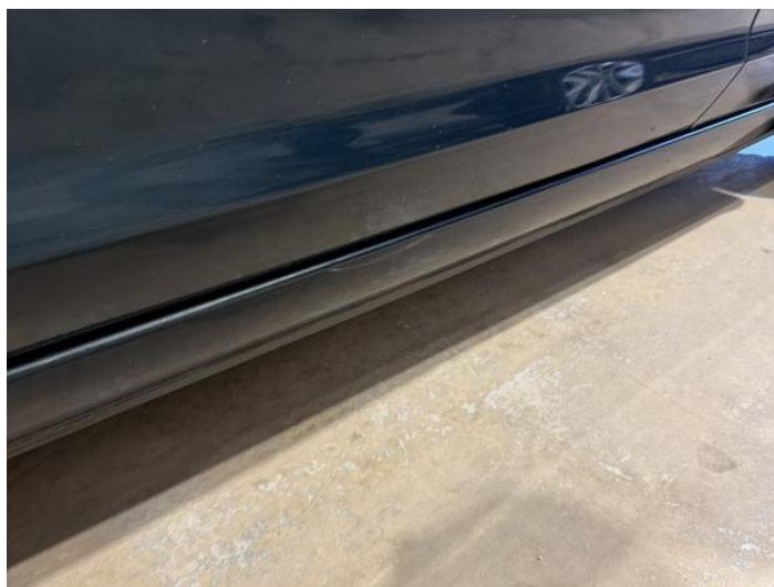
6: Sill ns Scratched Over 25mm Thru Paint