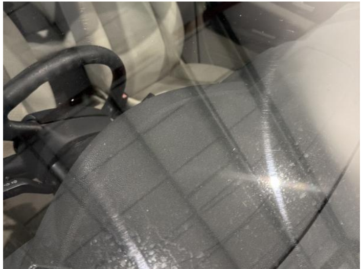
18: Screen Front Chipped UpTo 10mm