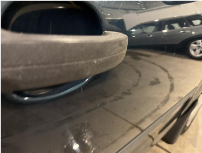
15: Door osf Dented Over 30mm