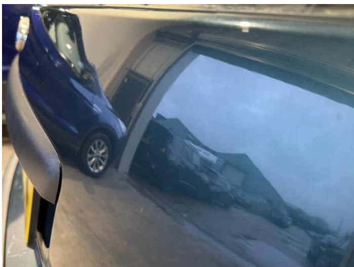
11: Boot Lid Dented Between 10mm + 30mm