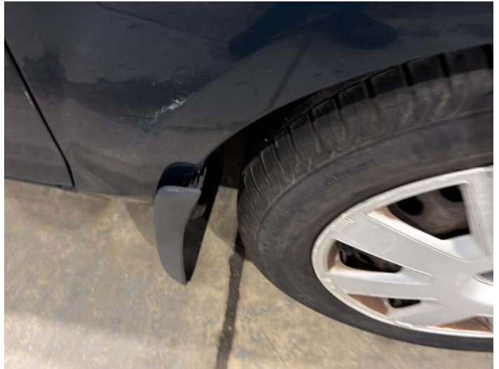
16: Moulding osf Wing Broken Replace