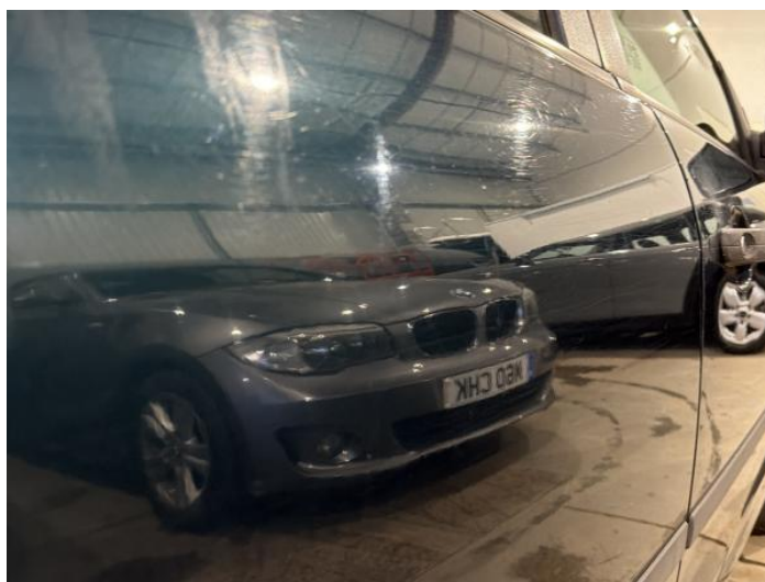
14: Door osr Poor Previous Repair Poor Paint