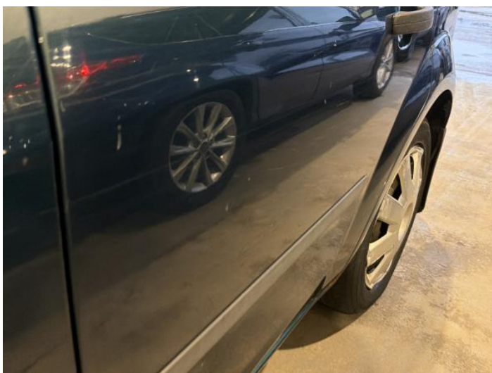
7: Door nsr Dented With Paint Damage