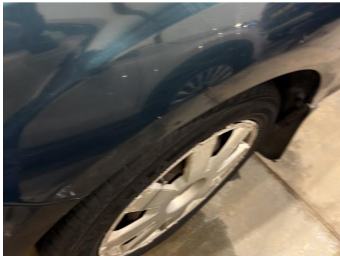
4: Wing nsf Dented With Paint Damage