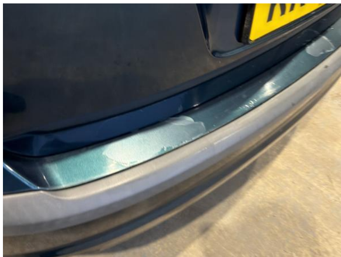
10: Bumper Rear Poor Previous Repair Paint Flake