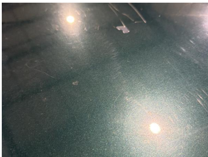
8: Roof Poor Previous Repair Paint Flake