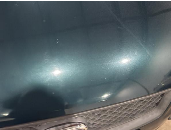
1: Bonnet Dented With Paint Damage