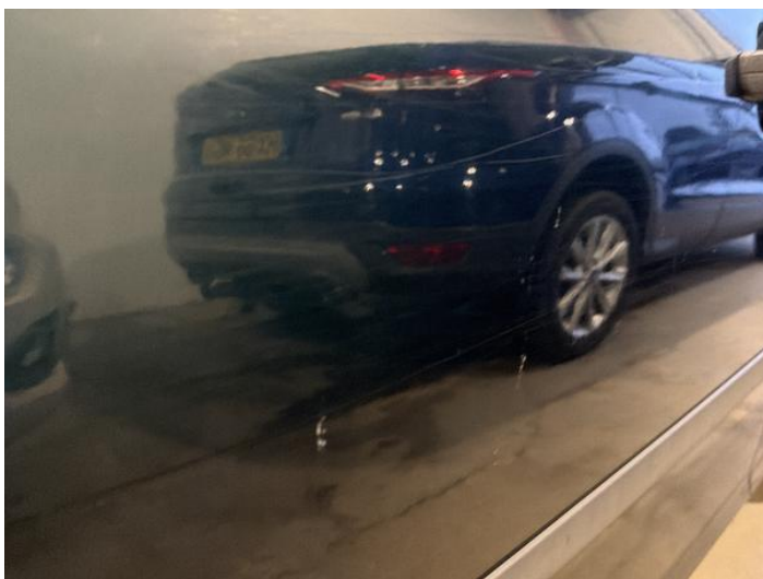
5: Door nsf Chipped Multiple Chips