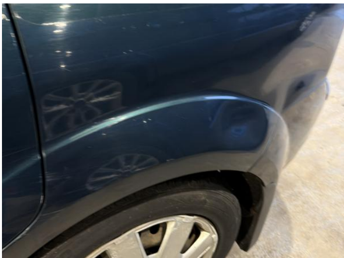
9: Qtr Panel nsr Dented With Paint Damage