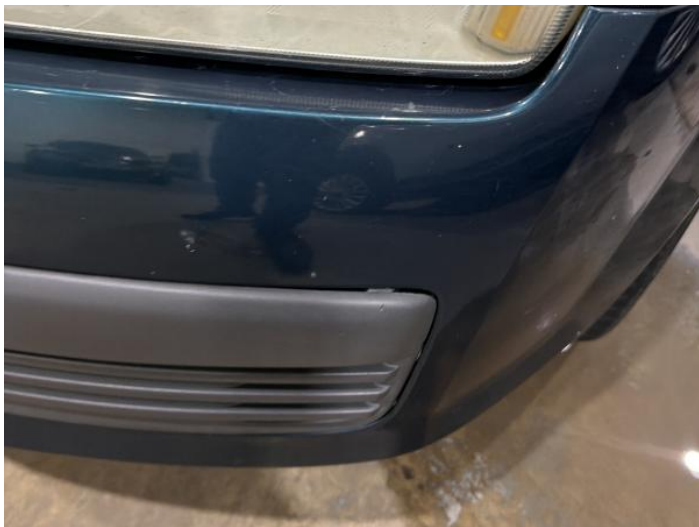
3: Bumper Front Moulding Broken Replace