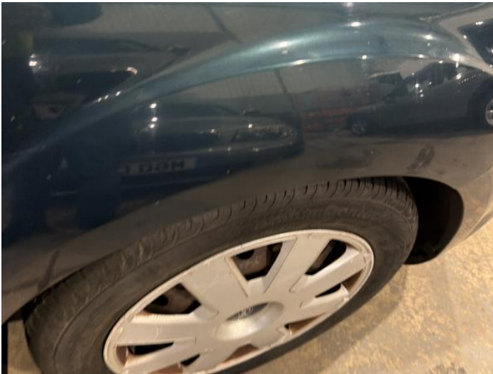
17: Wing osf Chipped Multiple Chips