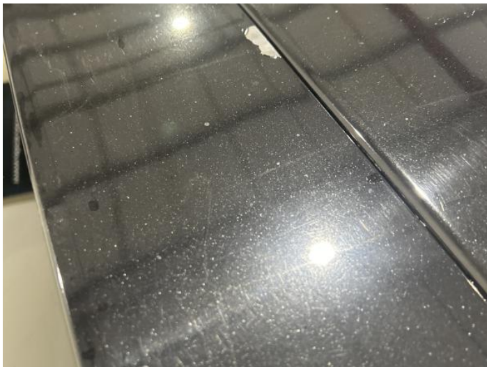
15: Boot Lid Poor Previous Repair Paint Flake