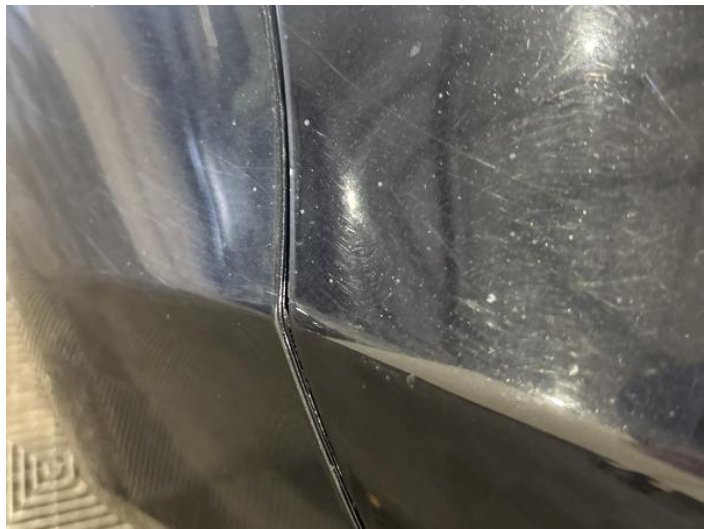
12: Wing nsf Chipped 1 To 5