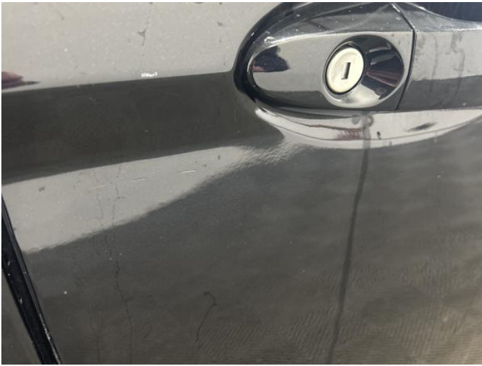
5: Door osf Chipped 1 To 5