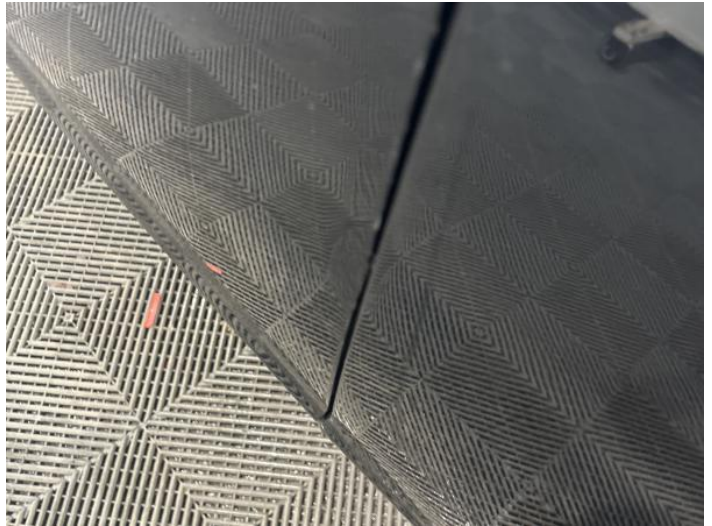
10: Door nsf Dented Between 10mm + 30mm