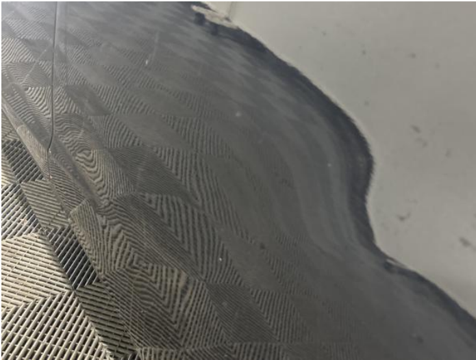
9: Qtr Panel nsr Scratched Over 25mm Not Thru Paint