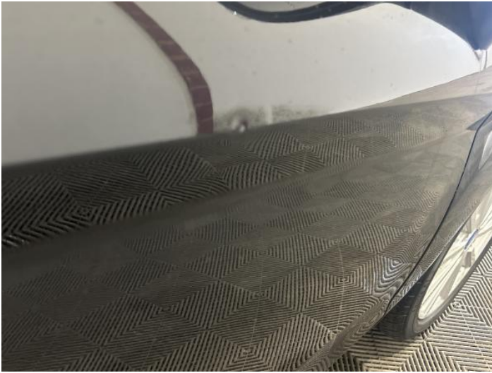
3: Door osf Dented Between 10mm + 30mm