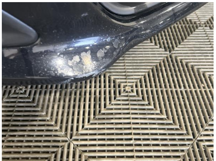
14: Bumper Front Poor Previous Repair Paint Flake