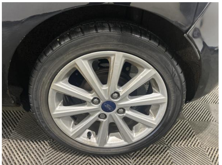
8: Wheel nsr Scratched Over 50mm