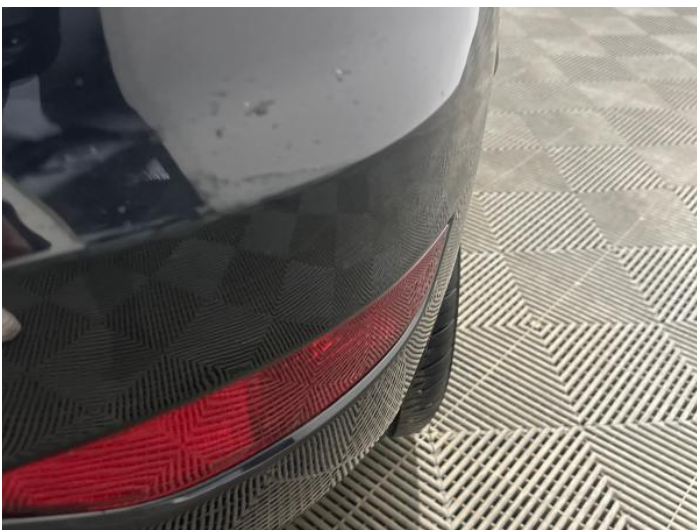
7: Bumper Rear Scratched Over 25mm Not Thru Paint