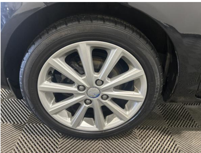
13: Wheel nsf Scratched Up To 50mm