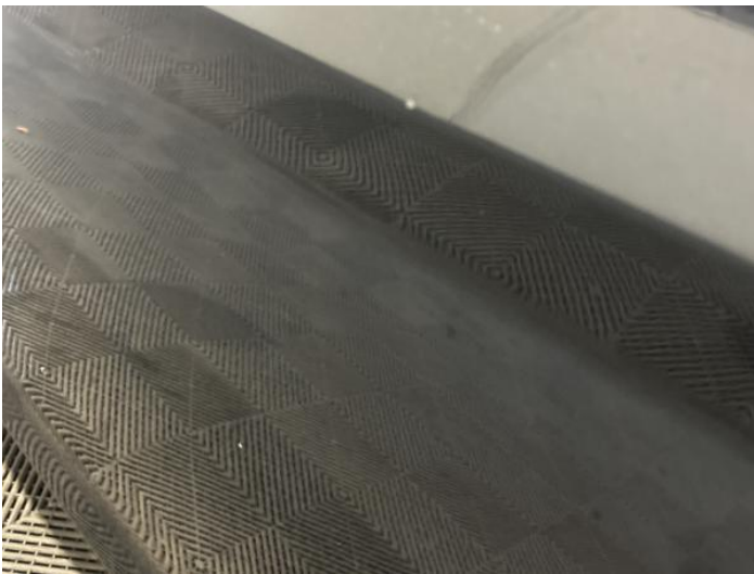
11: Door nsf Chipped 1 To 5