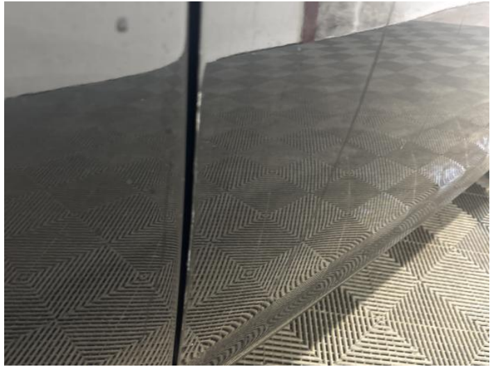
4: Door osf Chipped Edge Chip