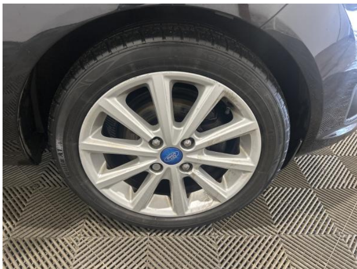
1: Wheel osf Scratched Over 50mm