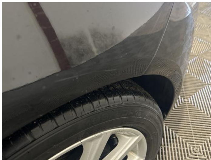
2: Wing osf Scratched Over 25mm Not Thru Paint