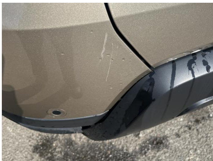
2: Bumper Rear Scratched 25 to 100mm Thru Paint