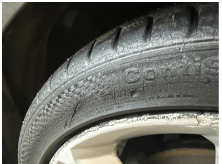
20: Tyre nsf Damaged Replace