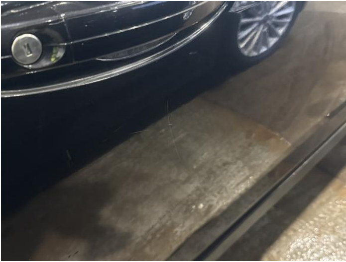
15: Door osf Scratched Over 25mm Thru Paint