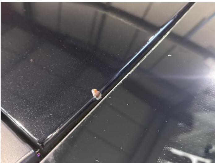
19: Roof Chipped Over 5mm