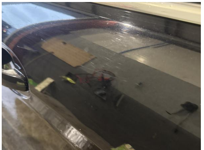
8: Door nsr Dented Between 10mm + 30mm