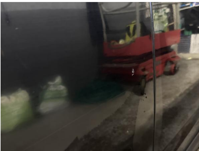
7: Door nsf Scratched Over 25mm Thru Paint