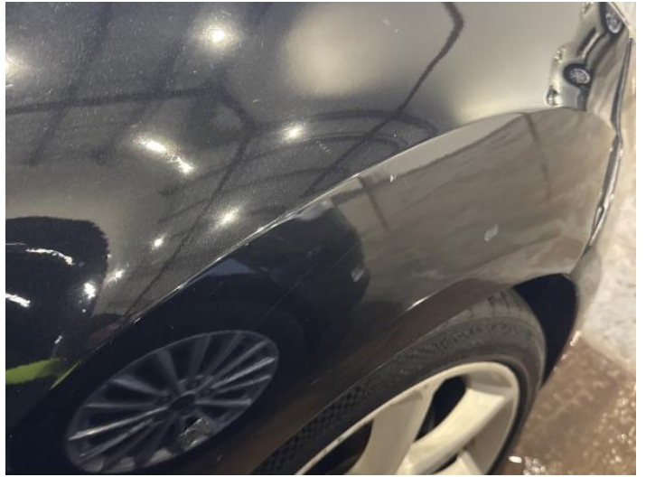
16: Wing osf Scratched Over 25mm Thru Paint