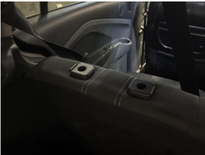
1: Headrest Assy Rear Seat ns Missing Replace