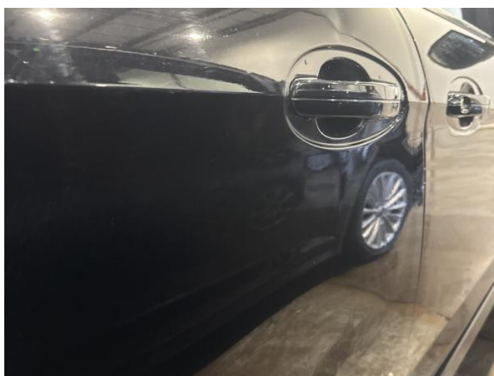
14: Door osr Dented With Paint Damage