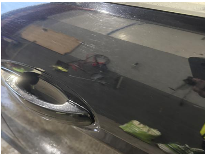
9: Door nsr Scratched Over 25mm Thru Paint