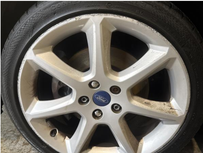
5: Wheel nsf Scratched Over 50mm