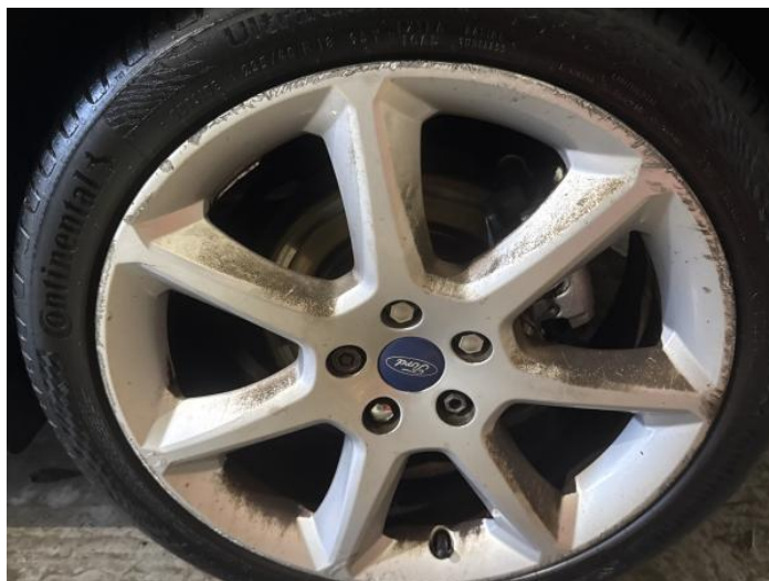
10: Wheel nsr Scratched Over 50mm