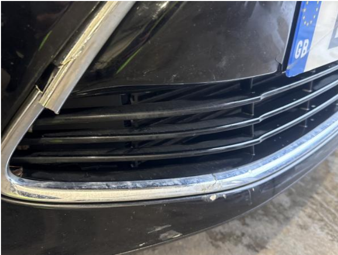
3: Bumper Front Grill Broken Replace