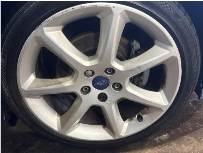
17: Wheel osf Scratched Over 50mm