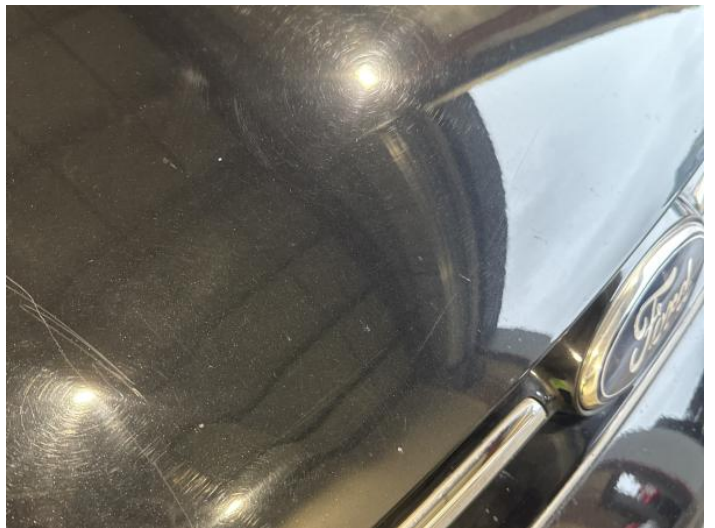
2: Bonnet Scratched Over 25mm Thru Paint