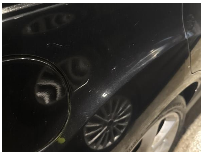
12: Qtr Panel osr Scratched Over 25mm Thru Paint