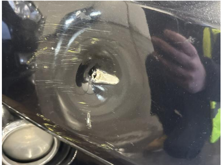
4: Bumper Front Hole Over 25mm