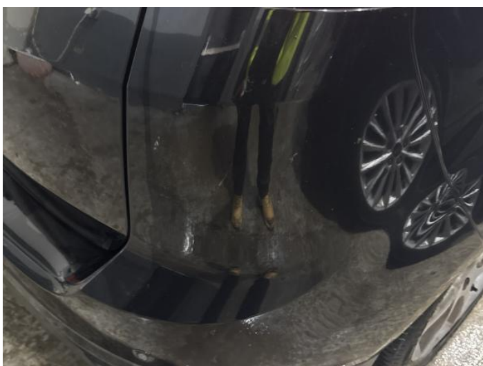
11: Bumper Rear Scratched 25 to 100mm Thru Paint