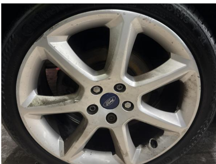
13: Wheel osr Scratched Over 50mm