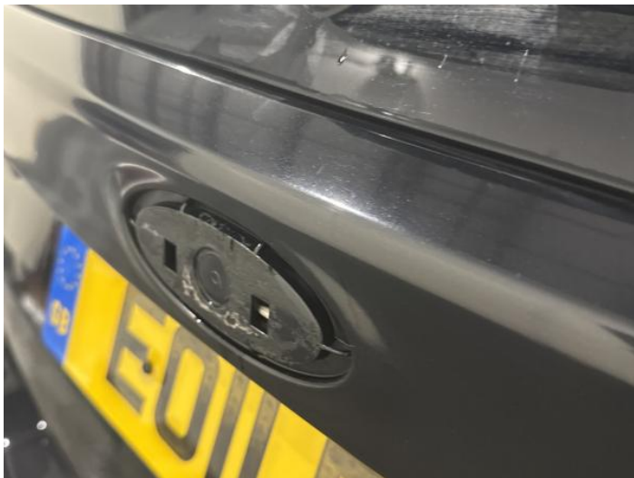
21: Badgedecal Rear Missing Replace