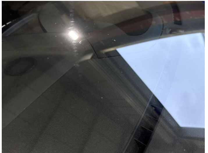
18: Screen Front Chipped UpTo 10mm