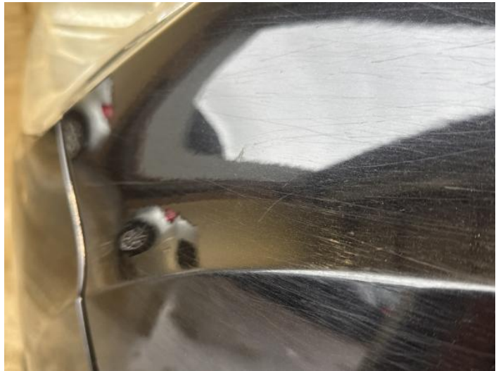
6: Wing nsf Scratched UpTo 25mm Thru Paint