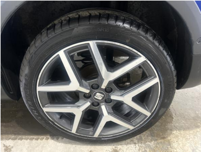
3: Wheel nsr Scratched Over 50mm