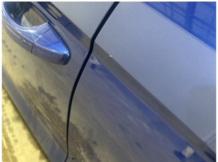
10: Door nsr Chipped 1 To 5