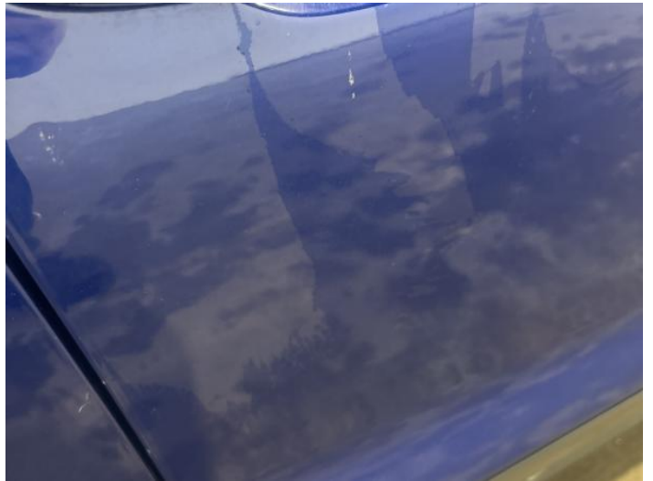
6: Door osf Chipped 1 To 5