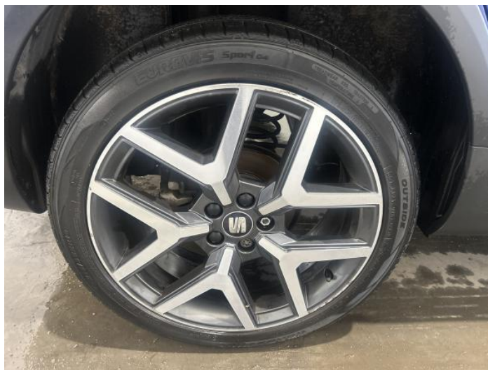
2: Wheel osr Scratched Over 50mm