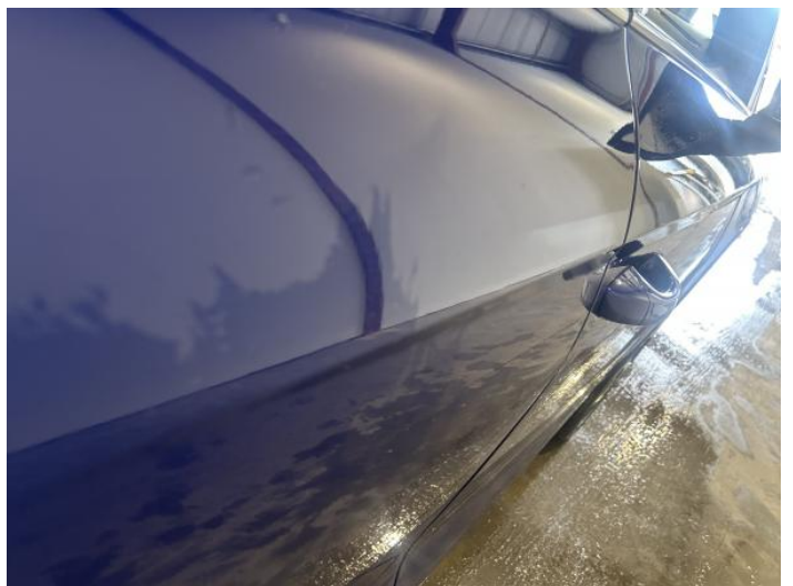
8: Door osr Dented Between 10mm + 30mm