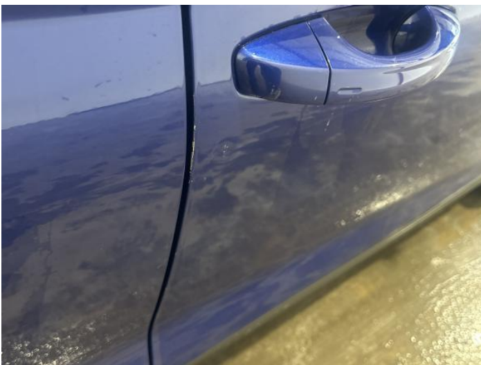
7: Door osf Chipped Edge Chip