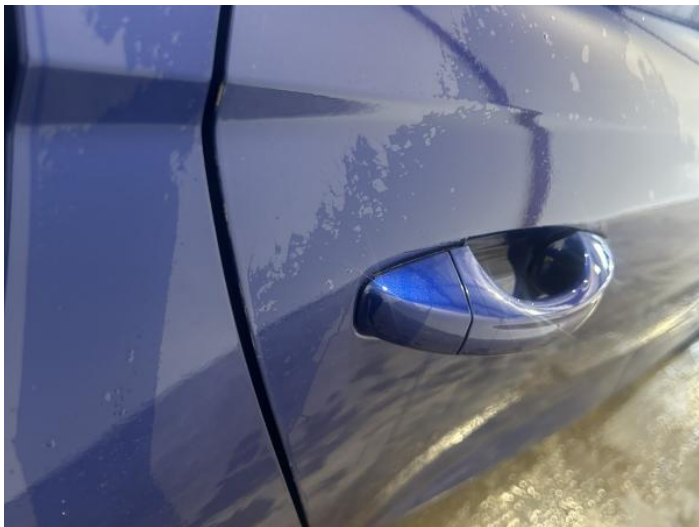
9: Door osr Chipped Edge Chip