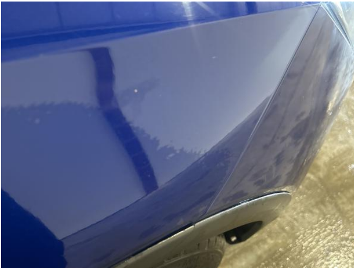
5: Wing osf Chipped 1 To 5