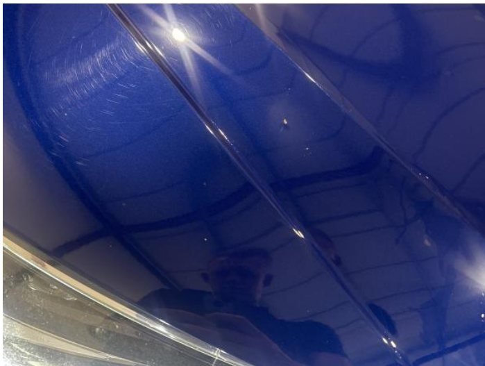
11: Bonnet Chipped 1 To 5