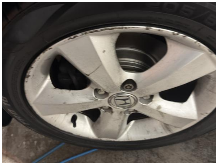
14: Wheel osr Scratched Over 50mm