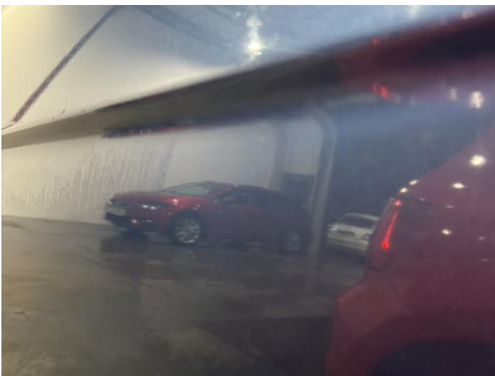
7: Door nsr Chipped Multiple Chips