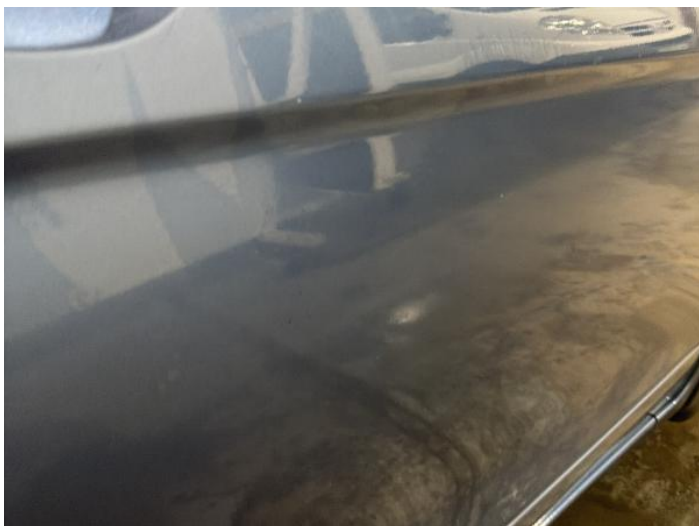
15: Door osf Chipped Multiple Chips