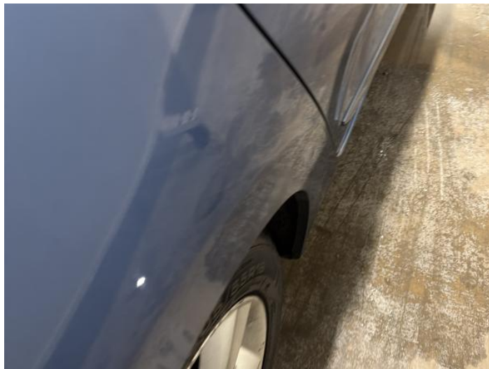
12: Qtr Panel osr Dented Over 30mm