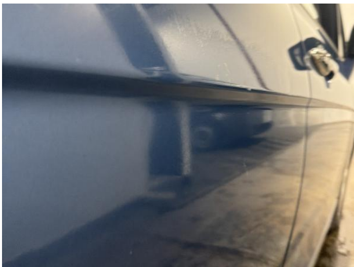
13: Door osr Dented With Paint Damage