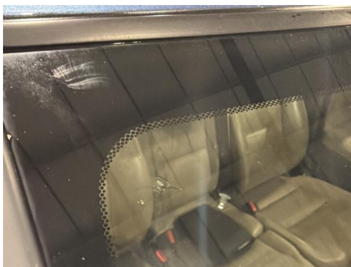
18: Screen Front Chipped UpTo 10mm