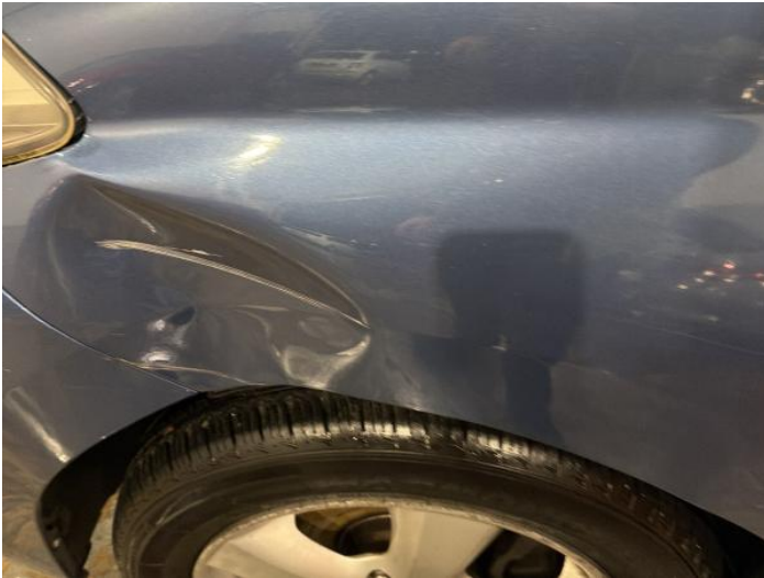
3: Wing nsf Dented With Paint Damage