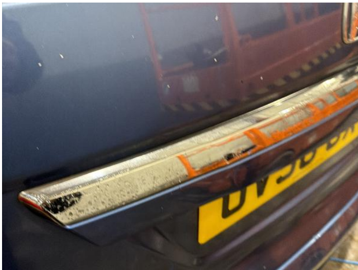
11: Boot Lid Chipped Multiple Chips