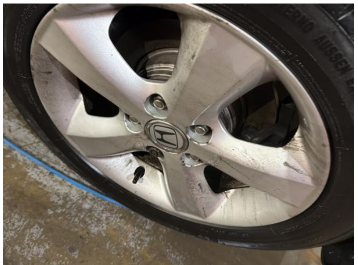
8: Wheel nsr Scratched Over 50mm