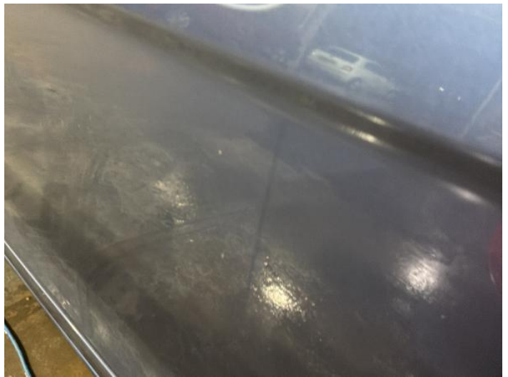
6: Door nsf Chipped Multiple Chips