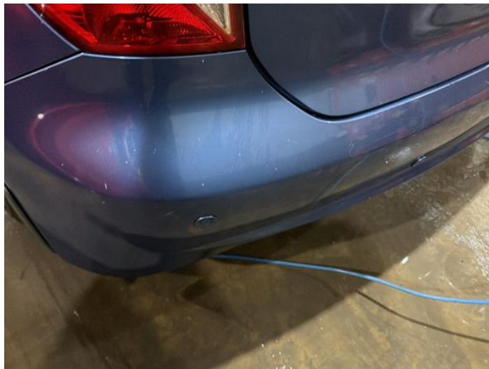
10: Bumper Rear Chipped Multiple Chips