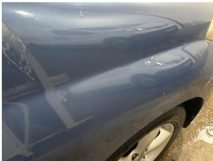
16: Wing osf Poor Previous Repair Poor Paint