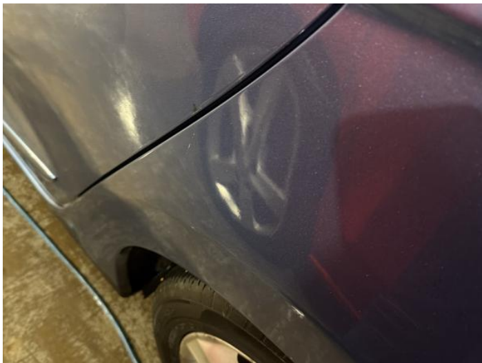
9: Qtr Panel nsr Dented With Paint Damage