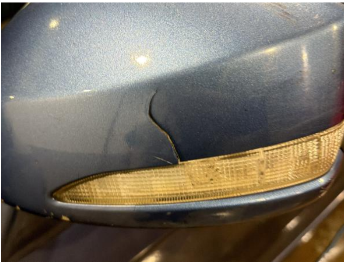
5: Door Mirror Assy nsf Broken Replace