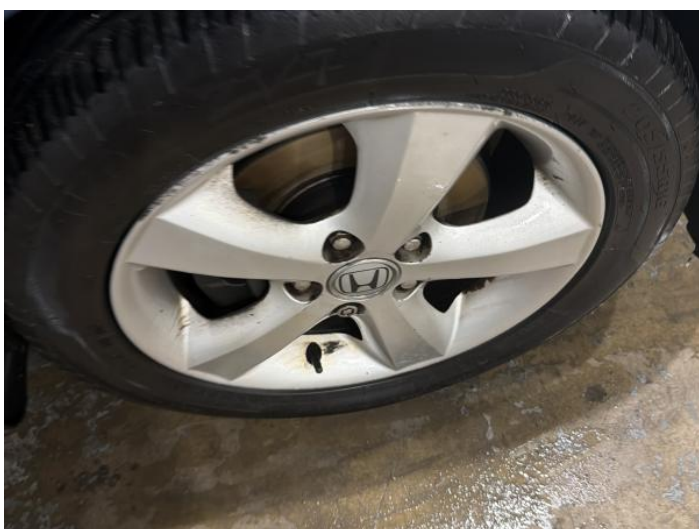
17: Wheel osf Scratched Over 50mm