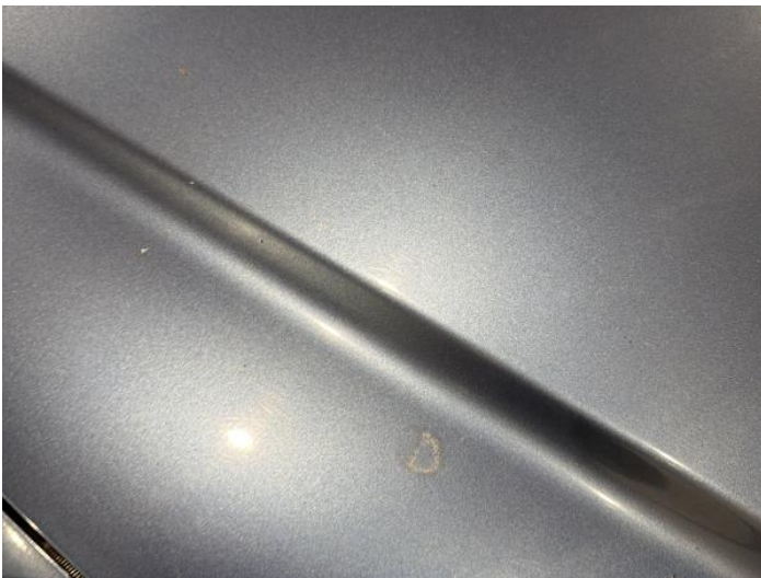
1: Bonnet Dented With Paint Damage