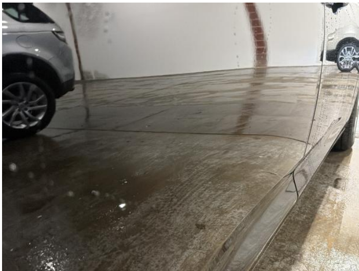
15: Door osr Chipped 1 To 5