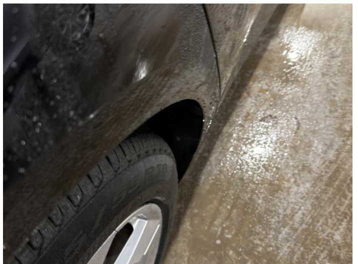
14: Qtr Panel osr Dented Between 10mm + 30mm