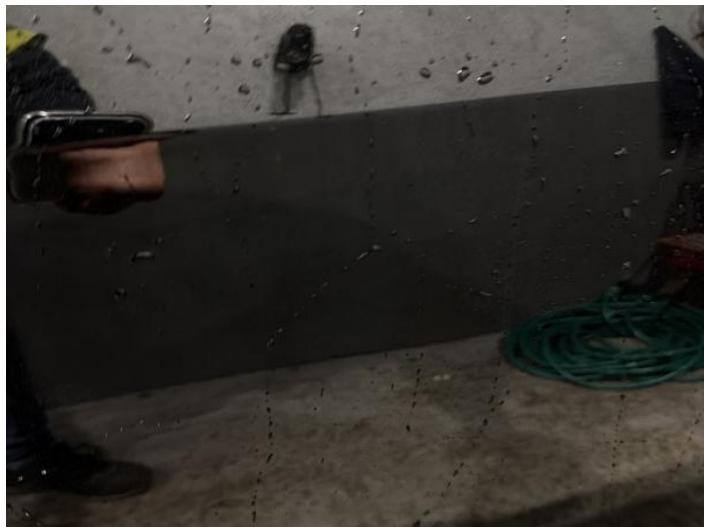
5: Wing nsf Scratched Over 25mm Not Thru Paint