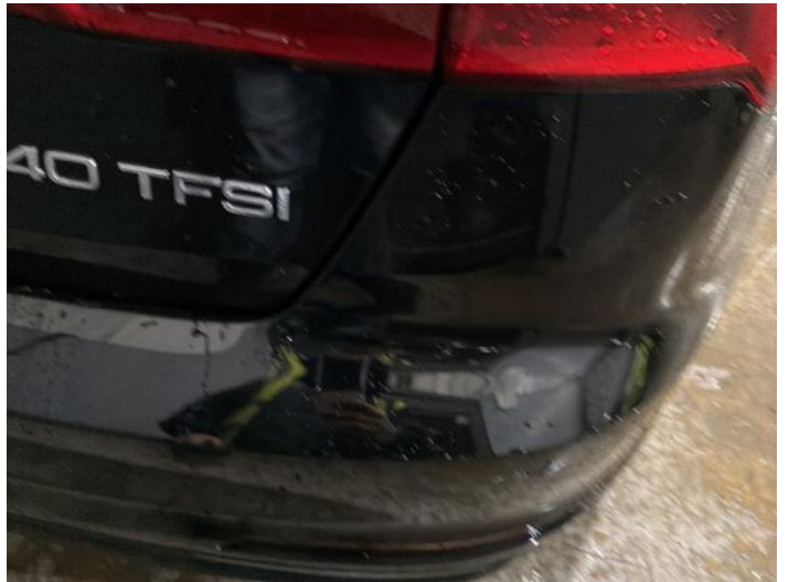
12: Bumper Rear Chipped Multiple Chips