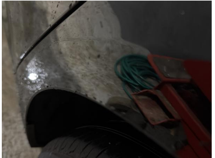
10: Qtr Panel nsr Dented Over 2 UpTo 10mm