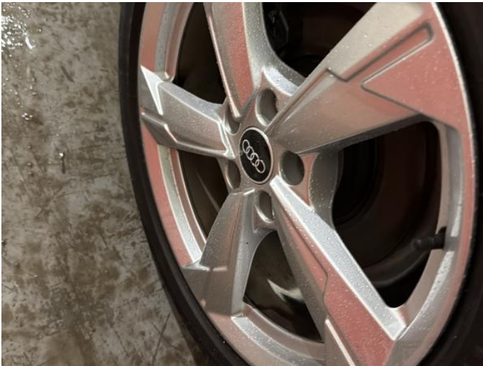
11: Wheel nsr Scratched Up To 50mm