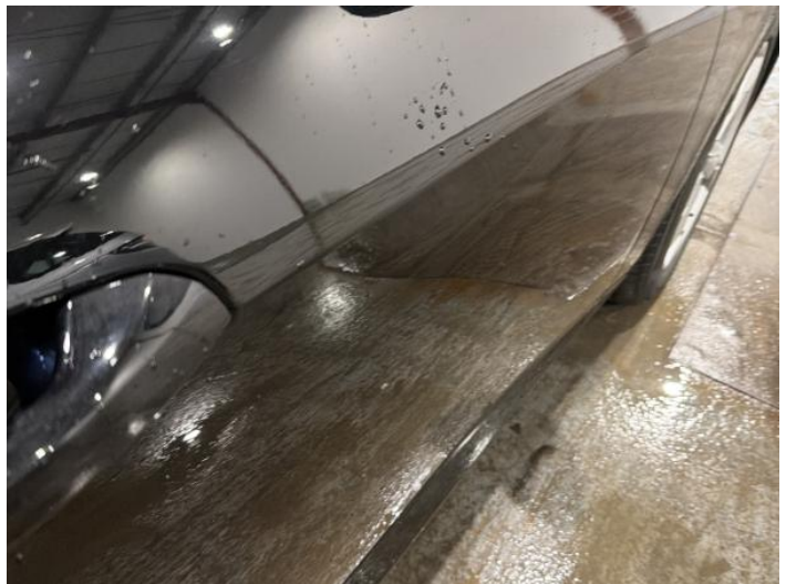
16: Door osf Dented Over 2 UpTo 10mm