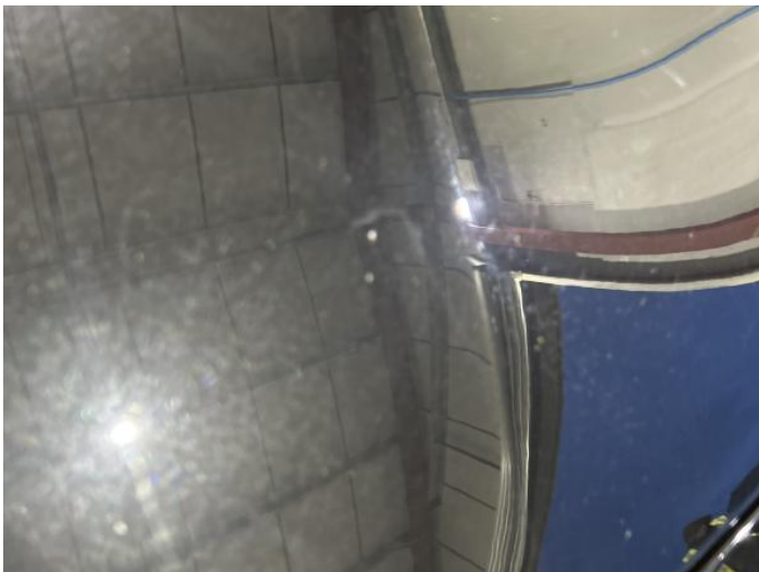
6: Bonnet Chipped 1 To 5