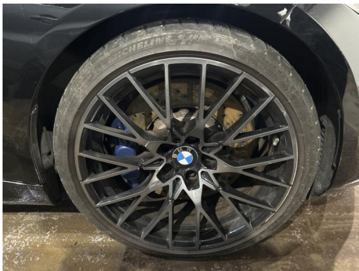
1: Wheel osf Scratched Over 50mm