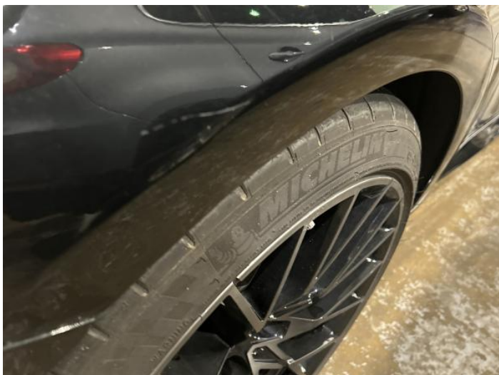
3: Qtr Panel osr Scratched UpTo 25mm Not Thru Paint