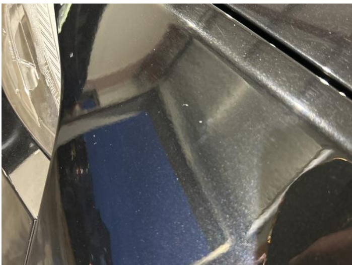
4: Wing nsf Chipped 1 To 5