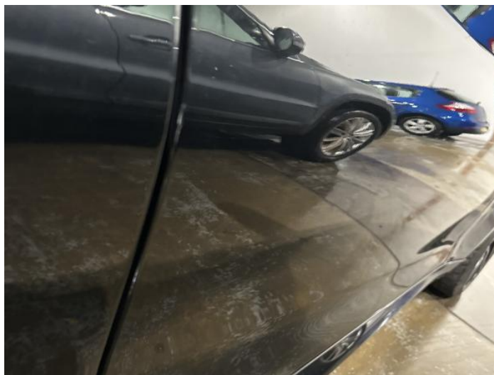
2: Door osf Chipped Edge Chip