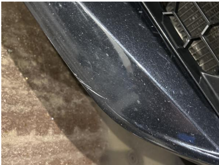
5: Bumper Front Scratched UpTo 25mm Thru Paint