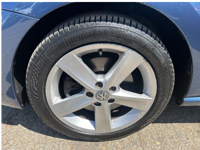
1: Wheel nsf Scratched Over 50mm