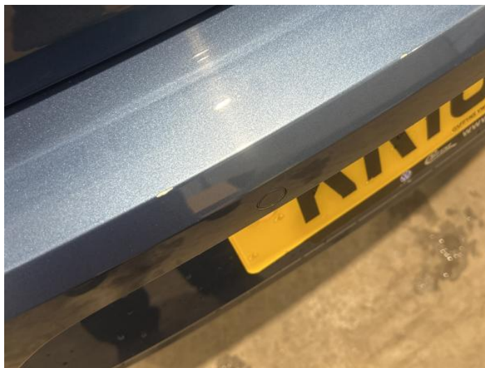
2: Bumper Rear Chipped 1 To 5