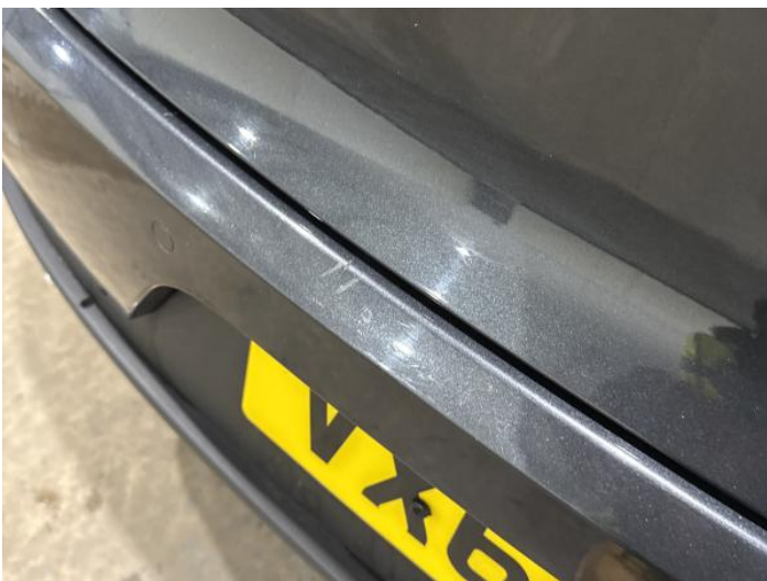
7: Bumper Rear Scratched Up To 25mm Thru Paint