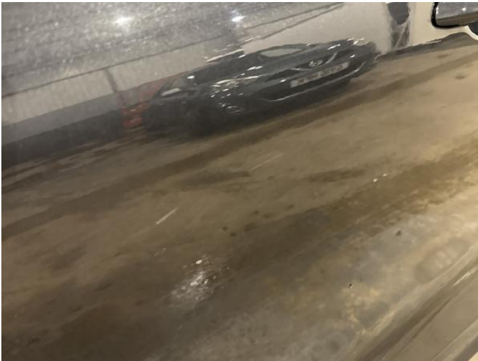
5: Door nsf Scratched Up To 25mm Thru Paint