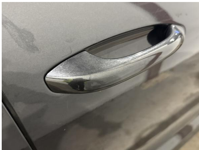
9: Door osr Dented Between 10mm + 30mm