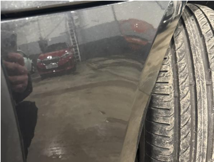
3: Bumper Front Chipped 1 To 5