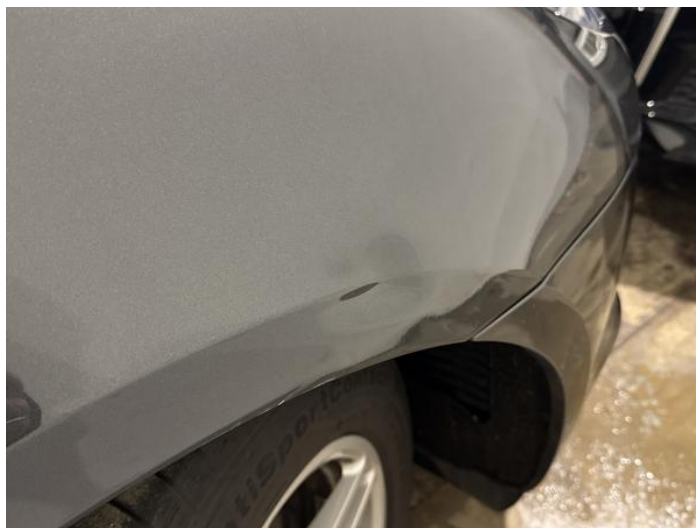
2: Bonnet Dented Over 30mm