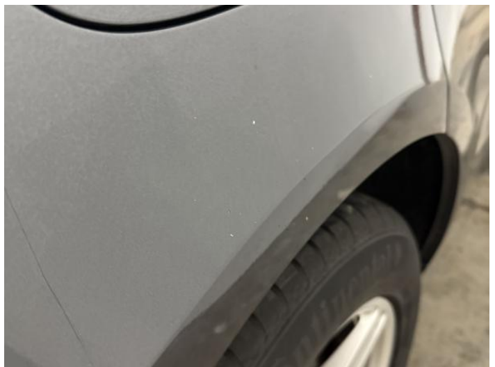
8: Qtr Panel osr Chipped 1 To 5