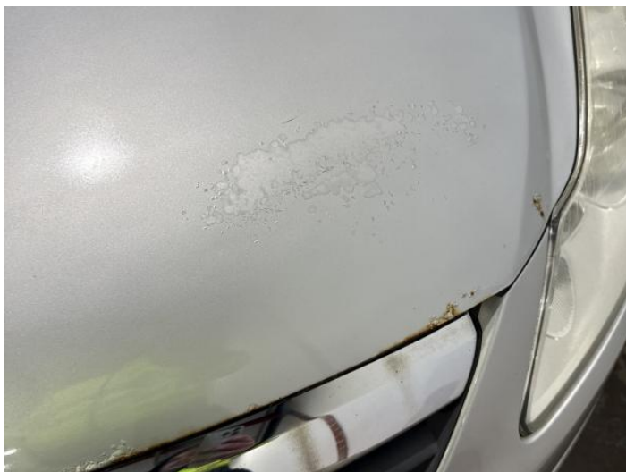
1: Bonnet Rusted Over 5mm