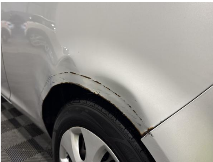
7: Qtr Panel nsr Dented With Paint Damage