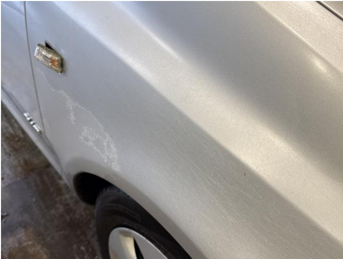
3: Wing osf Poor Previous Repair Poor Paint