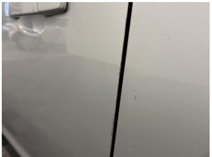
8: Door nsf Dented Between 10mm + 30mm