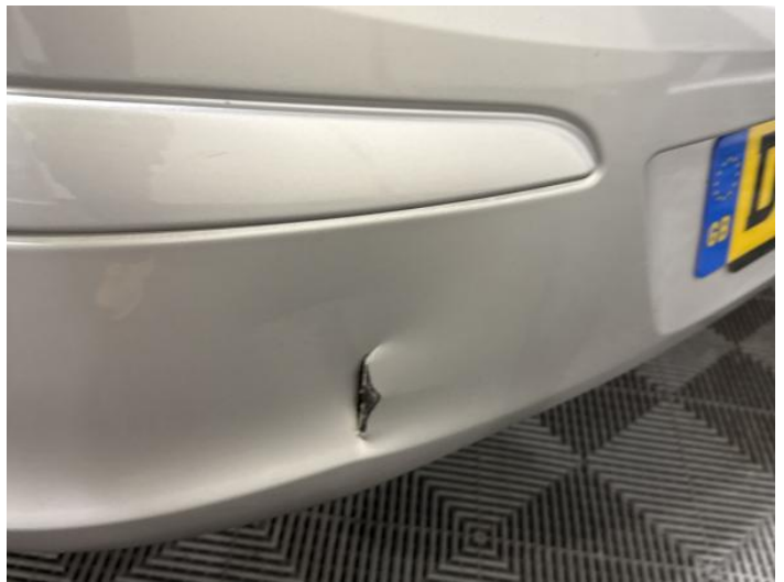
6: Bumper Rear Cracked Over 25mm