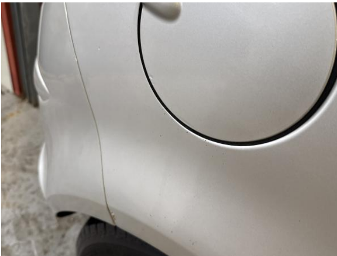
5: Qtr Panel osr Scratched Rusted