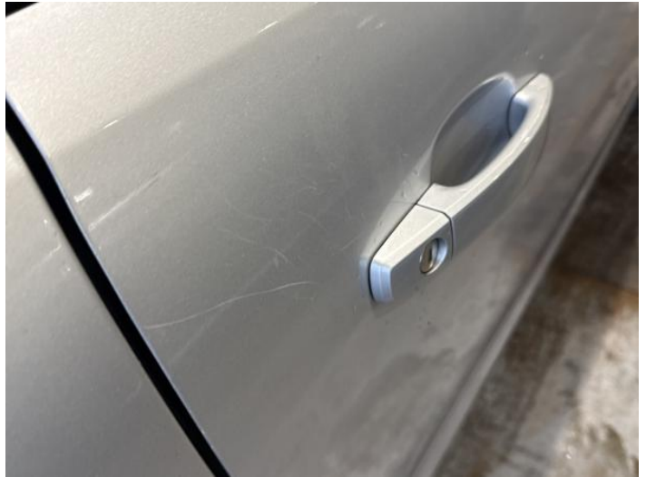
4: Door osf Scratched Over 25mm Thru Paint