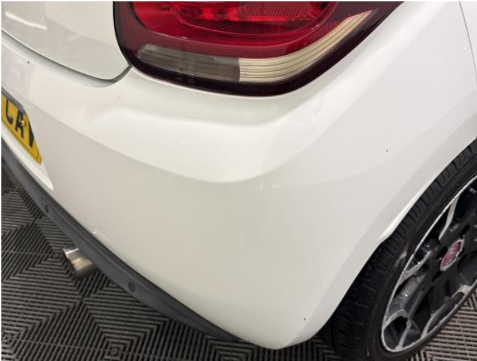
9: Bumper Rear Chipped 1 To 5