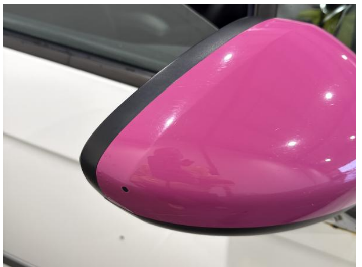
14: Door osf Scratched UpTo 25mm Thru Paint