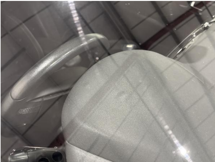
17: Screen Front Chipped UpTo 10mm