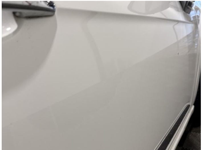
12: Door osf Dented 2 Or Less UpTo 10mm