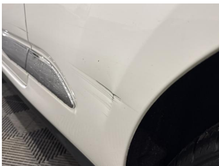
8: Qtr Panel nsr Dented With Paint Damage