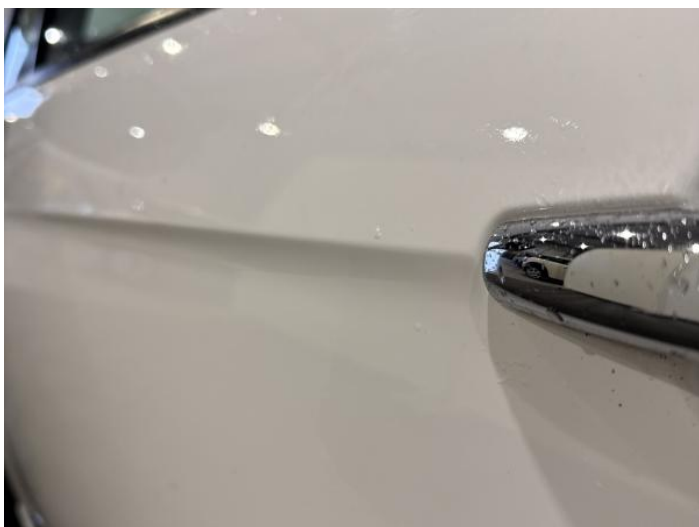
5: Door nsf Dented Between 10mm + 30mm