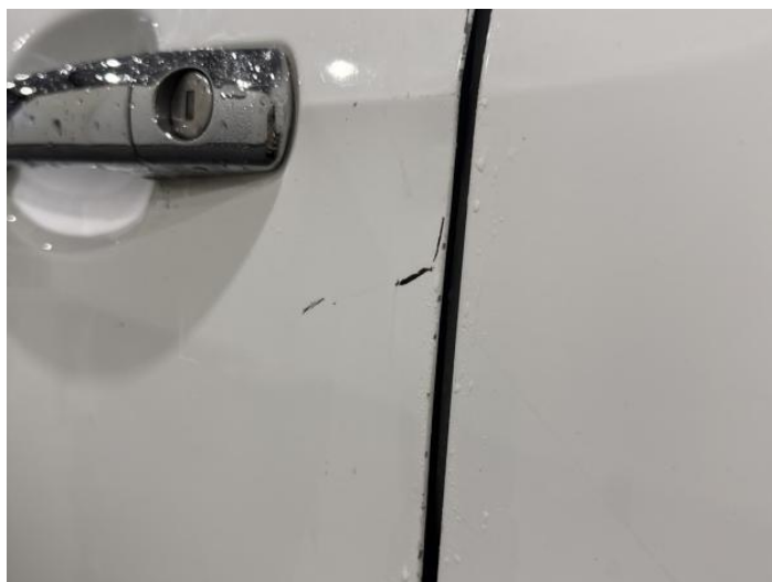
6: Door nsf Scratched Over 25mm Thru Paint