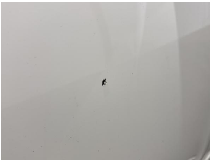
13: Door osf Chipped 1 To 5