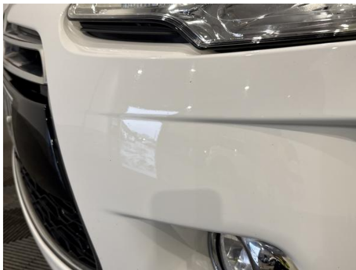
2: Bumper Front Chipped 1 To 5