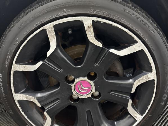
15: Wheel osf Scratched Over 50mm