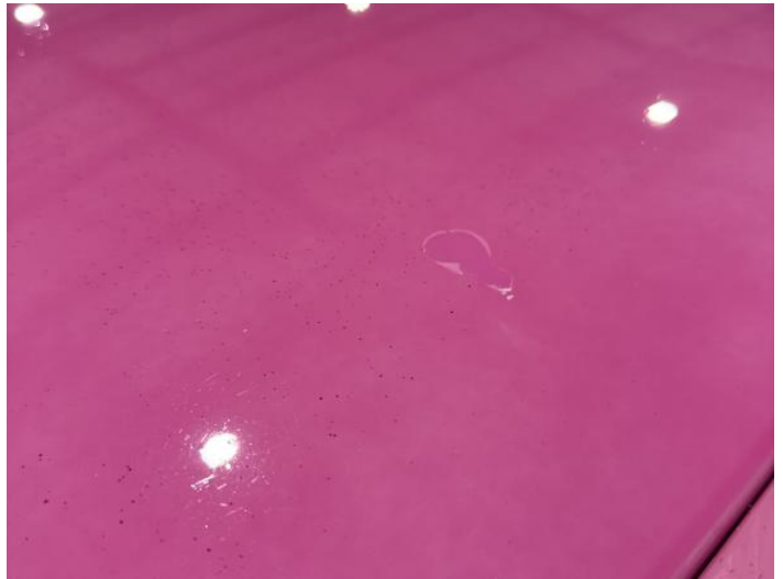
18: Roof Poor Previous Repair Paint Flake