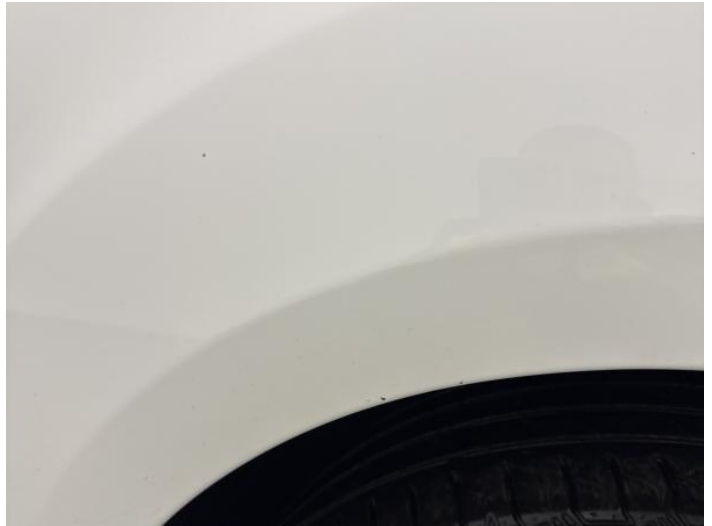
16: Wing osf Chipped 1 To 5