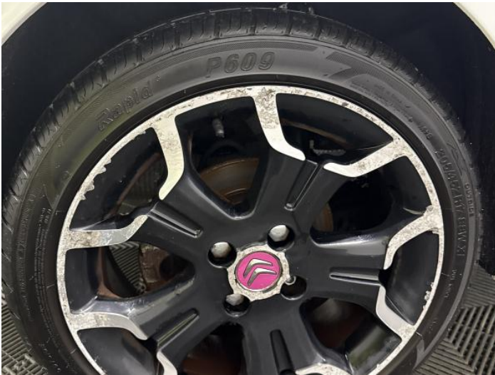
11: Wheel osr Scratched Over 50mm