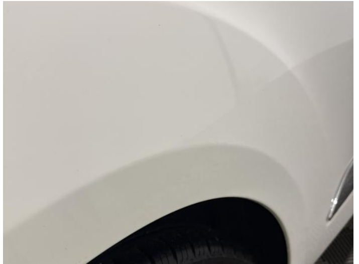
10: Qtr Panel osr Dented Between 10mm + 30mm