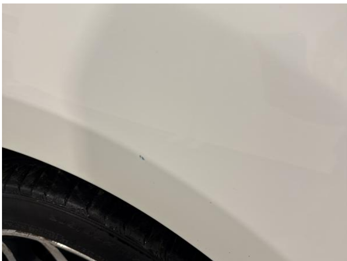
3: Wing nsf Chipped 1 To 5