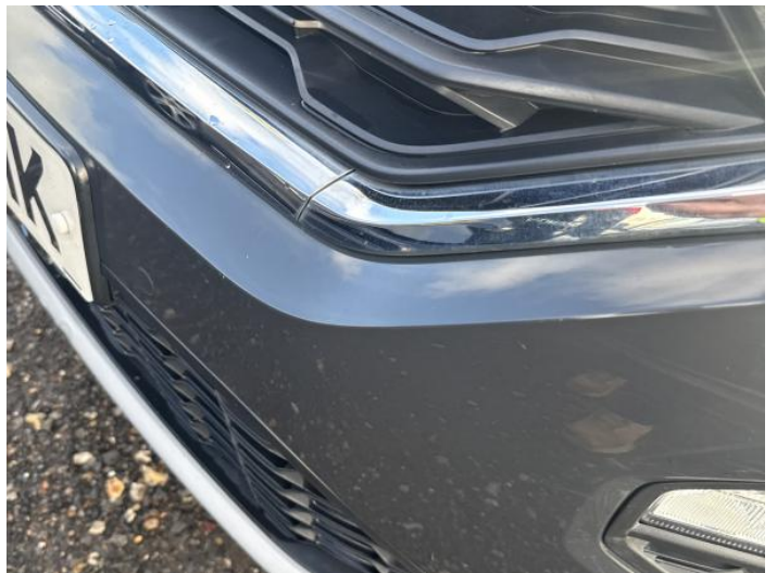
2: Bumper Front Poor Previous Repair Poor Colour