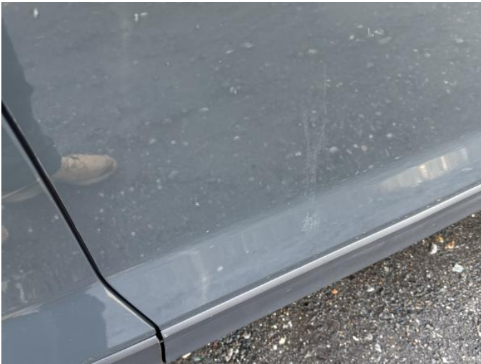
11: Door osf Scratched Over 25mm Thru Paint