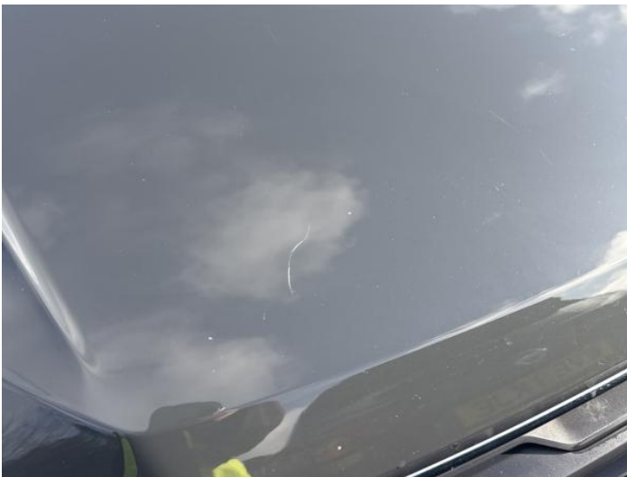
1: Bonnet Scratched Over 25mm Thru Paint