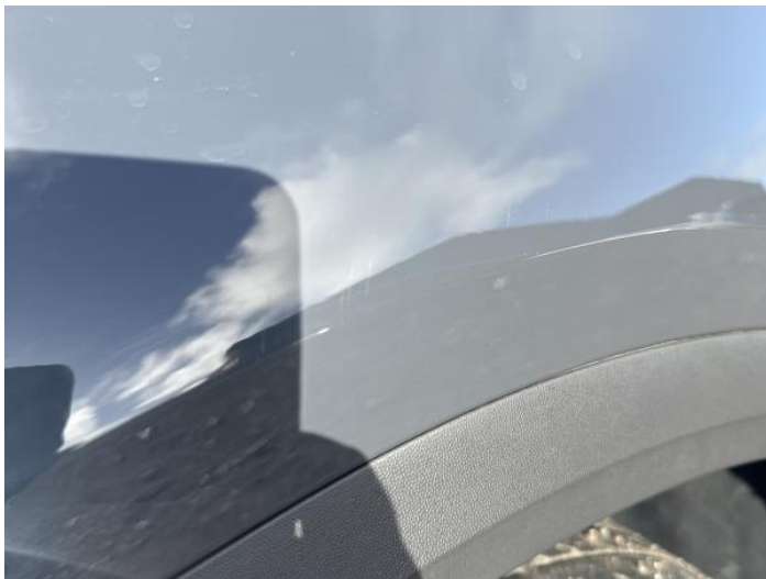
3: Wing nsf Scratched Over 25mm Thru Paint