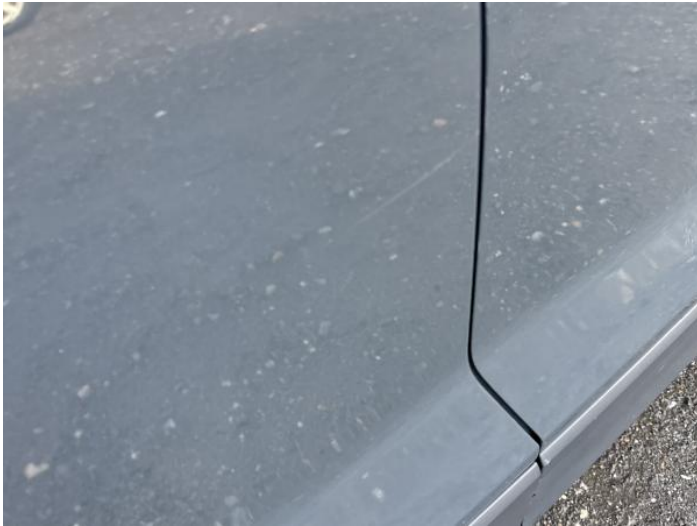
10: Door osr Scratched Over 25mm Thru Paint