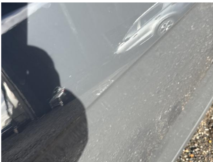
5: Door nsf Scratched Up To 25mm Thru Paint