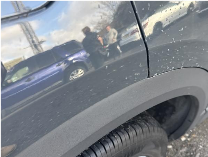
9: Qtr Panel osr Scratched UpTo 25mm Thru Paint