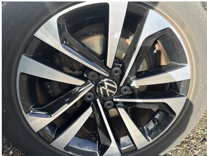
4: Wheel nsf Scratched Up To 50mm