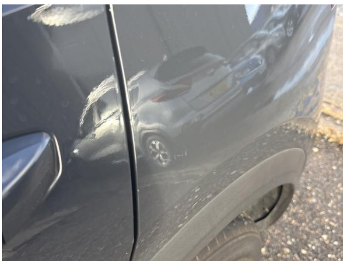
7: Qtr Panel nsr Dented Between 10mm + 30mm