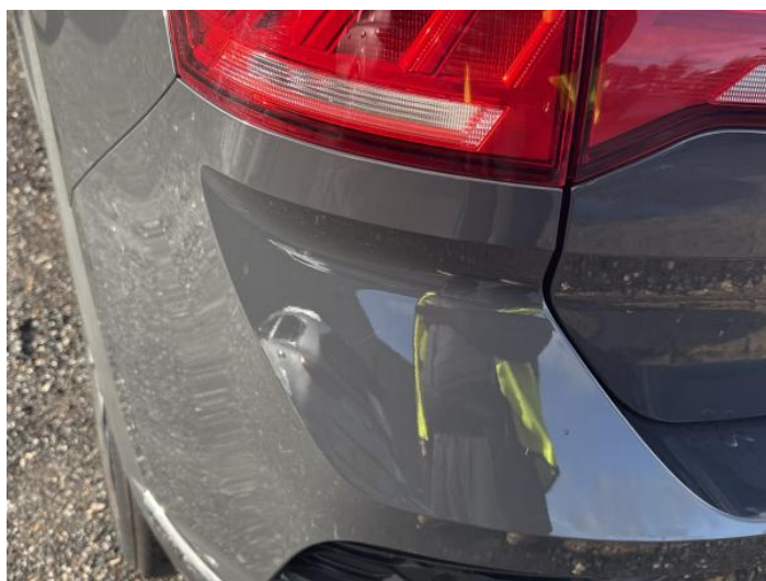
8: Bumper Rear Scratched 25 to 100mm Thru Paint