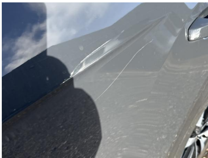
6: Door nsr Scratched Over 25mm Thru Paint