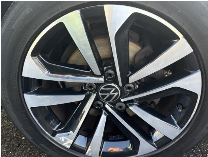
12: Wheel osf Scratched Over 50mm

Carpet Condition Average Seat Condition Average