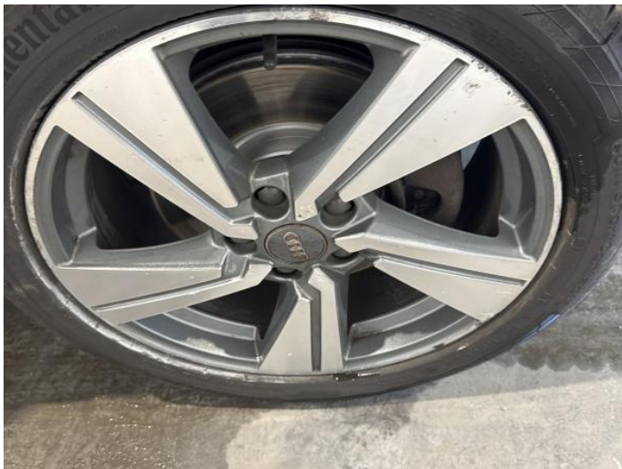
9: Wheel of Corroded Light