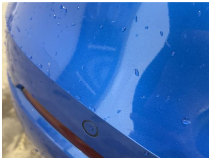
6: Bumper Rear Chipped Multiple Chips