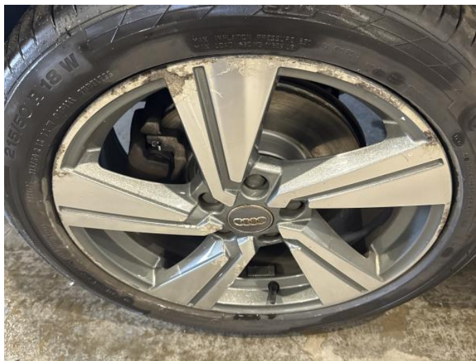
2: Wheel nsf Scratched Over 50mm