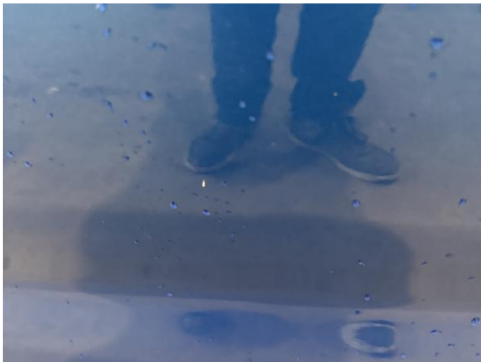
3: Door nsf Chipped 1 To 5