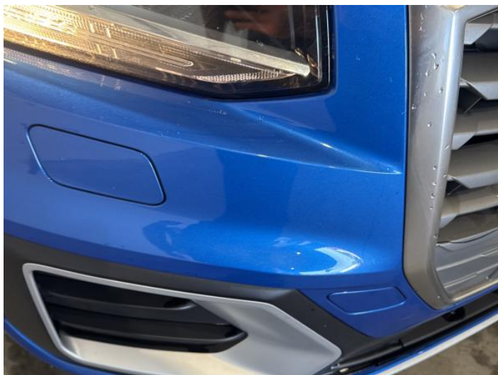
1: Bumper Front Chipped Multiple Chips