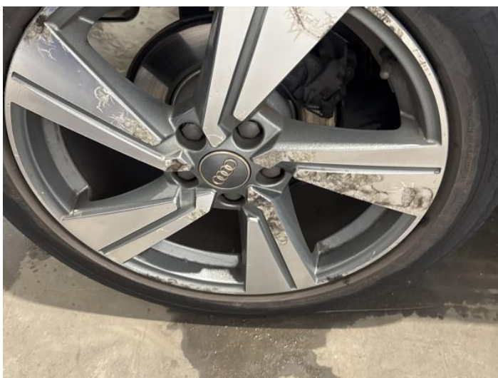
7: Wheel osr Corroded Light