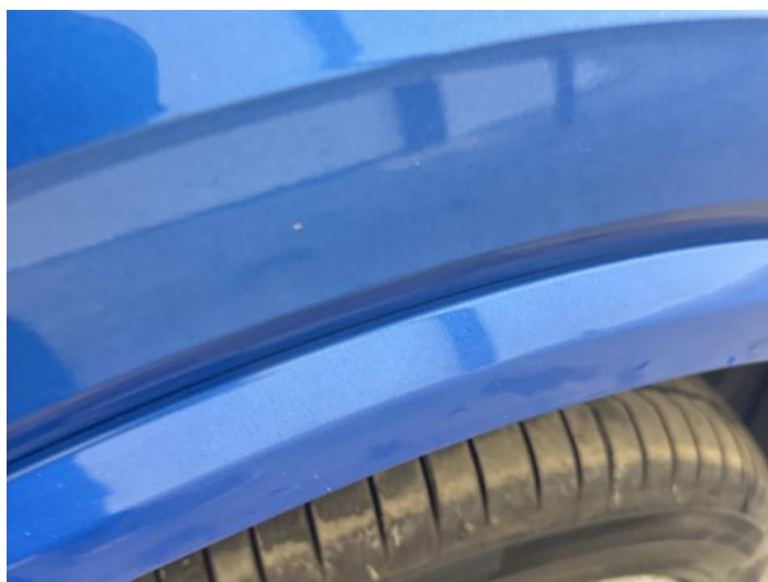
8: Wing osf Chipped 1 To 5