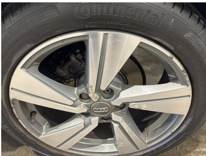
5: Wheel nsr Corroded Light