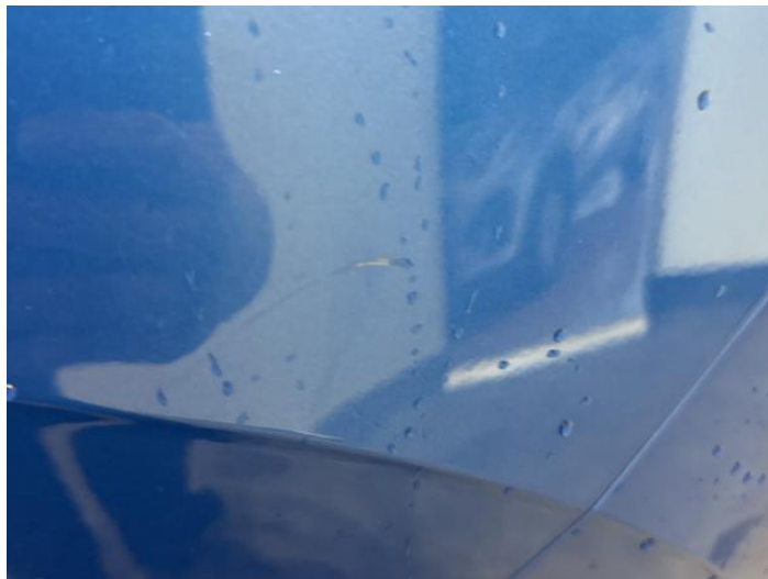
4: Qtr Panel nsr Scratched UpTo 25mm Thru Paint