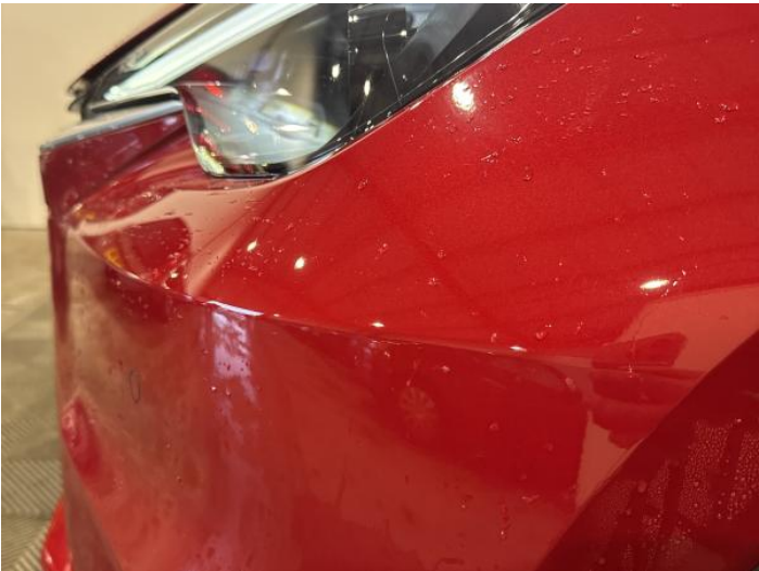
1: Bumper Front Chipped 1 To 5