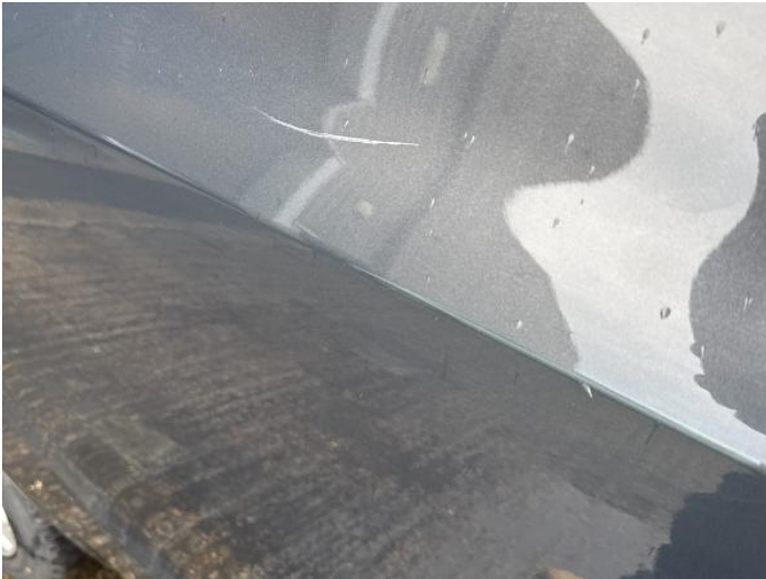
15: Door osr Scratched Over 25mm Thru Paint