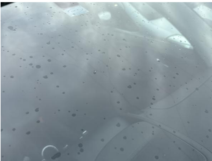
19: Screen Front Chipped UpTo 10mm