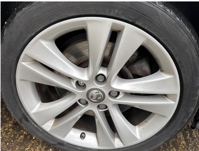
17: Wheel osf Scratched Over 50mm