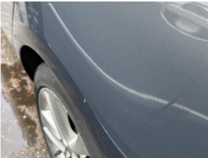
11: Qtr Panel nsr Scratched UpTo 25mm Thru Paint