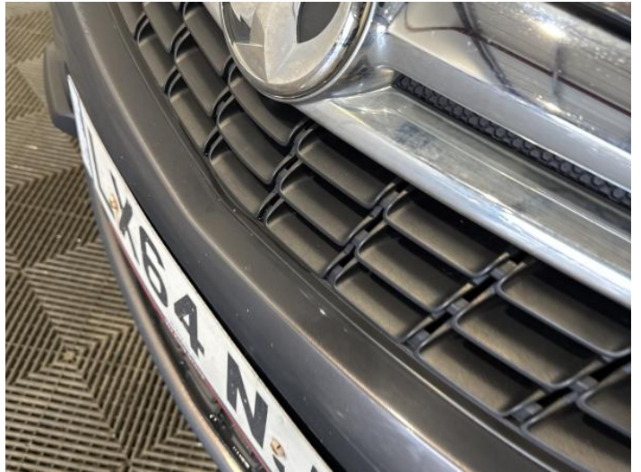
4: Bumper Front Chipped Multiple Chips