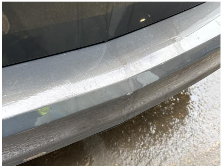
12: Bumper Rear Dented With Paint Damage