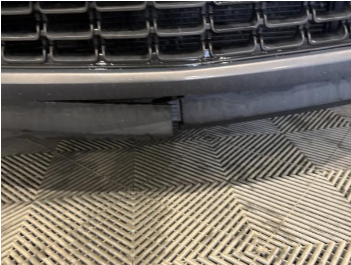
3: Bumper Front Moulding Broken Replace