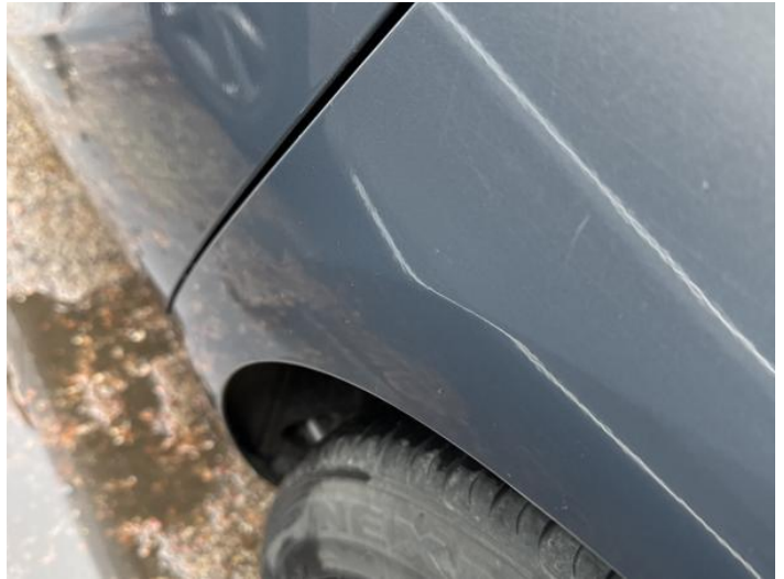
10: Qtr Panel nsr Dented Between 10mm + 30mm