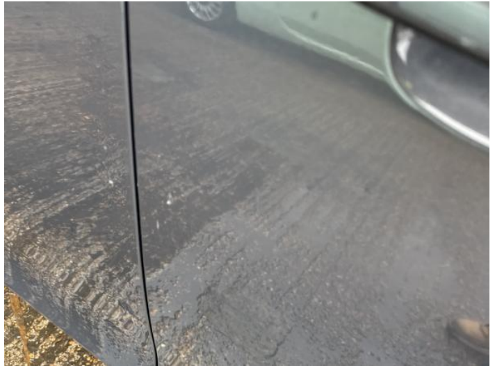
16: Door osf Scratched UpTo 25mm Thru Paint