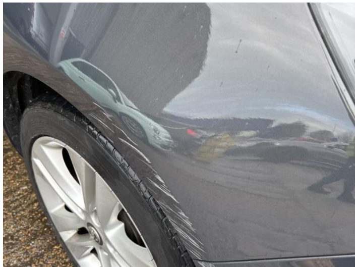
18: Wing osf Dented With Paint Damage