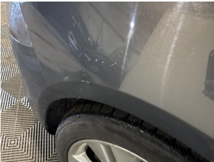
5: Wing osf Dented With Paint Damage