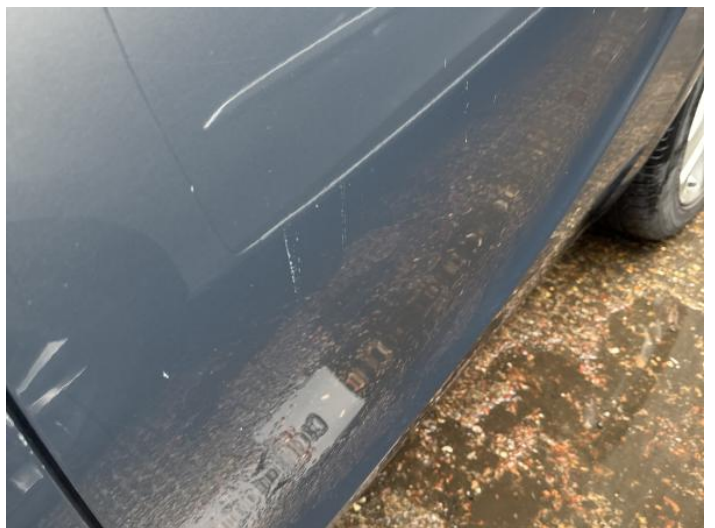
8: Door nsr Scratched Over 25mm Thru Paint