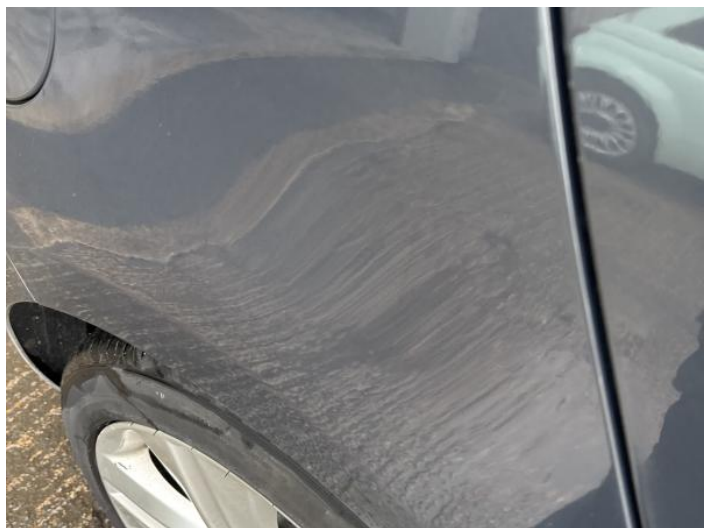
14: Qtr Panel osr Scratched UpTo 25mm Thru Paint