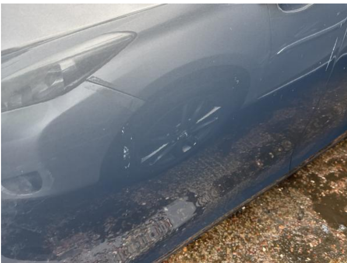
7: Door nsf Scratched Over 25mm Thru Paint