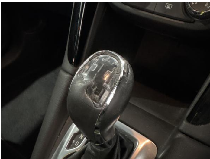
1: Switches And Controls Broken Replace