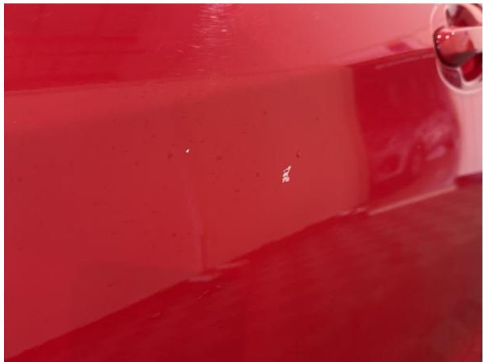
6: Door nsf Scratched Over 25mm Thru Paint