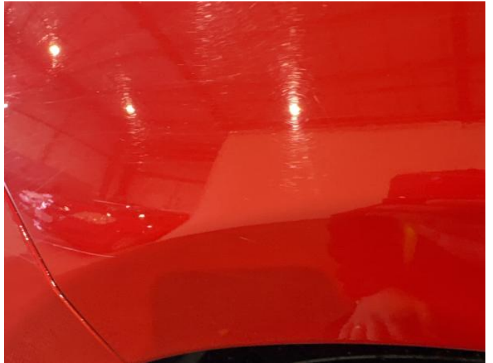
4: Wing nsf Scratched UpTo 25mm Thru Paint