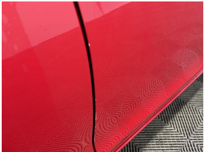
10: Door osf Chipped Edge Chip