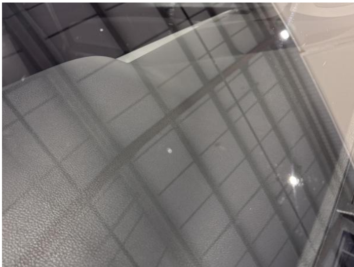
11: Screen Front Chipped UpTo 10mm