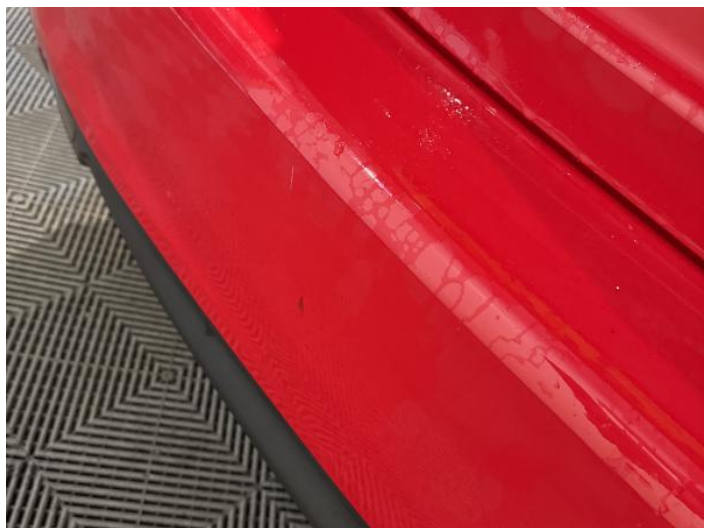
8: Bumper Rear Scratched 25 to 100mm Thru Paint