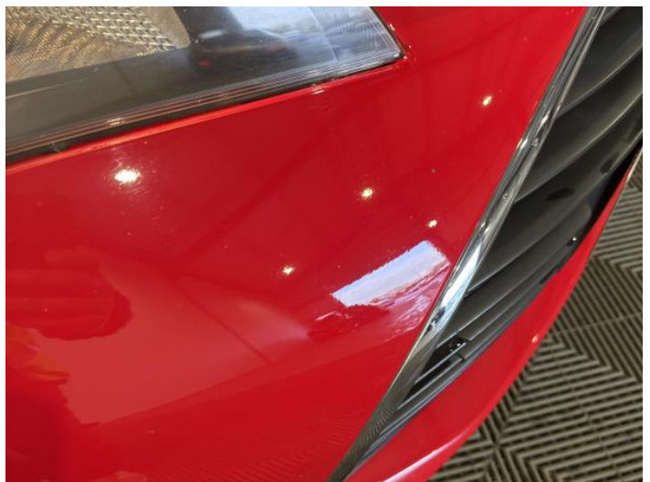
2: Bonnet Chipped 1 To 5