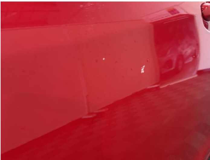
5: Door nsf Dented Between 10mm + 30mm