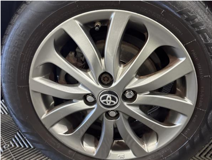
3: Wheel nsf Scratched Up To 50mm