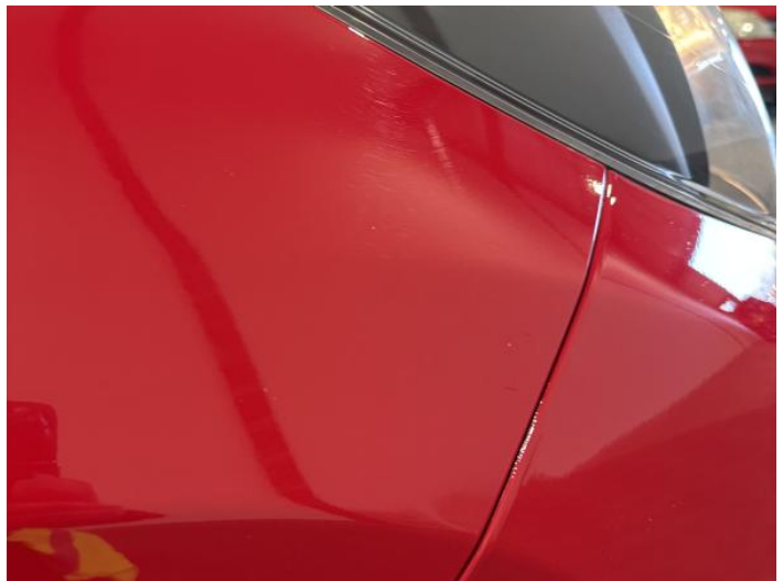
12: Wing osf Chipped 1 To 5