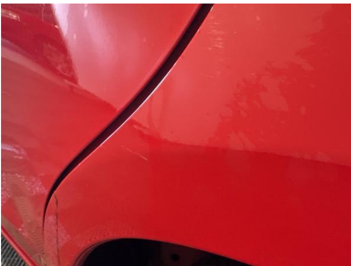
7: Qtr Panel nsr Scratched UpTo 25mm Thru Paint