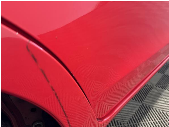
9: Door osr Chipped Edge Chip