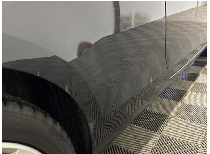
10: Qtr Panel osr Scratched Over 25mm Thru Paint