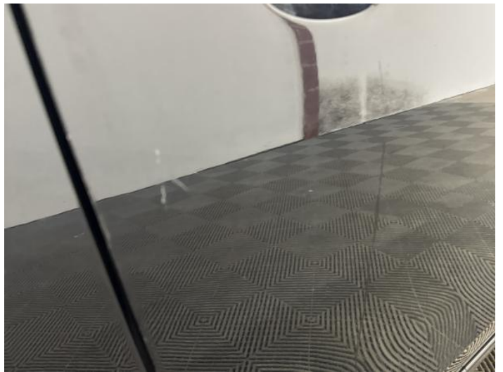
12: Door osf Scratched UpTo 25mm Thru Paint