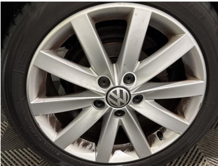
11: Wheel osr Scratched Over 50mm