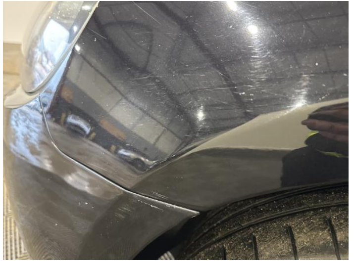
4: Wing nsf Scratched Over 25mm Thru Paint