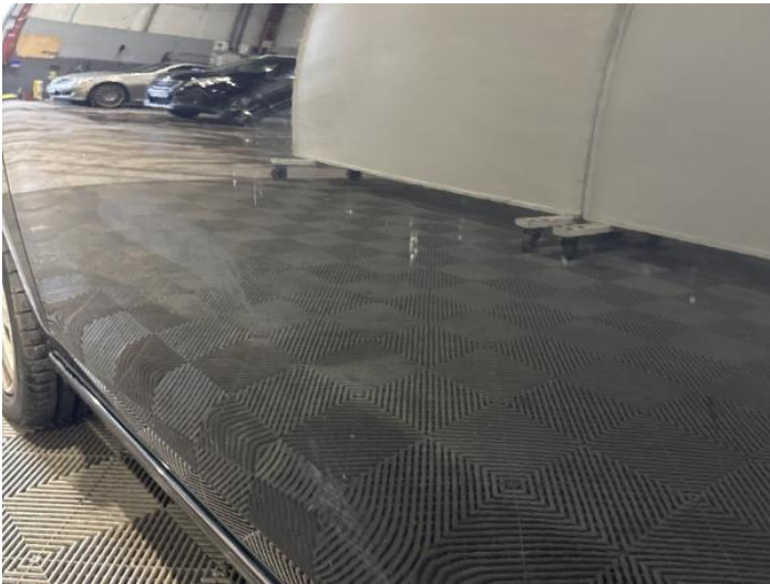
5: Door nsf Scratched Over 25mm Thru Paint