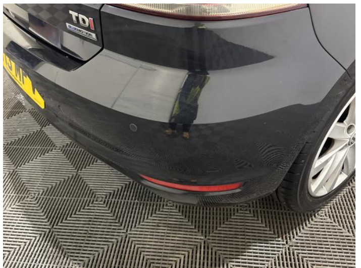
8: Bumper Rear Scratched 25 to 100mm Thru Paint