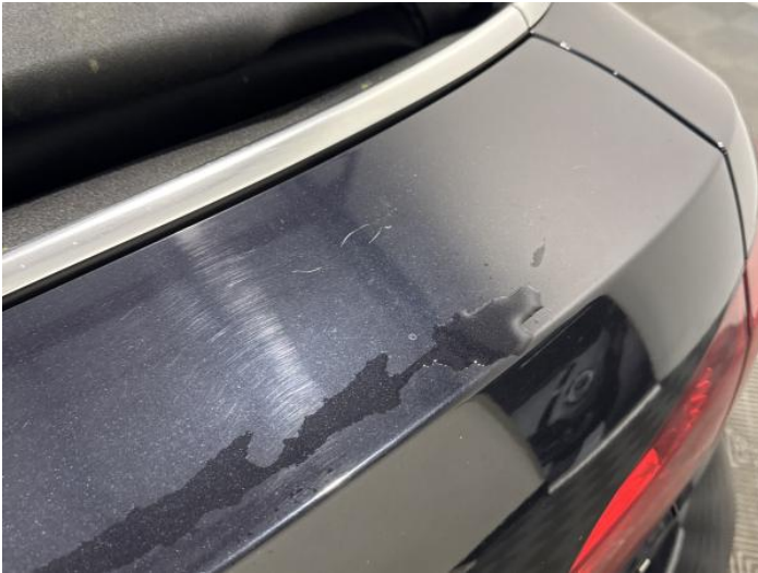
9: Boot Lid Scratched UpTo 25mm Thru Paint