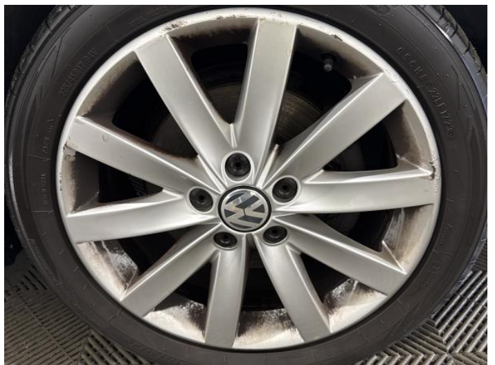
14: Wheel osf Scratched Over 50mm