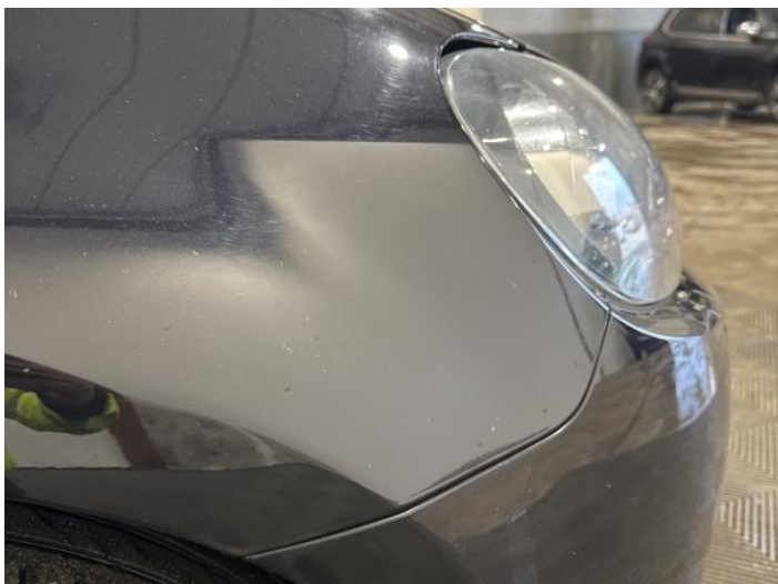
15: Wing osf Chipped 1 To 5