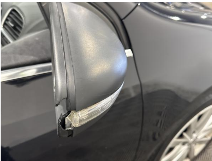
13: Door Mirror Assy osf Broken Replace