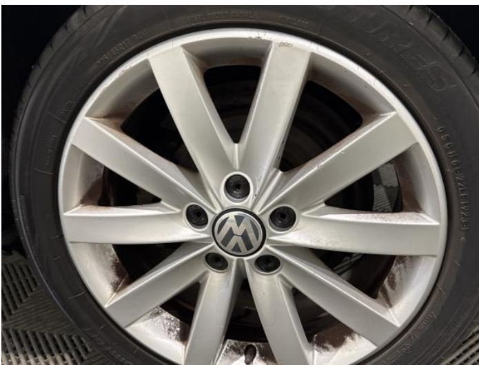
7: Wheel nsr Scratched Over 50mm