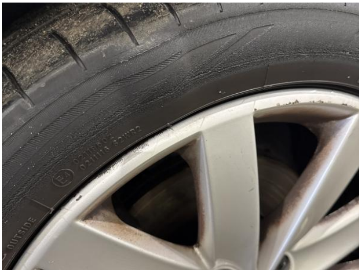
17: Tyre nsf Damaged Replace

Carpet Condition Average Seat Condition Average