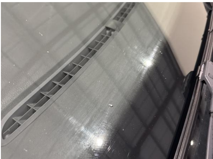
16: Screen Front Chipped UpTo 10mm