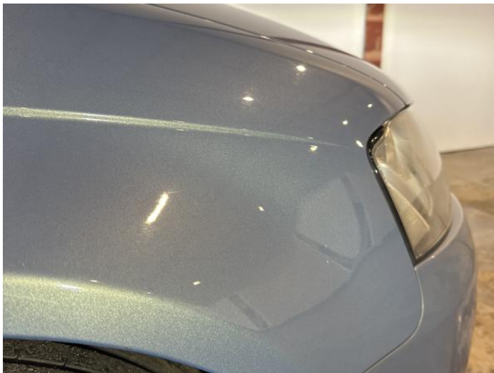
15: Wing osf Chipped 1 To 5