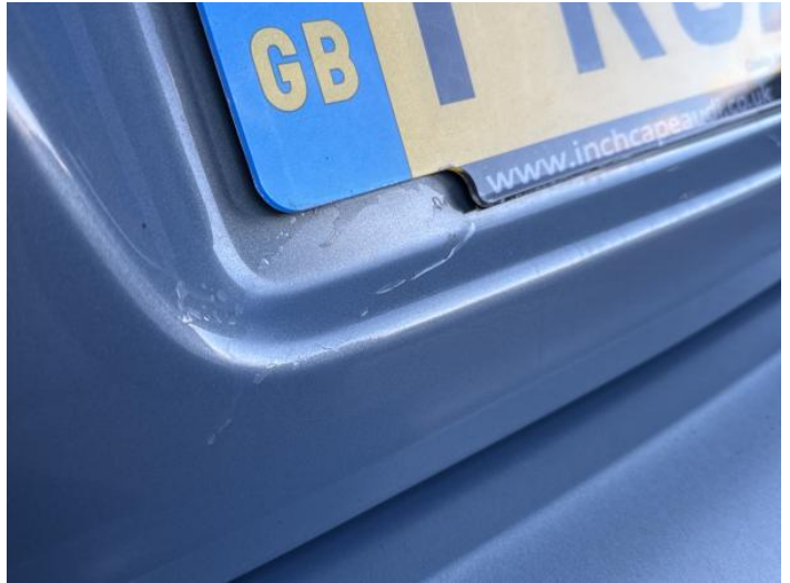
10: Tailgate Poor Previous Repair Paint Flake