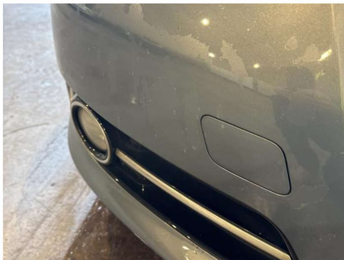
2: Bumper Front Poor Previous Repair Paint Flake