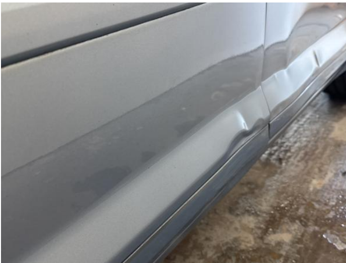
5: Door nsf Dented Over 30mm