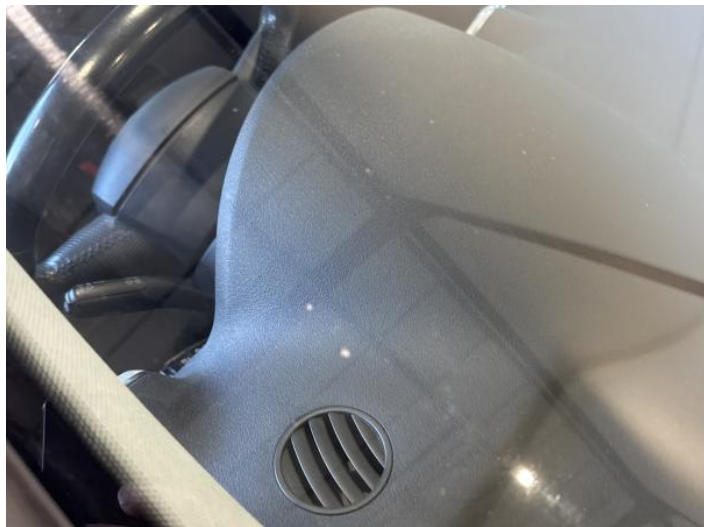
16: Screen Front Chipped UpTo 10mm