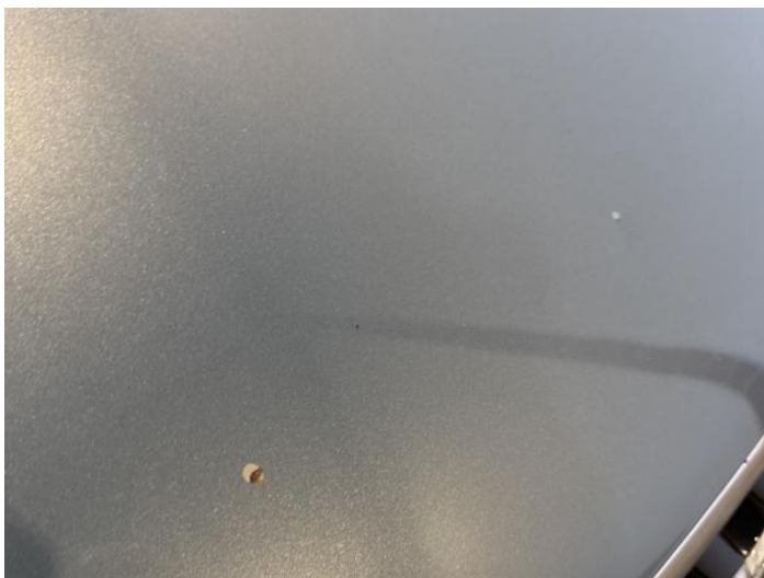
1: Bonnet Chipped Over 5mm