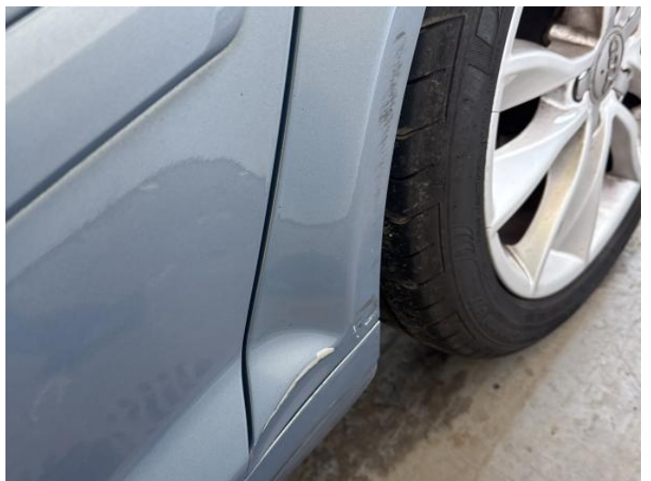
8: Qtr Panel nsr Dented Over 30mm