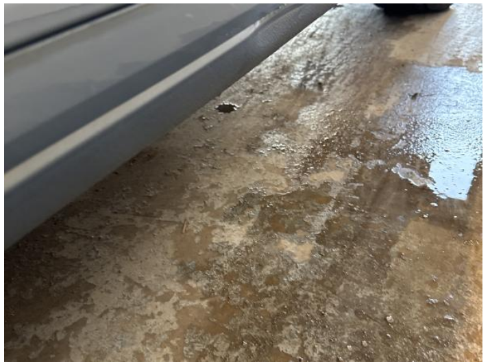
6: Sill ns Dented Over 30mm