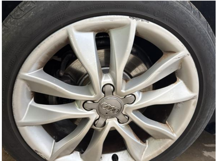
4: Wheel nsf Scratched Over 50mm