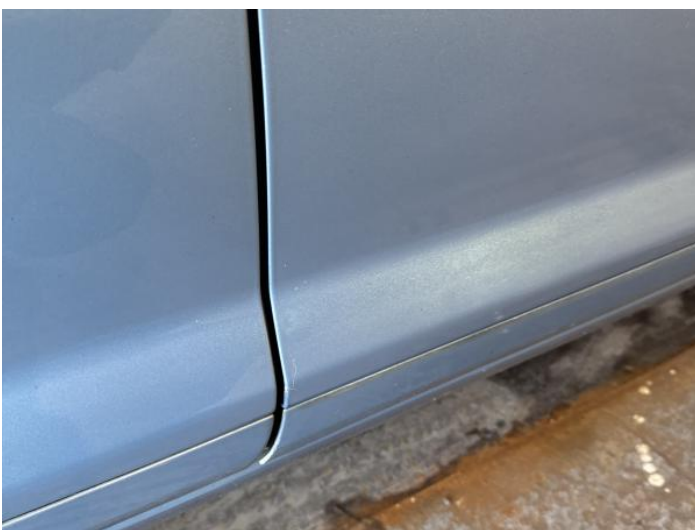
13: Door osf Chipped Edge Chip