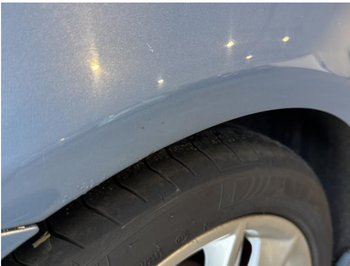
11: Qtr Panel osr Rusted Over 5mm