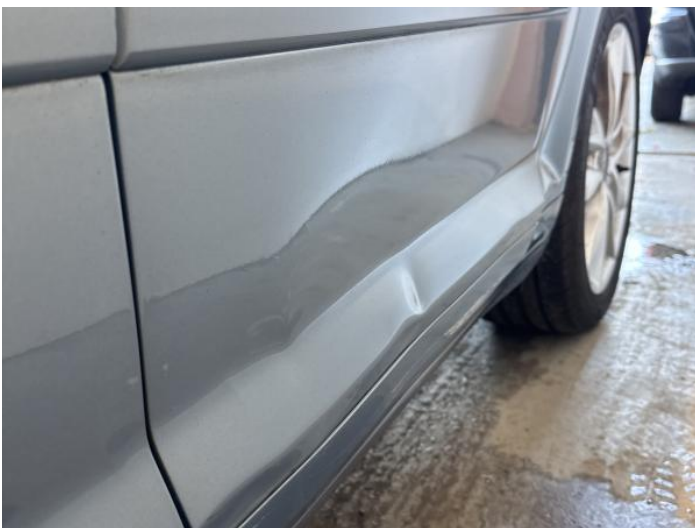
7: Door nsr Dented Over 30mm