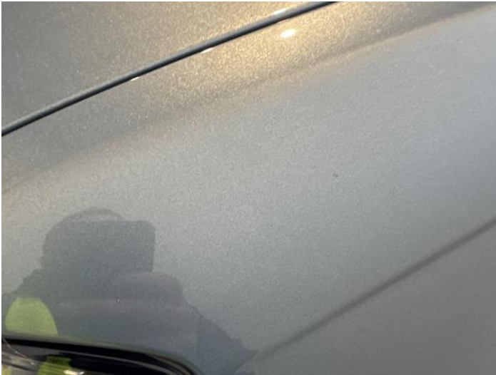
3: Wing nsf Chipped 1 To 5