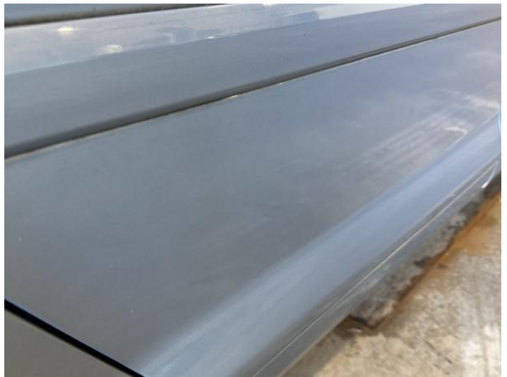
12: Door osr Scratched Up To 25mm Thru Paint