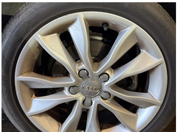
14: Wheel osf Scratched Up To 50mm