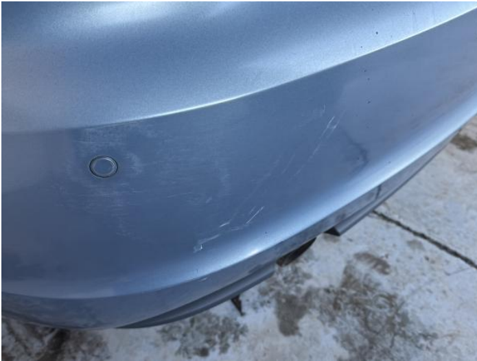
9: Bumper Rear Dented With Paint Damage