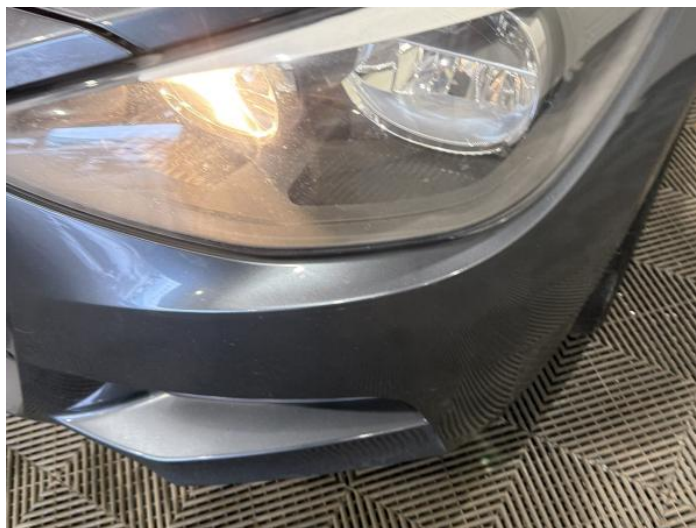
2: Bumper Front Poor Previous Repair Poor Paint