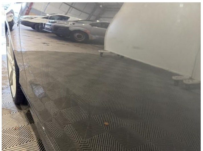
6: Door nsf Poor Previous Repair Poor Paint