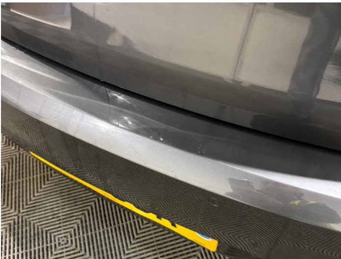
11: Bumper Rear Chipped Multiple Chips