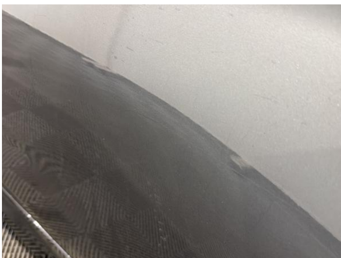
7: Door nsr Poor Previous Repair Poor Paint