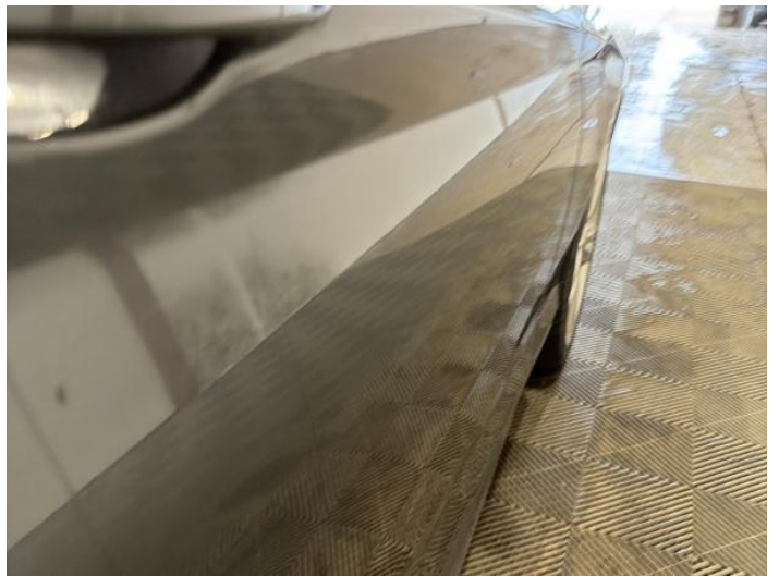
18: Door osf Poor Previous Repair Poor Paint