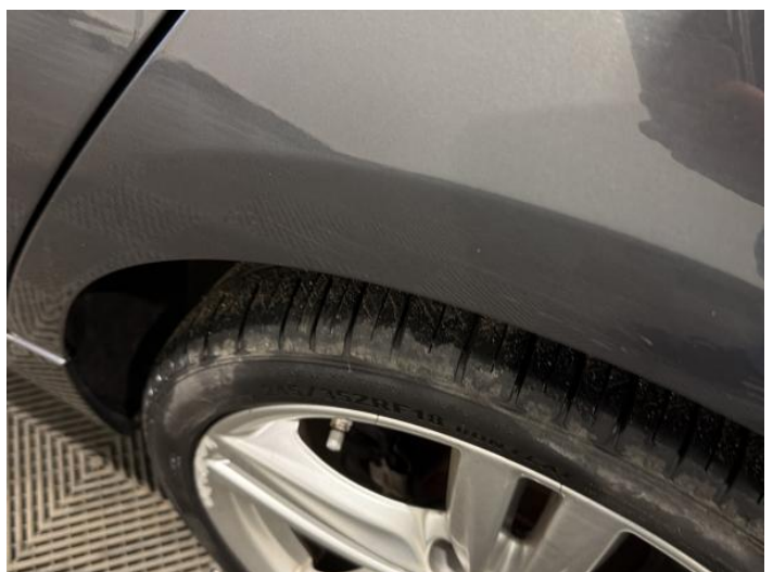
8: Qtr Panel nsr Dented Over 2 UpTo 10mm