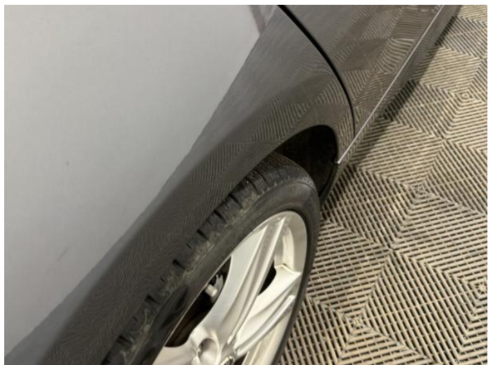
14: Qtr Panel osr Chipped 1 To 5