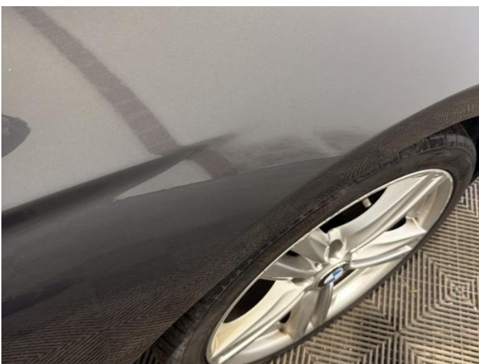
19: Wing osf Dented Over 2 UpTo 10mm