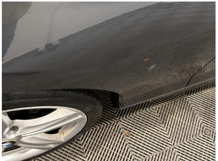
4: Wing nsf Chipped 1 To 5