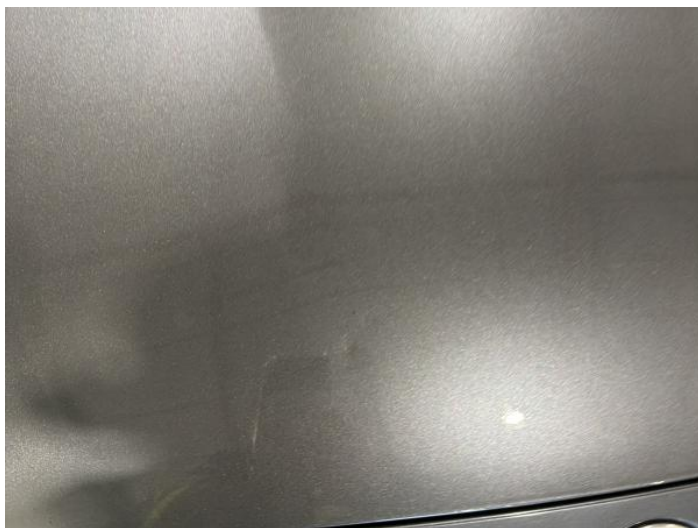
1: Bonnet Dented Between 10mm + 30mm