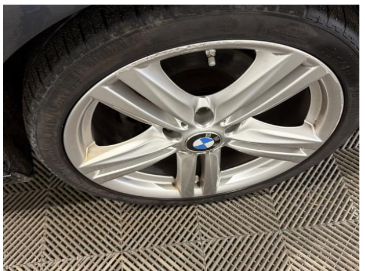
20: Wheel osf Scratched Over 50mm