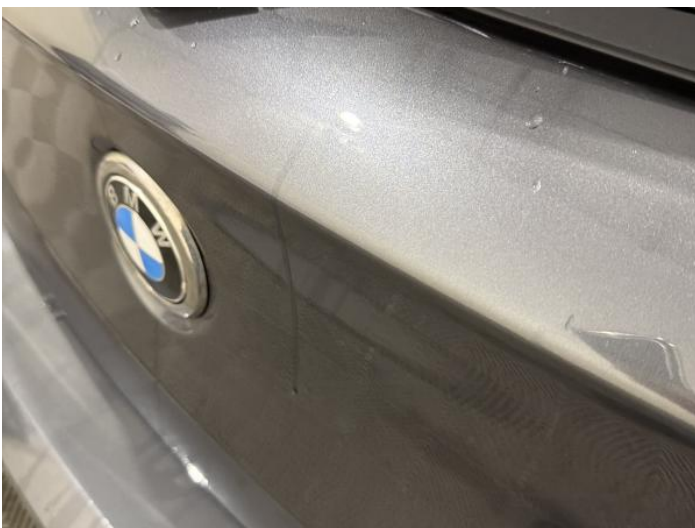
13: Boot Lid Chipped 1 To 5