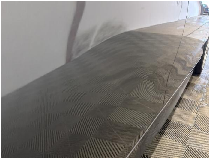
17: Door osr Poor Previous Repair Poor Paint