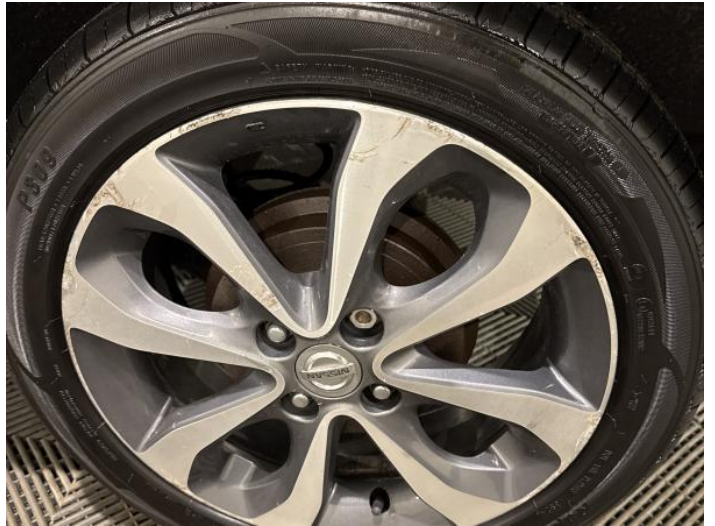
10: Wheel nsr Scratched Over 50mm