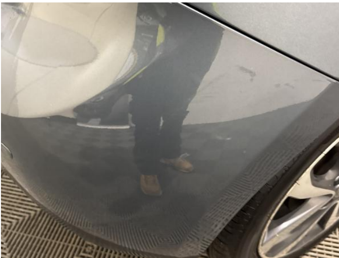
11: Bumper Rear Scratched 25 to 100mm Thru Paint