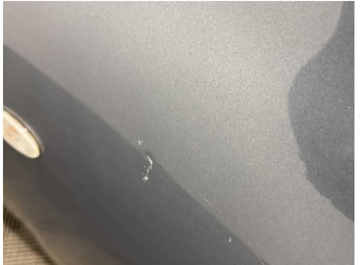
16: Wing osf Dented Between 10mm + 30mm