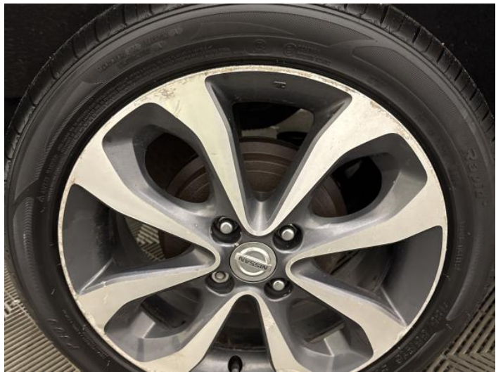
12: Wheel osr Scratched Over 50mm