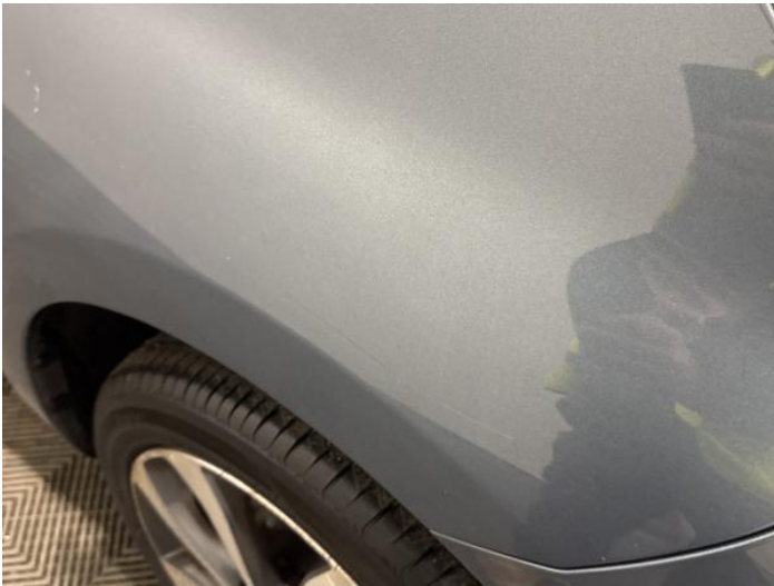
17: Wing osf Scratched Over 25mm Thru Paint