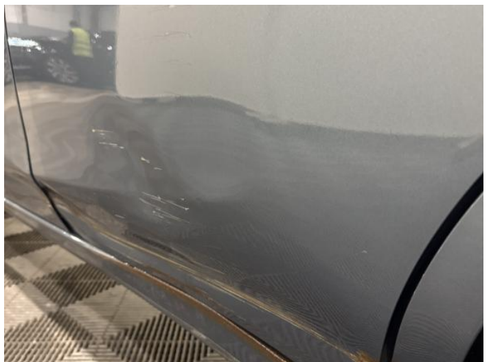
8: Door nsr Dented With Paint Damage