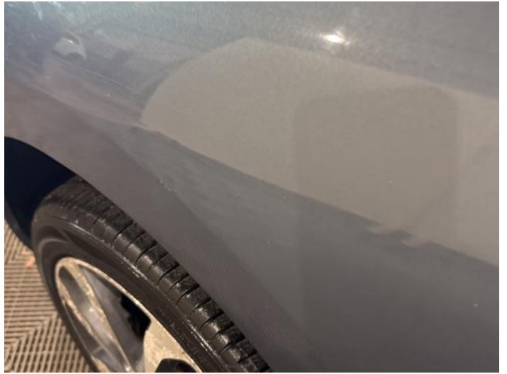
4: Wing nsf Dented Between 10mm + 30mm