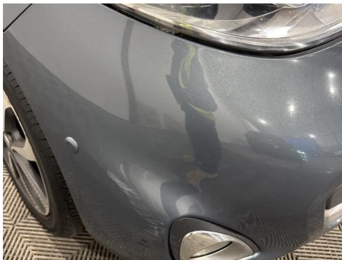
2: Bumper Front Poor Previous Repair Poor Colour