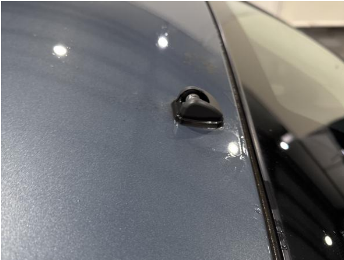
15: Aerial Missing Replace