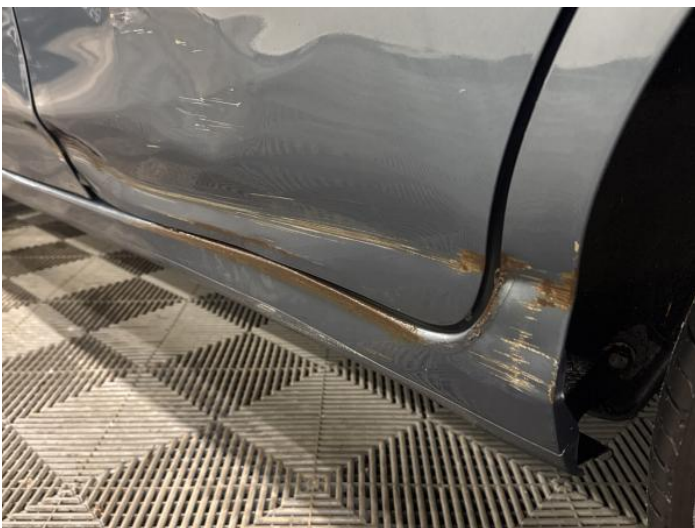
7: Sill ns Dented With Paint Damage