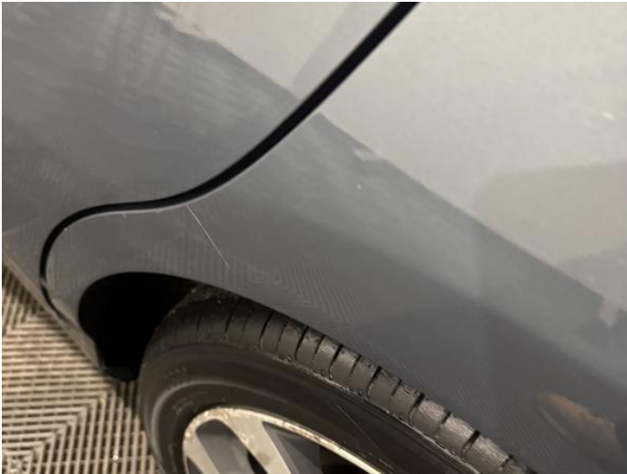
9: Qtr Panel nsr Scratched Over 25mm Thru Paint