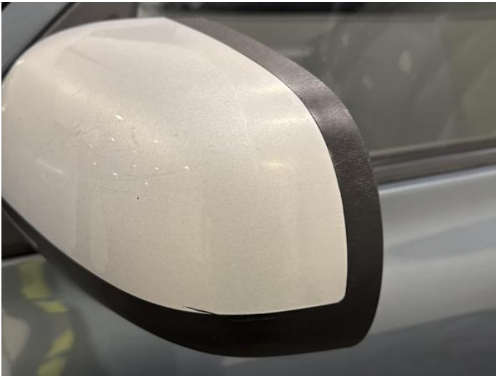
5: Door Mirror Assy nsf Scratched (Painted) UpTo 25mm Thru Paint