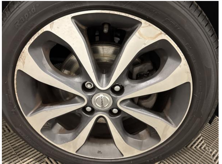
18: Wheel osf Scratched Over 50mm