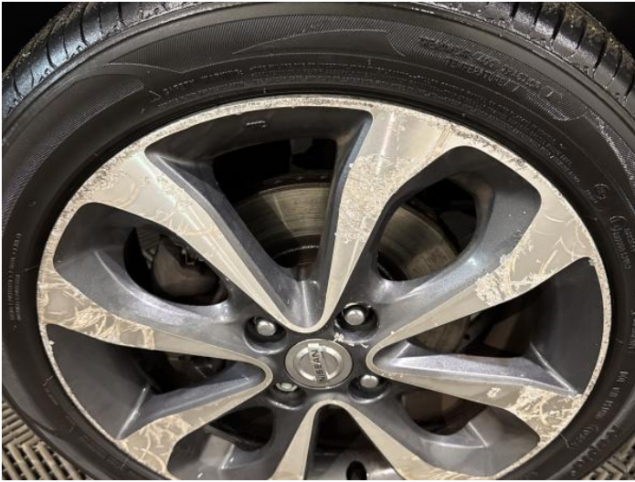
3: Wheel nsf Scratched Over 50mm