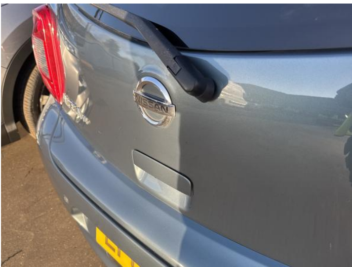
19: Tailgate Dented Over 30mm