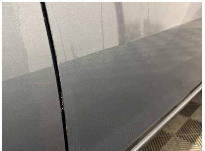
14: Door osf Scratched UpTo 25mm Thru Paint