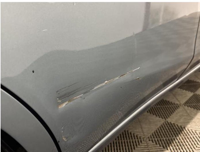
13: Door osr Dented With Paint Damage