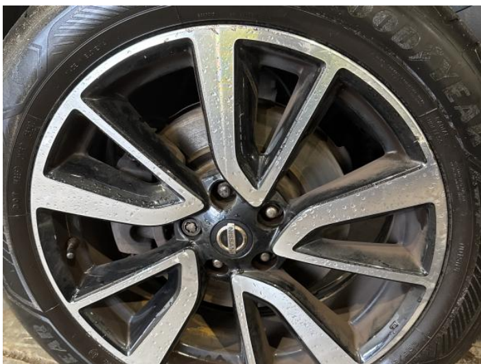
5: Wheel nsf Scratched Over 50mm