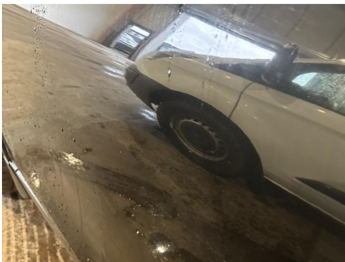
6: Door nsf Scratched Over 25mm Thru Paint