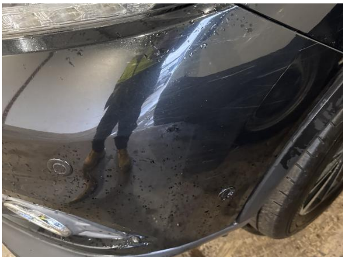
3: Bumper Front Scratched 25 to 100mm Thru Paint