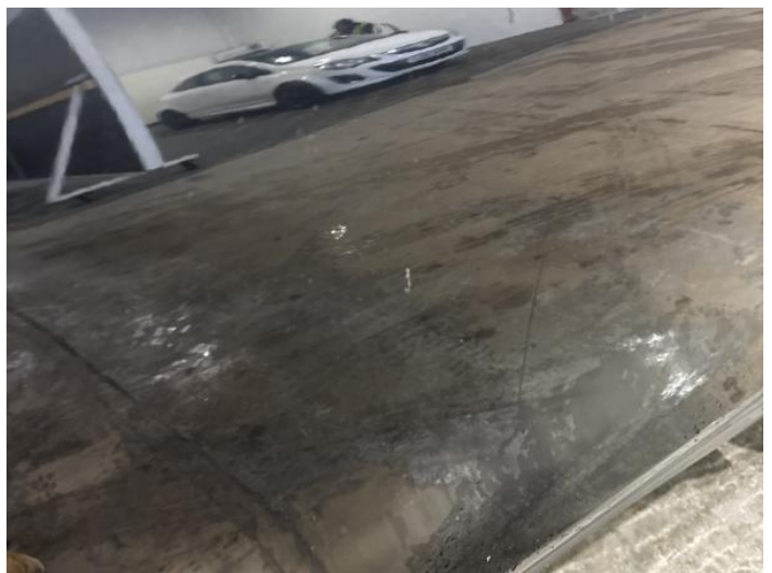
14: Door nsf Scratched Over 25mm Thru Paint