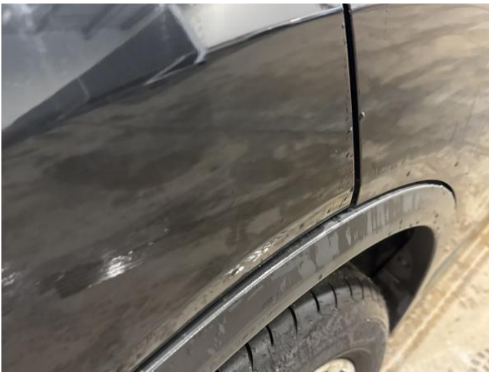
11: Qtr Panel osr Scratched UpTo 25mm Thru Paint