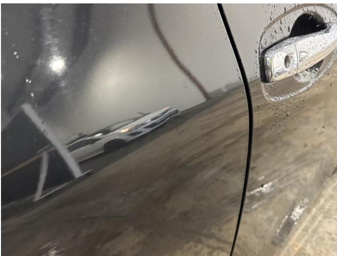
13: Door osr Dented Over 30mm