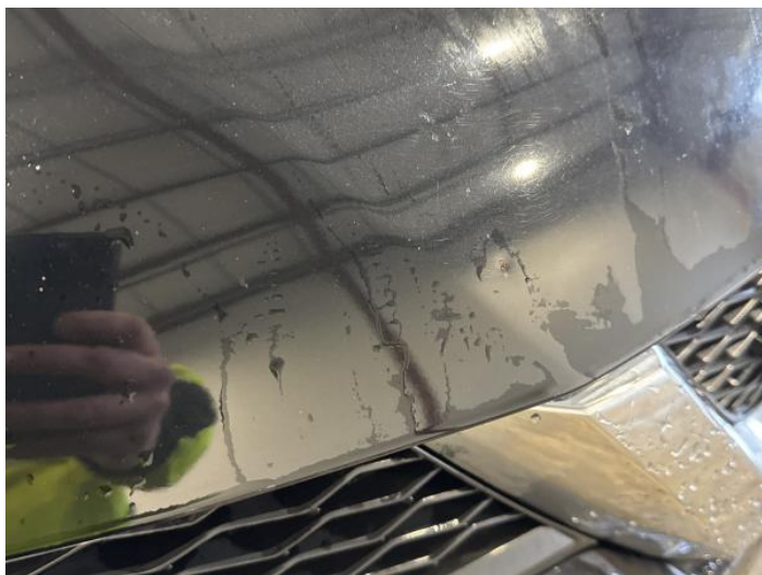
1: Bonnet Dented Between 10mm + 30mm