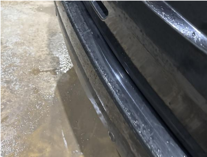
9: Bumper Rear Scratched 25 to 100mm Thru Paint