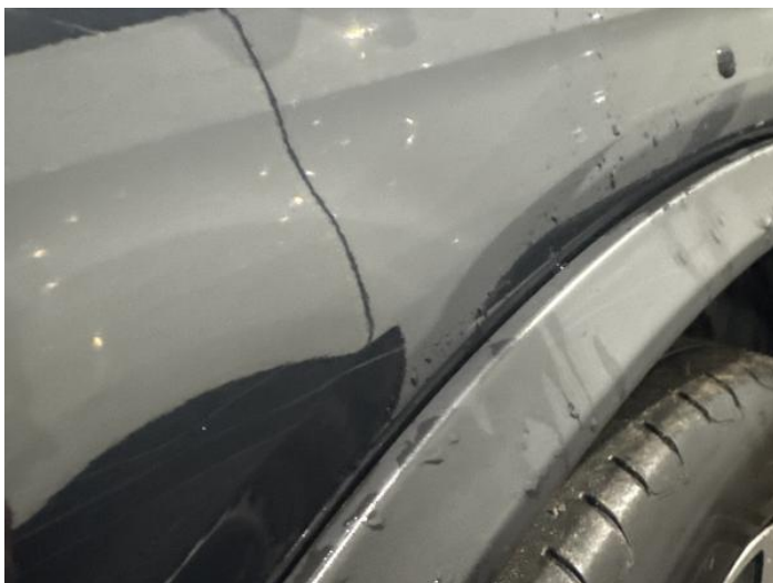
4: Wing nsf Scratched UpTo 25mm Thru Paint