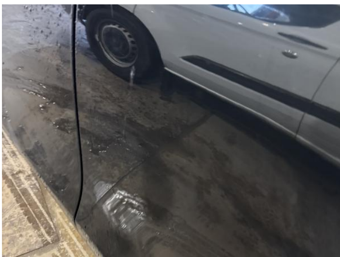
7: Door nsr Scratched Over 25mm Thru Paint