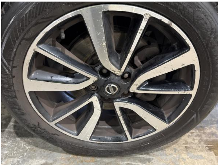
15: Wheel osf Scratched Over 50mm