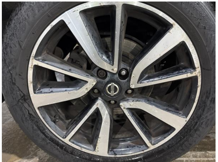
12: Wheel osr Scratched Over 50mm