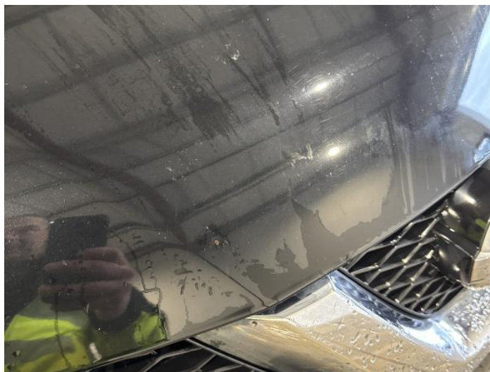
2: Bonnet Scratched Over 25mm Thru Paint