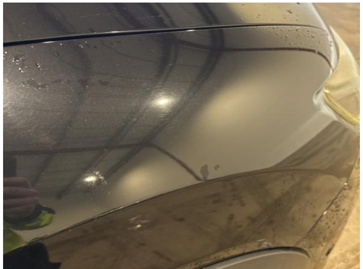
16: Wing osf Chipped 1 To 5