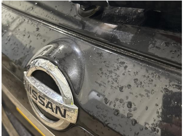
10: Tailgate Scratched UpTo 25mm Thru Paint