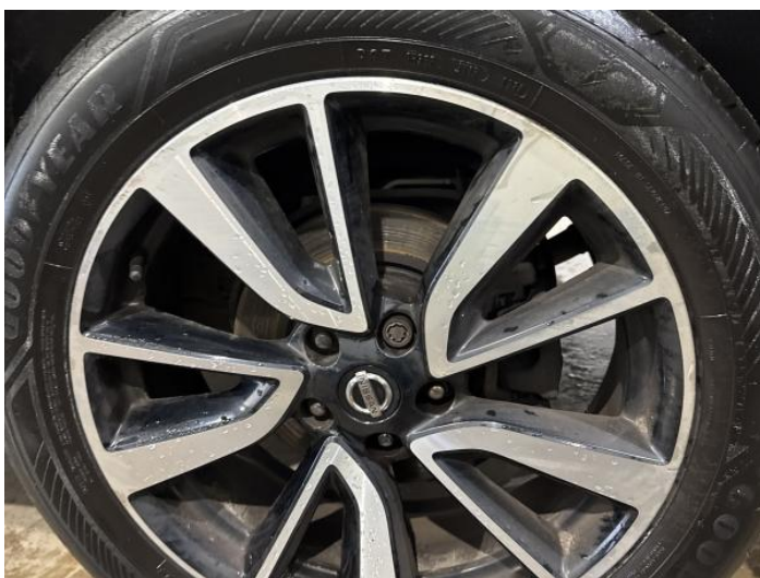
8: Wheel nsr Scratched Over 50mm