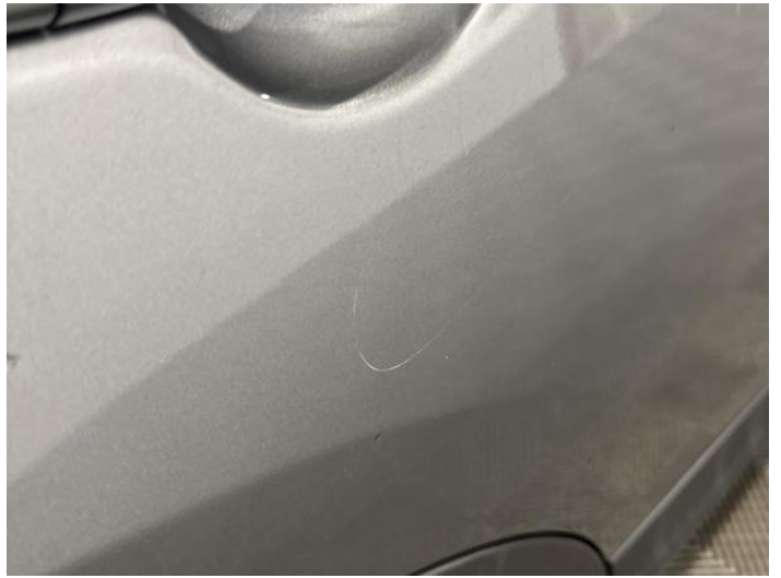
12: Door osr Scratched Over 25mm Thru Paint