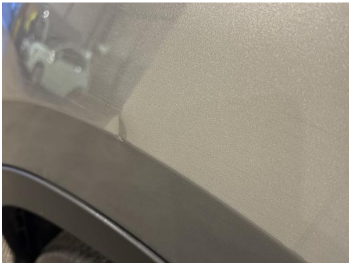
3: Wing nsf Dented Between 10mm + 30mm