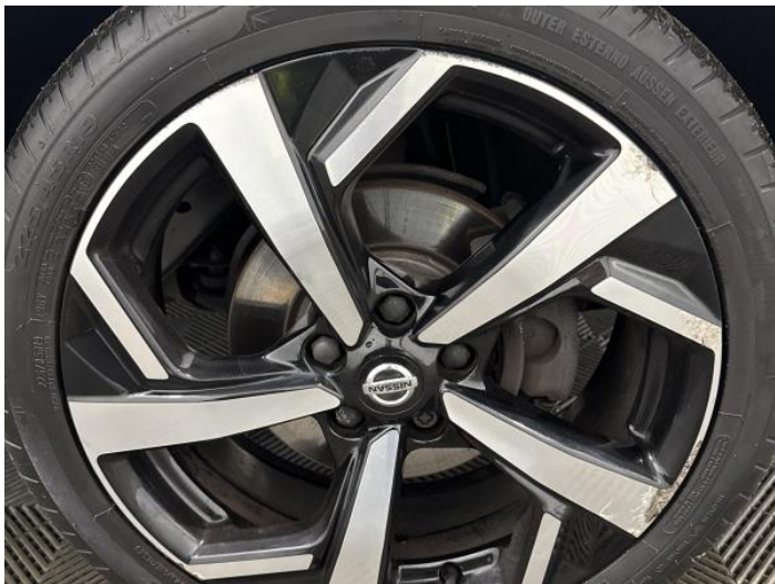
15: Wheel osf Scratched Over 50mm