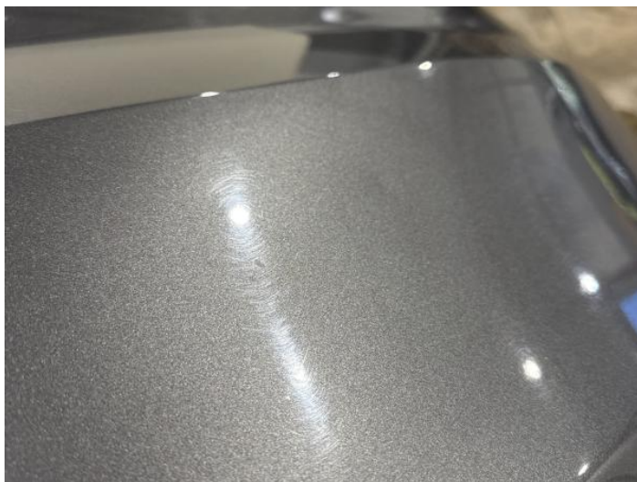
1: Bonnet Dented Between 10mm + 30mm