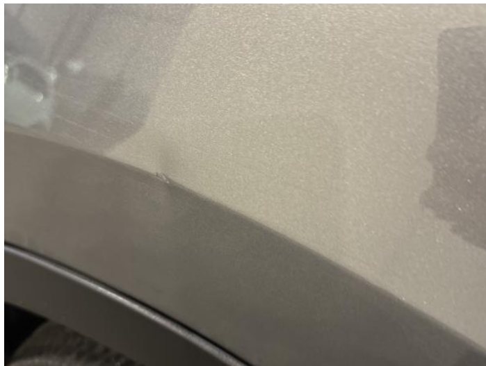
4: Wing nsf Scratched UpTo 25mm Thru Paint