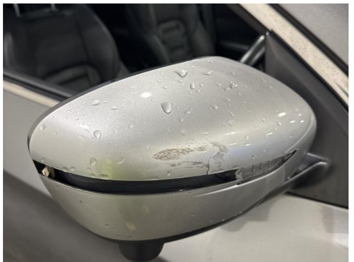
14: Door Mirror Assy osf Broken Replace