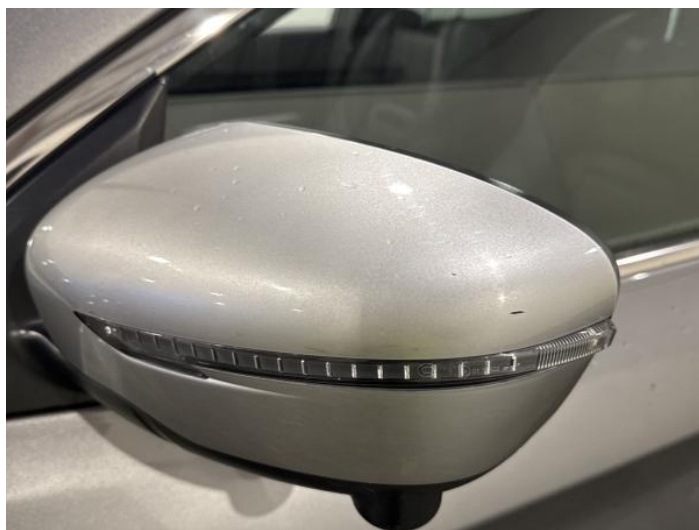
6: Door Mirror Assy nsf Scratched (Painted) UpTo 25mm Thru Paint