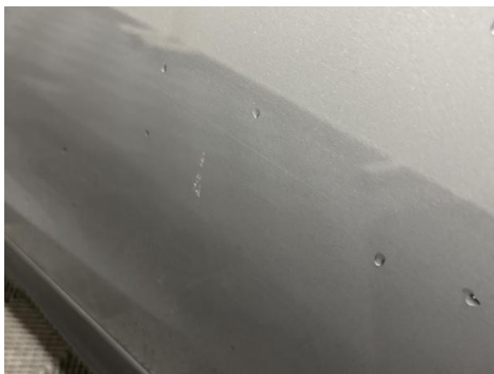
8: Door nsr Scratched UpTo 25mm Thru Paint