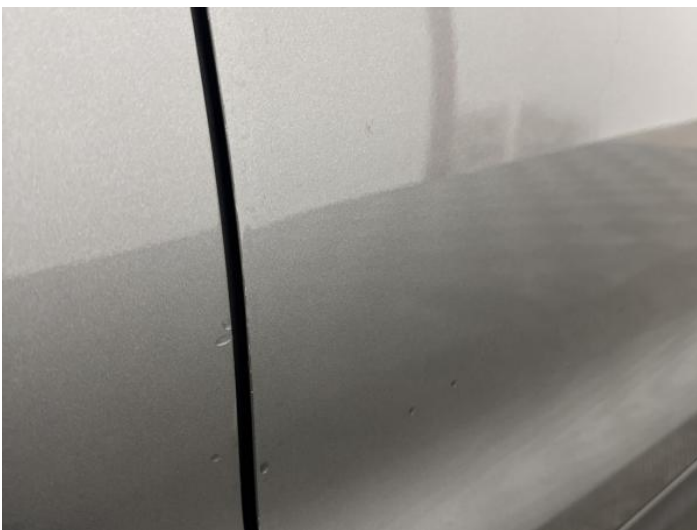
13: Door osf Chipped Edge Chip