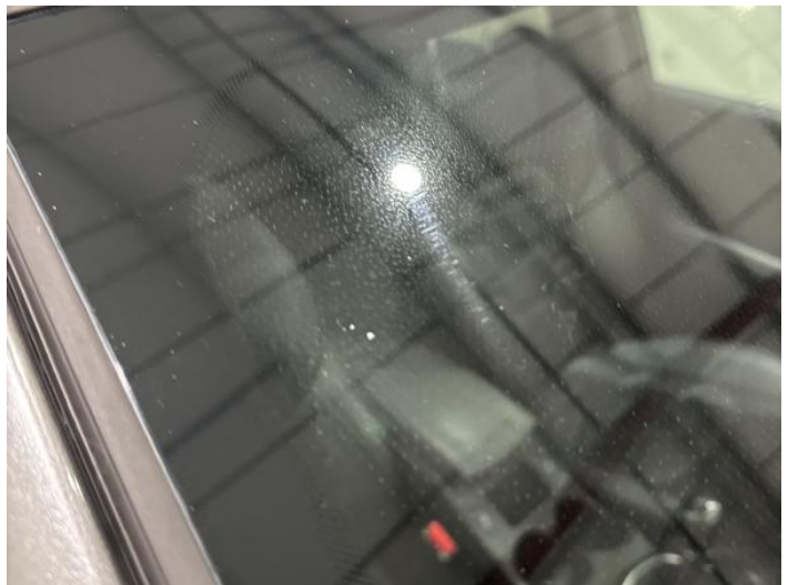
16: Screen Front Chipped UpTo 10mm