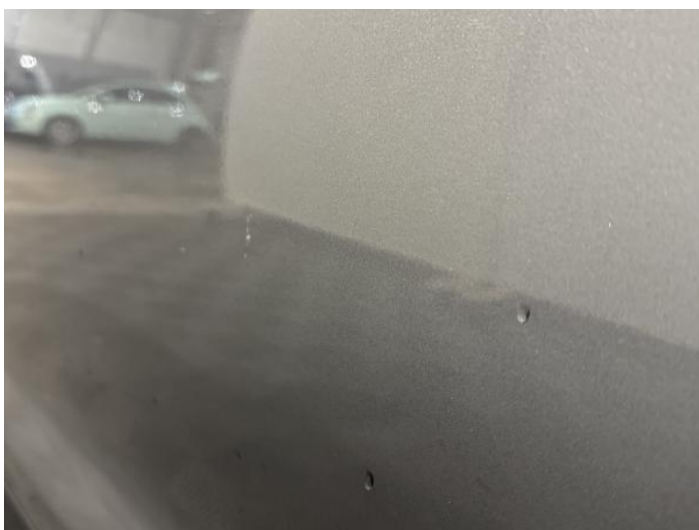
7: Door nsf Scratched UpTo 25mm Thru Paint