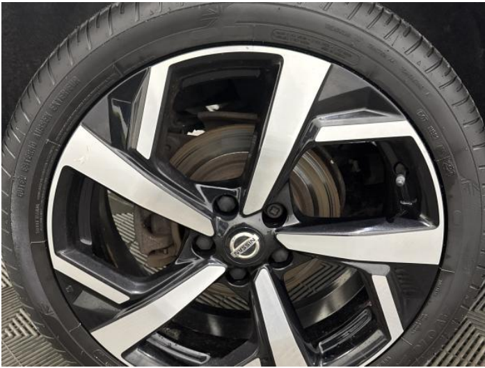
11: Wheel osr Scratched Up To 50mm