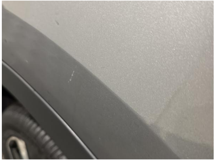
10: Qtr Panel nsr Scratched UpTo 25mm Thru Paint