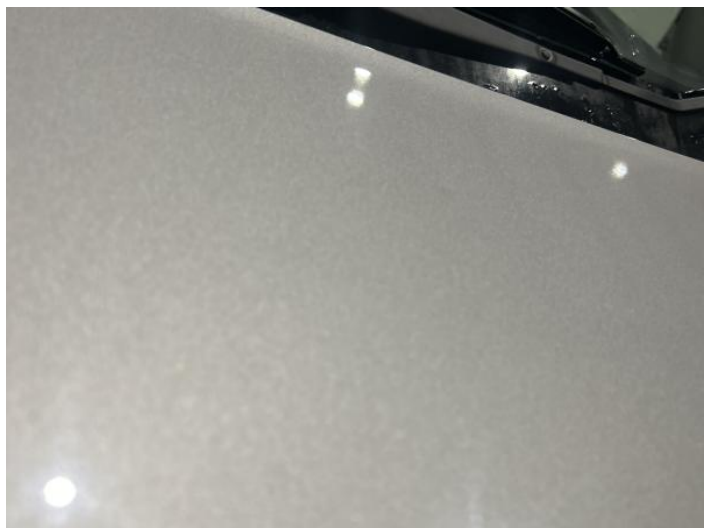
8: Bonnet Dented 2 Or Less UpTo 10mm