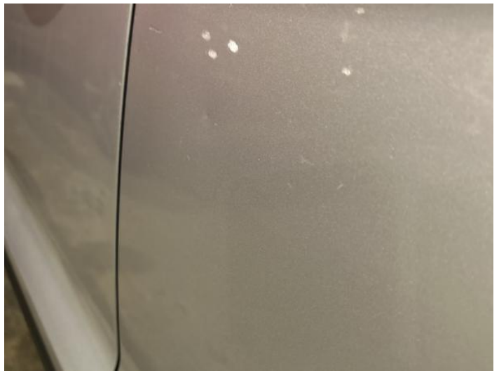
6: Door nsr Dented 2 Or Less UpTo 10mm