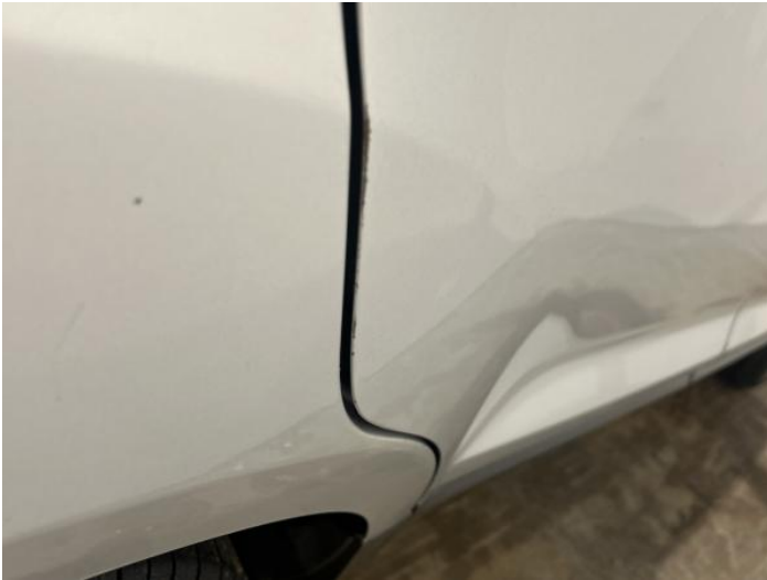
3: Door osr Chipped Edge Chip