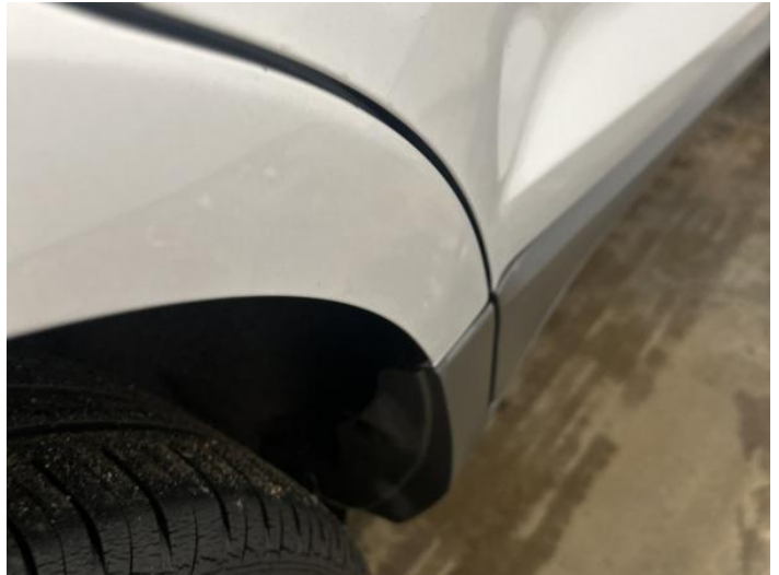
4: Qtr Panel osr Dented 2 Or Less UpTo 10mm