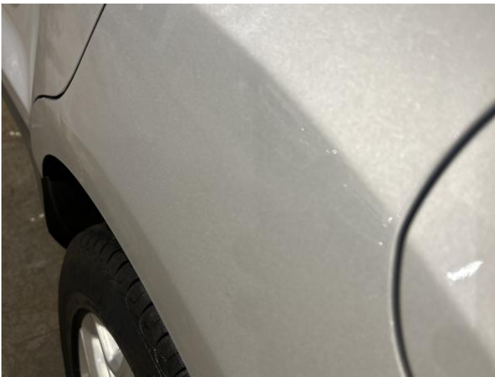
5: Qtr Panel nsr Dented Over 2 UpTo 10mm