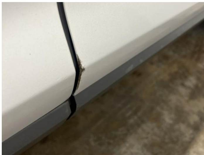
2: Door osf Chipped Edge Chip