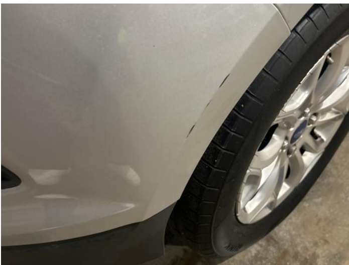
7: Bumper Front Scratched 25 to 100mm Thru Paint