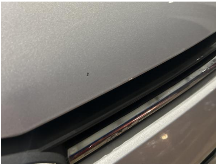
9: Bonnet Chipped 1 To 5