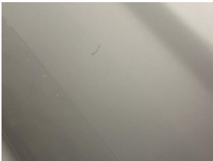
1: Door osf Scratched UpTo 25mm Thru Paint