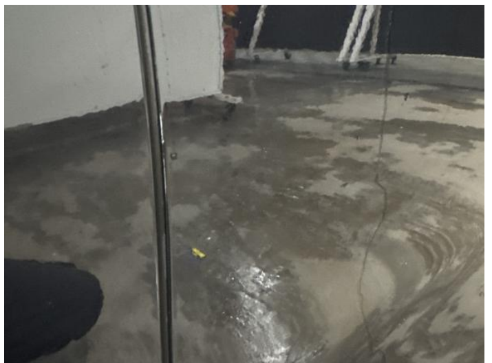
14: Door osf Chipped Edge Chip