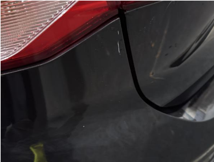
9: Bumper Rear Scratched Up To 25mm Thru Paint