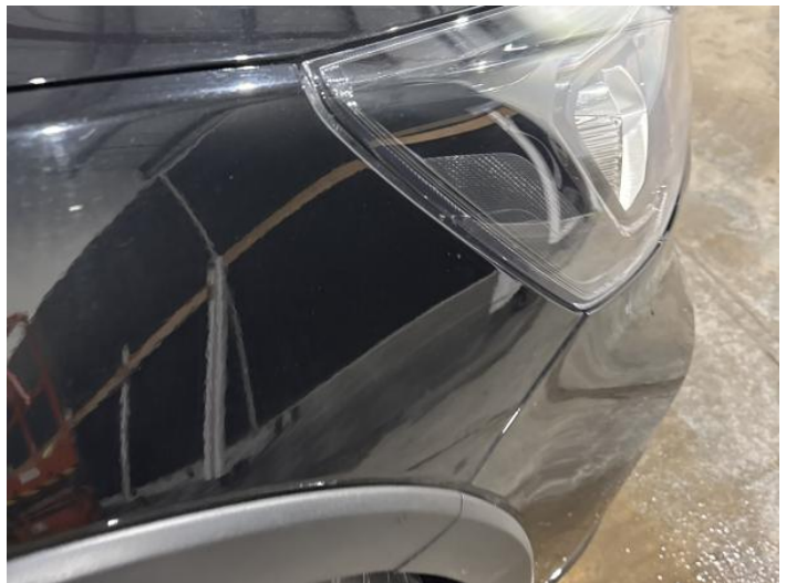
16: Wing osf Chipped 1 To 5