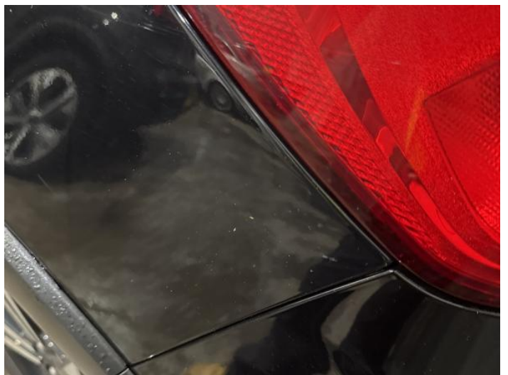
8: Qtr Panel nsr Chipped 1 To 5