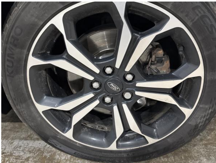
15: Wheel osf Scratched Up To 50mm