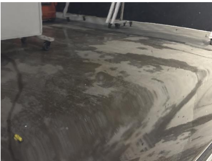
13: Door osf Dented Between 10mm + 30mm