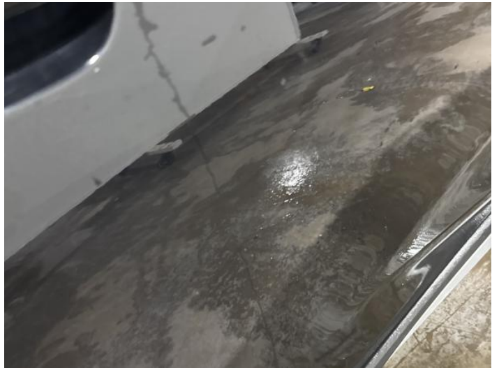
12: Door osr Chipped 1 To 5