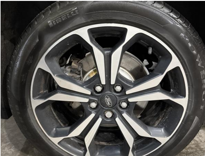
11: Wheel osr Scratched Up To 50mm