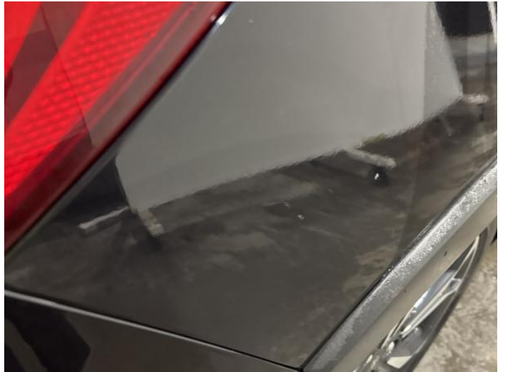
10: Qtr Panel osr Scratched UpTo 25mm Thru Paint