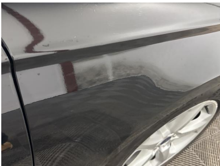
17: Wing osf Dented Between 10mm + 30mm