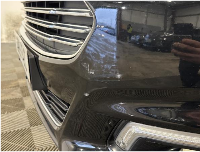
3: Bumper Front Dented With Paint Damage