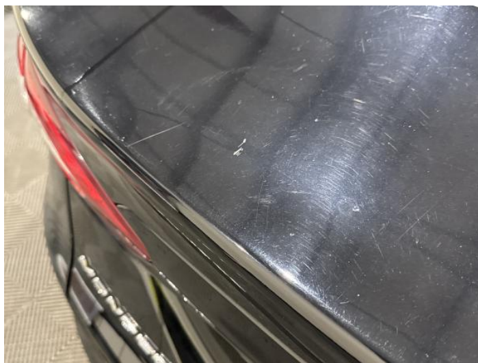
12: Tailgate Scratched Over 25mm Thru Paint