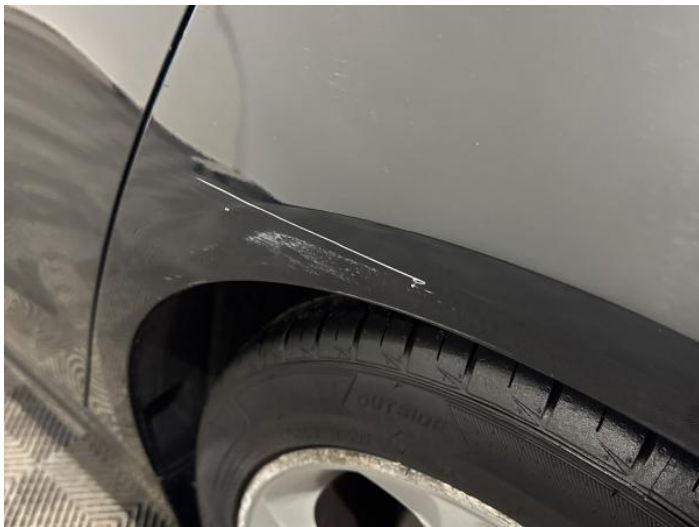
9: Qtr Panel nsr Scratched Over 25mm Thru Paint