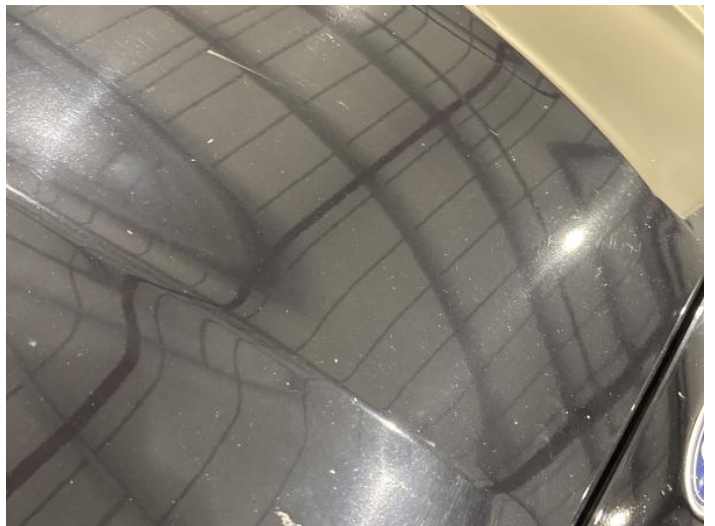
2: Bonnet Chipped Multiple Chips