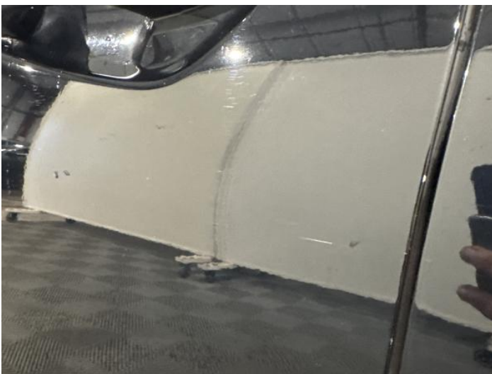
7: Door nsf Scratched UpTo 25mm Thru Paint