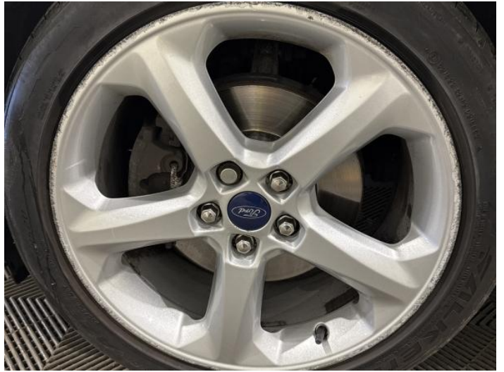
4: Wheel nsf Scratched Over 50mm