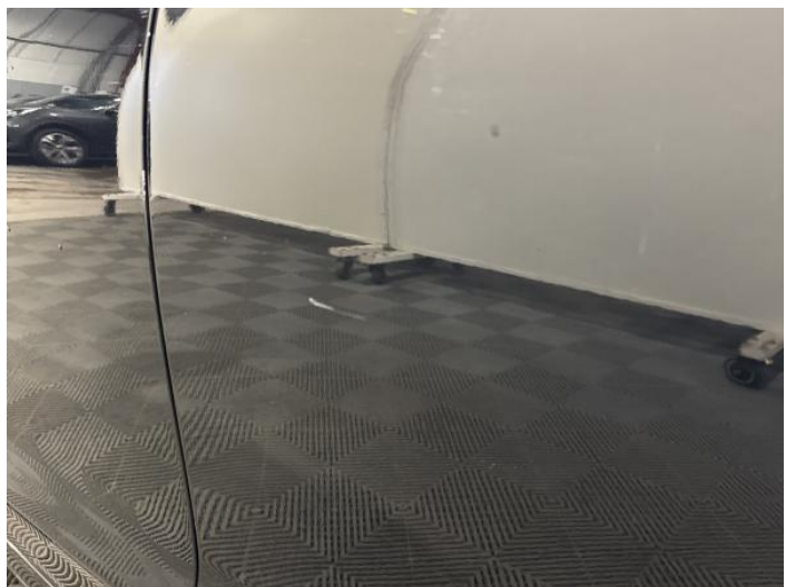
8: Door nsr Scratched Over 25mm Thru Paint