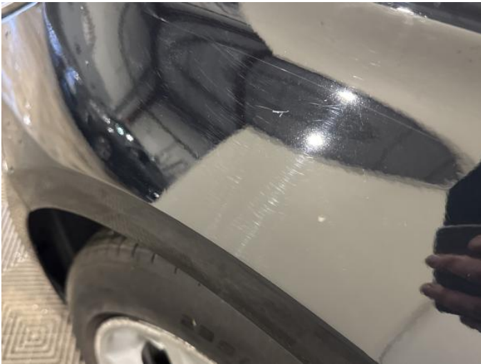
5: Wing nsf Scratched UpTo 25mm Thru Paint