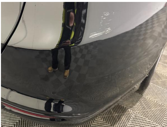
11: Bumper Rear Scratched Over 100mm Thru Paint