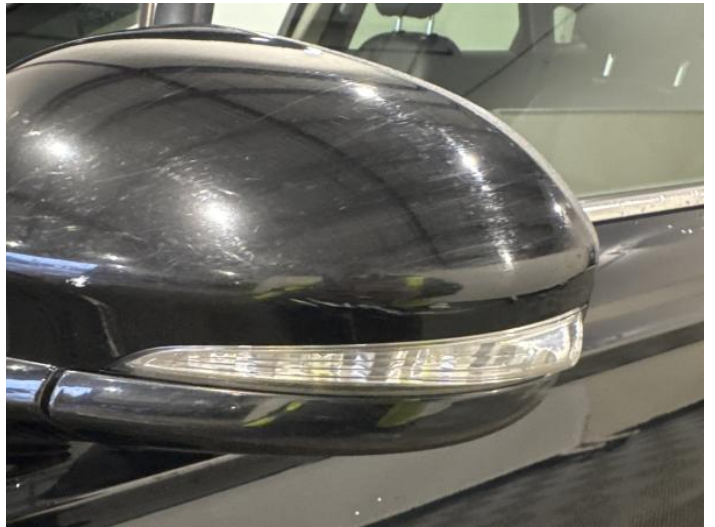
6: Door Mirror Assy nsf Scratched (Painted) Over 25mm Thru Paint