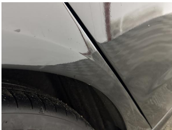
14: Qtr Panel osr Poor Previous Repair Poor Paint