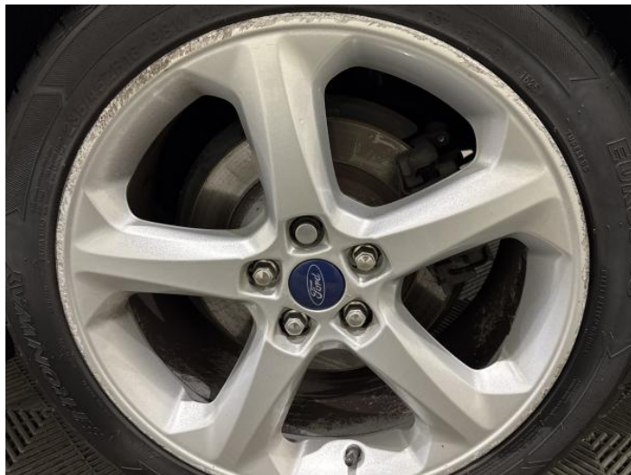
10: Wheel nsr Scratched Over 50mm