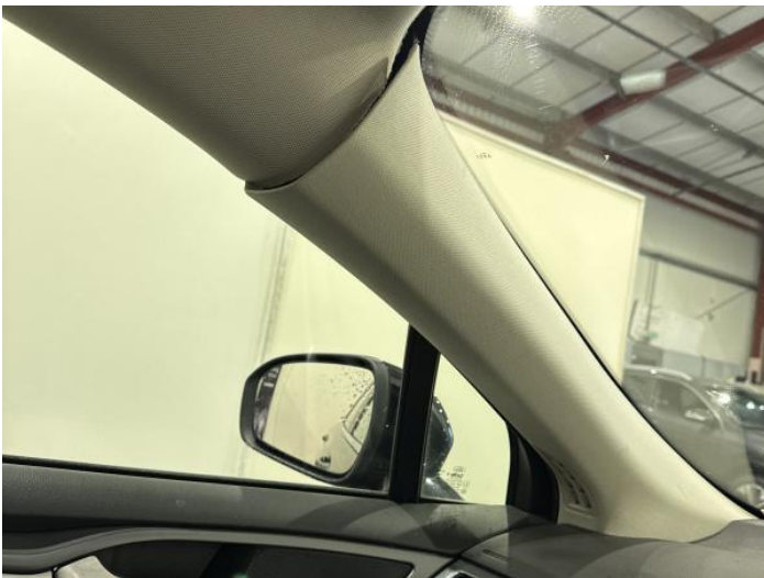
1: Fascia Trim Damaged Replace