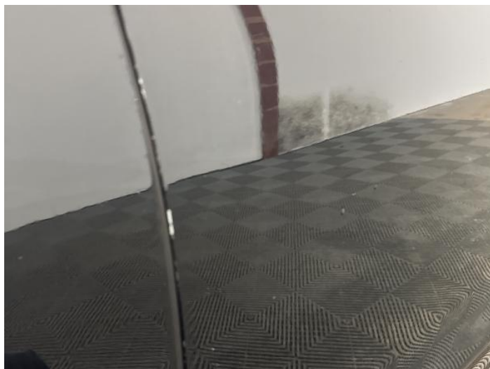
16: Door osf Chipped Edge Chip