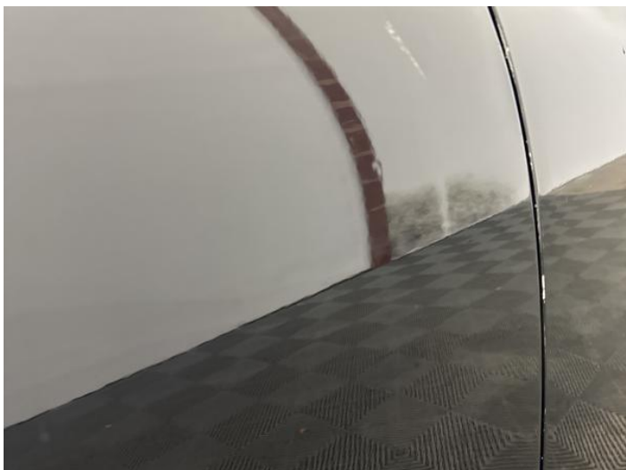
15: Door osr Poor Previous Repair Poor Paint