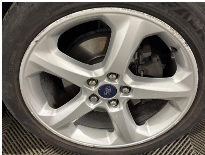
18: Wheel osf Scratched Over 50mm