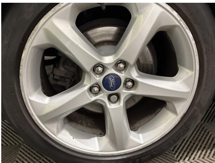
13: Wheel osr Scratched Over 50mm