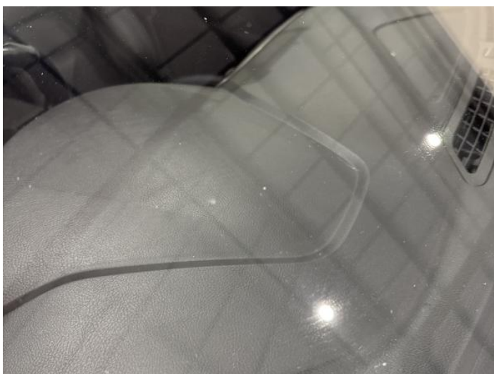
19: Screen Front Chipped UpTo 10mm