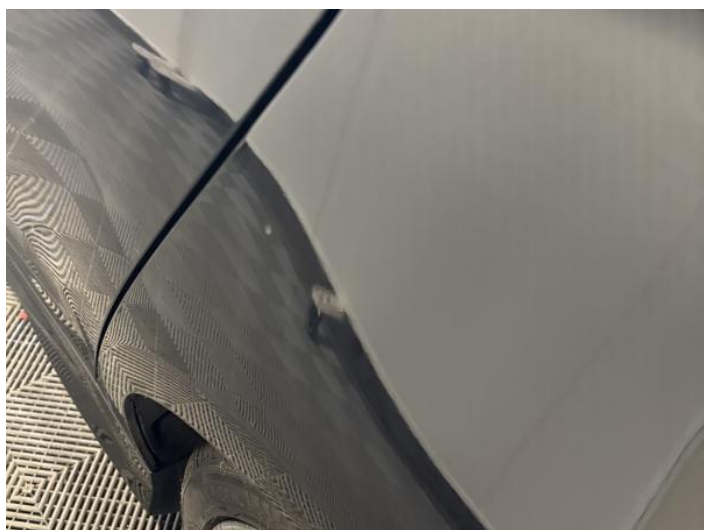
8: Qtr Panel nsr Chipped 1 To 5