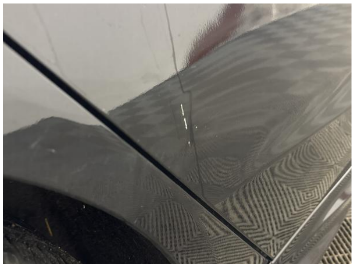
14: Door osr Scratched UpTo 25mm Thru Paint