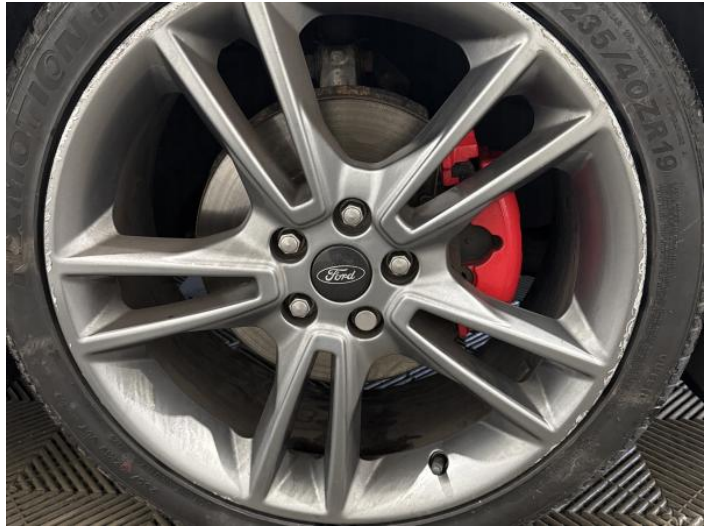
16: Wheel osf Scratched Over 50mm