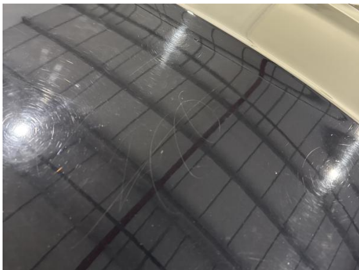
1: Bonnet Scratched Over 25mm Thru Paint