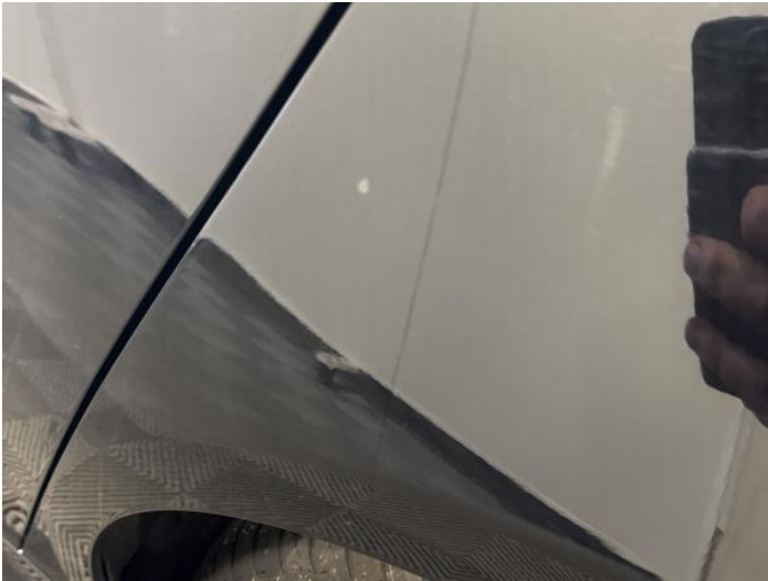
9: Qtr Panel nsr Dented 2 Or Less UpTo 10mm