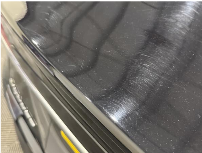
11: Tailgate Scratched UpTo 25mm Thru Paint