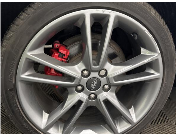
13: Wheel osr Scratched Over 50mm