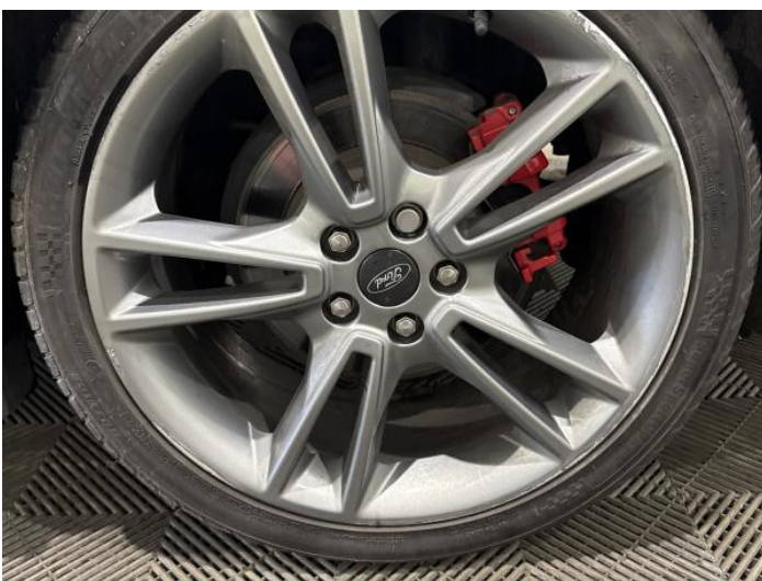
7: Wheel nsr Scratched Over 50mm