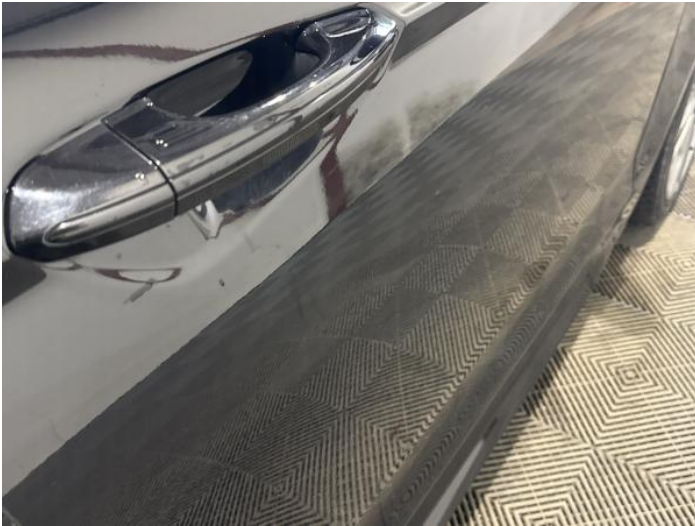
15: Door osf Dented Between 10mm + 30mm