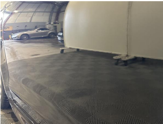
5: Door nsf Dented Between 10mm + 30mm