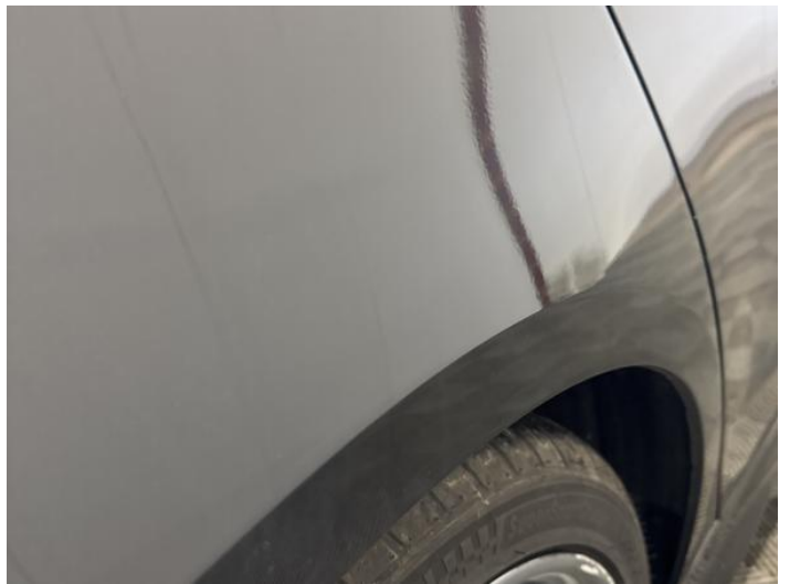
12: Qtr Panel osr Dented Between 10mm + 30mm