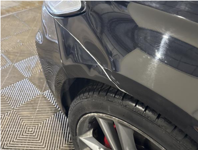
3: Wing nsf Dented With Paint Damage