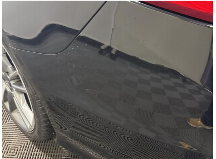
10: Bumper Rear Scratched 25 to 100mm Thru Paint