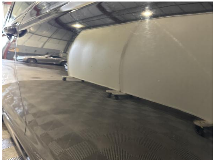
6: Door nsr Poor Previous Repair Rippled Up To 30%