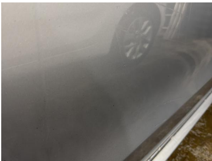
5: Door nsf Chipped 1 To 5