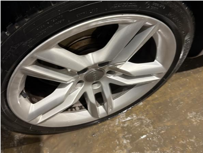
15: Wheel osr Scratched Up To 50mm