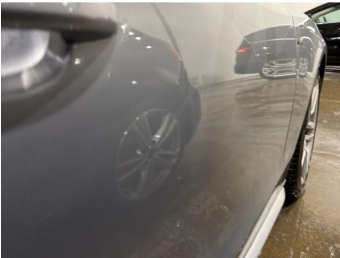
17: Door osf Dented Over 2 UpTo 10mm