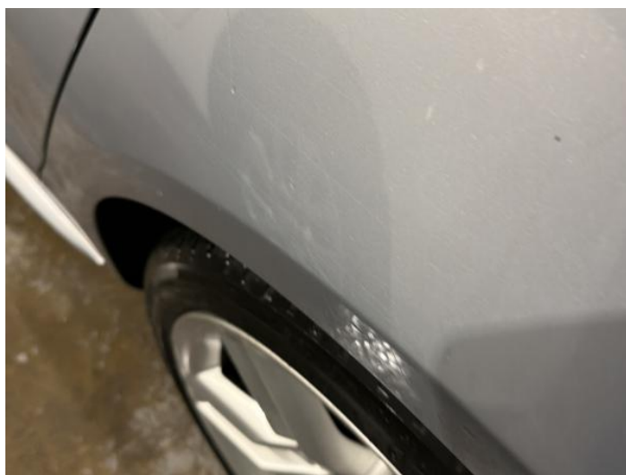
8: Qtr Panel nsr Dented Over 2 UpTo 10mm