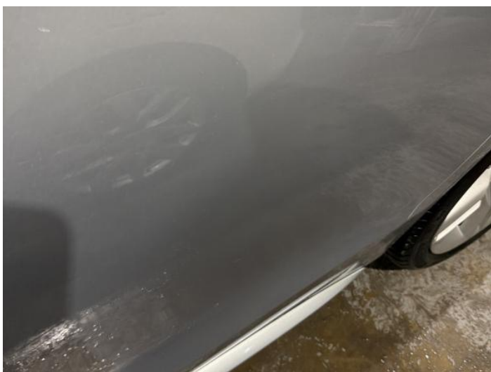
7: Door nsr Dented With Paint Damage