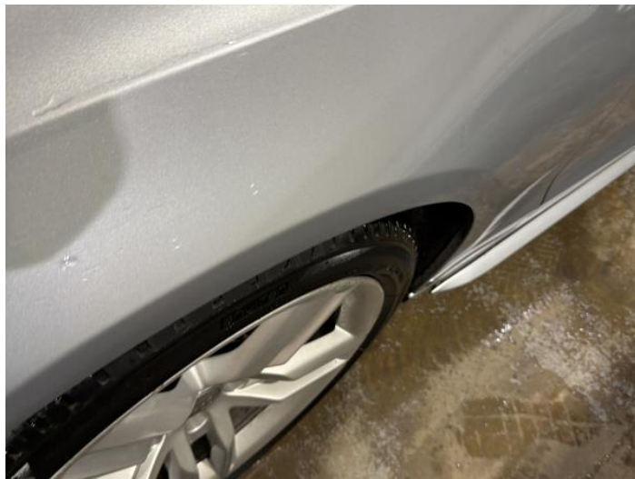
4: Wing nsf Chipped 1 To 5