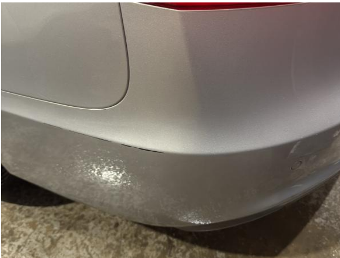
11: Bumper Rear Scratched 25 to 100mm Thru Paint