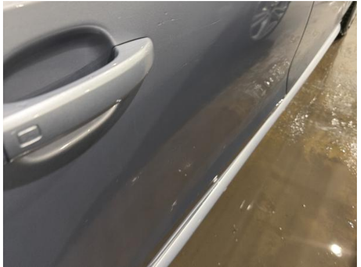
16: Door osr Poor Previous Repair Poor Paint