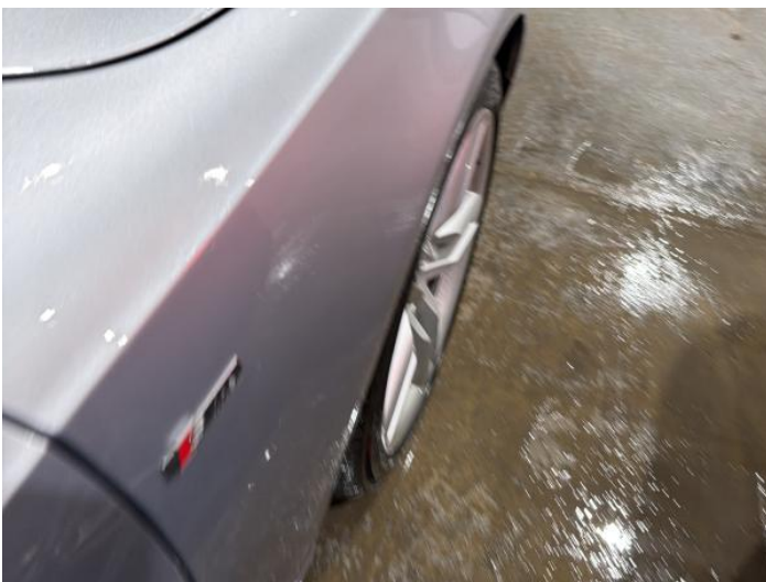
19: Wing osf Chipped 1 To 5