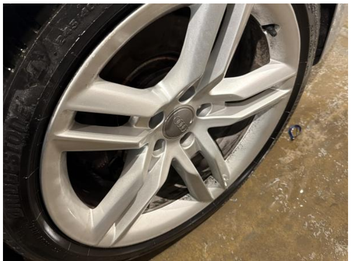
20: Wheel osf Scratched Up To 50mm