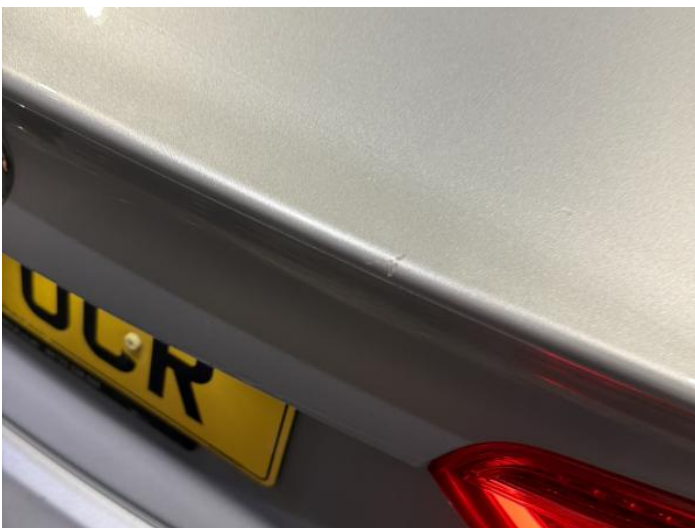
13: Boot Lid Chipped 1 To 5