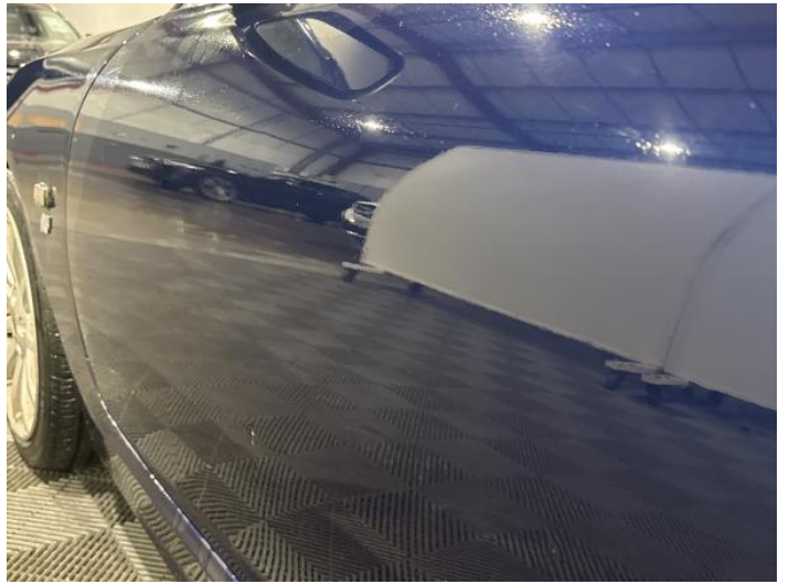
6: Door nsf Dented Over 30mm