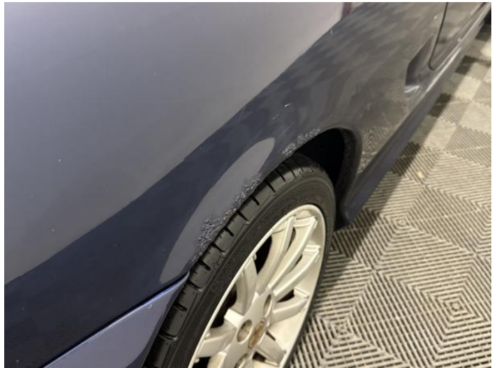
12: Qtr Panel osr Rusted Over 5mm