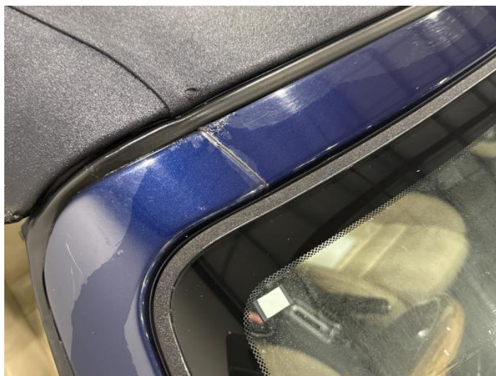
18: A Post os Rusted Over 5mm