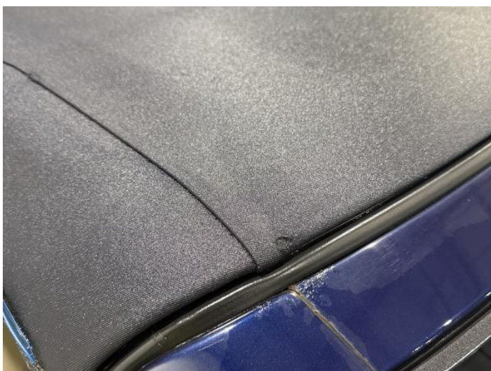
19: Roof Soft Top Scuffed Over 25mm