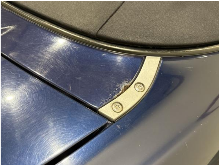
11: Panel Rear Rusted Over 5mm