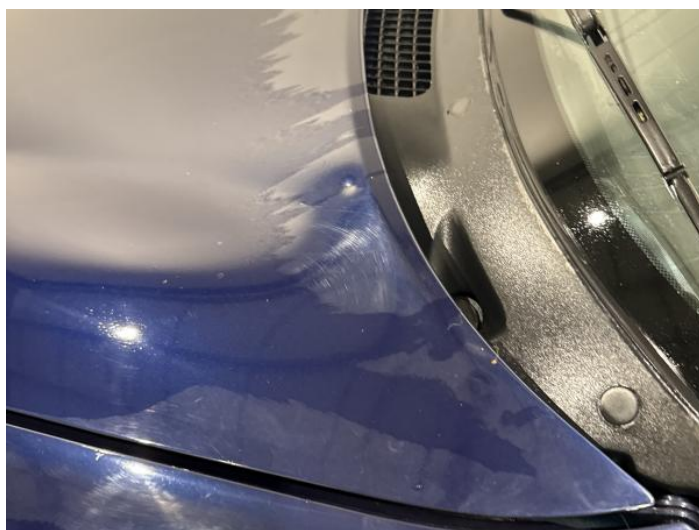
20: Bonnet Dented Between 10mm + 30mm