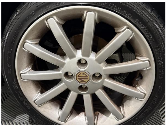
8: Wheel nsr Scratched Up To 50mm