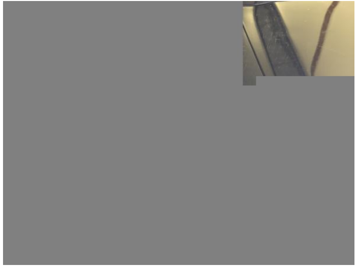
10: Boot Lid Scratched Over 25mm Thru Paint