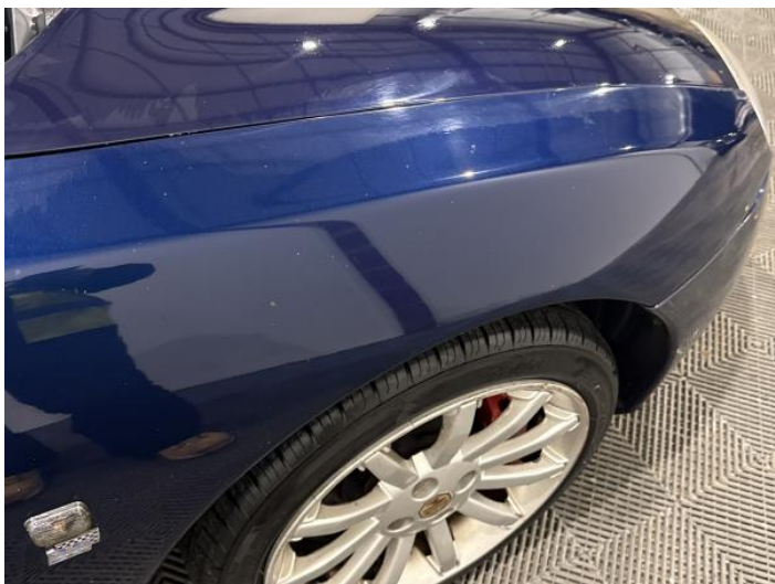
15: Wing osf Chipped Multiple Chips