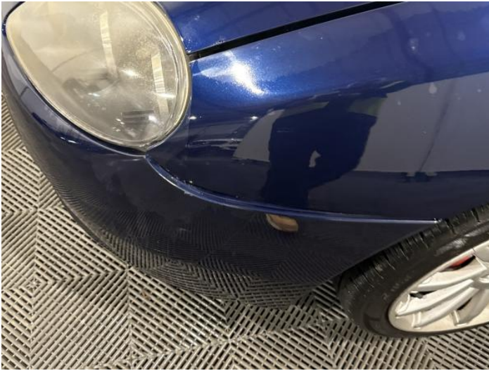
3: Bumper Front Insecure Action Required