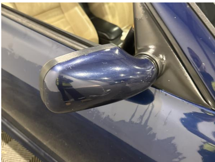
17: Door Mirror Assy osf Scratched (Painted) Over 25mm Thru Paint