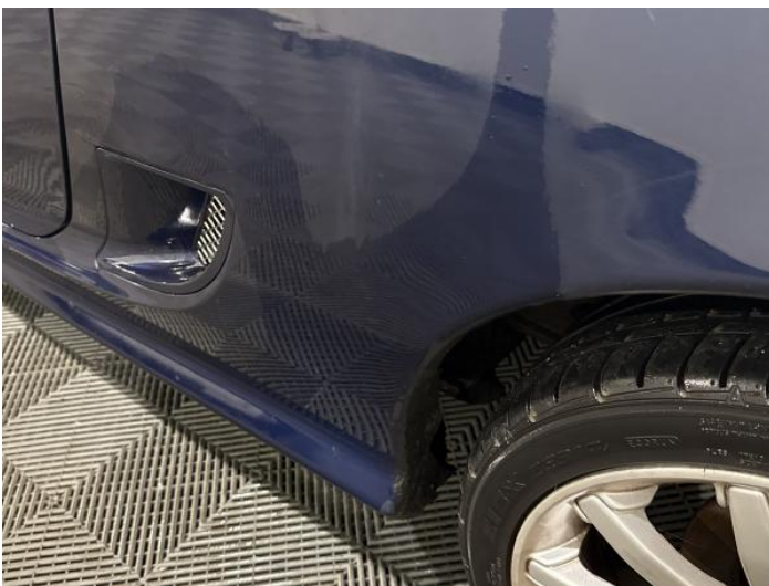
7: Qtr Panel nsr Scratched Rusted