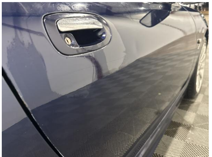
14: Door osf Dented Over 30mm