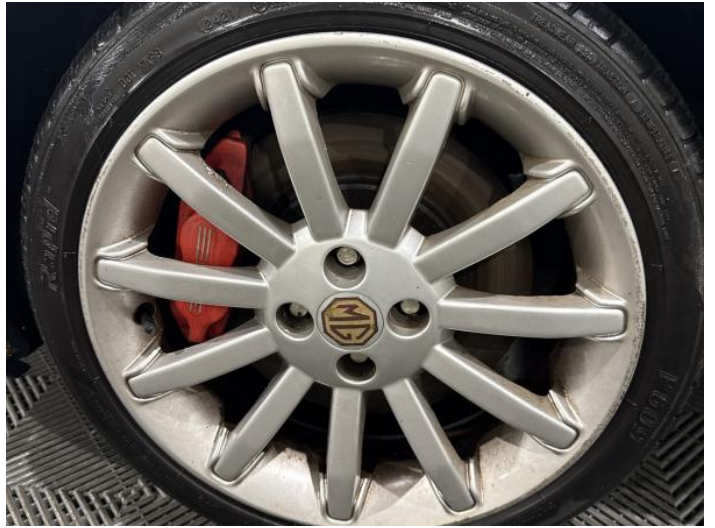
4: Wheel nsf Scratched Over 50mm