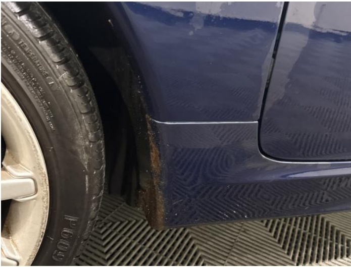
5: Wing nsf Rusted Over 5mm