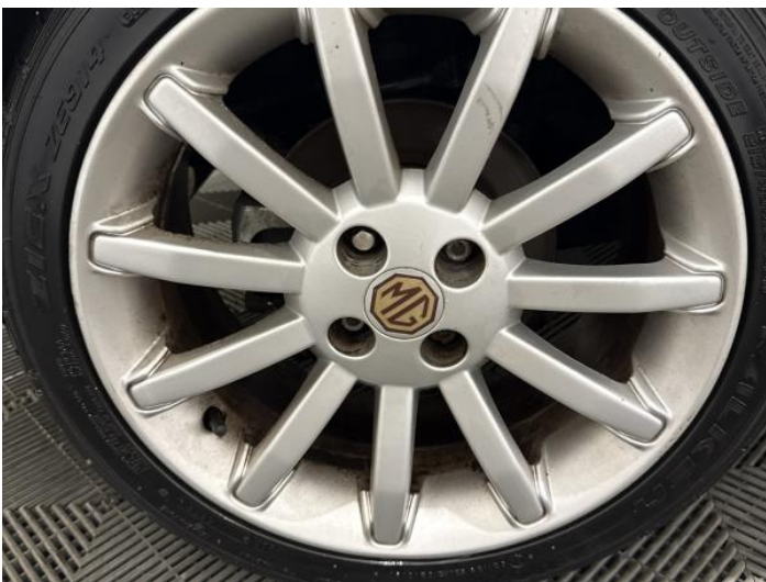
13: Wheel osr Scratched Up To 50mm