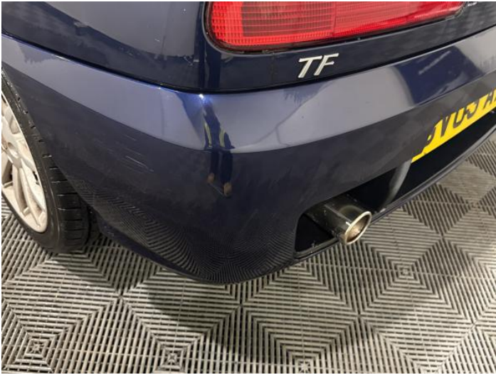
9: Bumper Rear Scratched Over 100mm Thru Paint