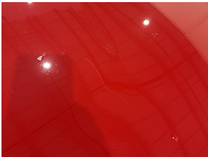
1: Bonnet Scratched Over 25mm Thru Paint