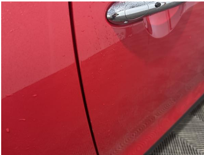
5: Door osf Chipped Edge Chip