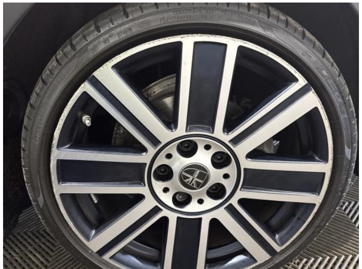
6: Wheel osf Scratched Over 50mm