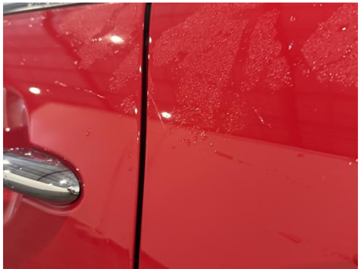
4: Qtr Panel nsr Scratched UpTo 25mm Thru Paint