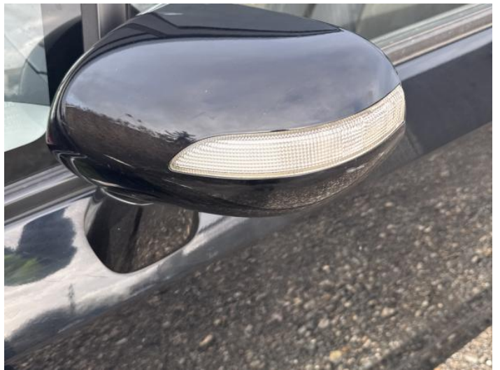
6: Door Mirror Assy nsf Scratched (Painted) UpTo 25mm Thru Paint