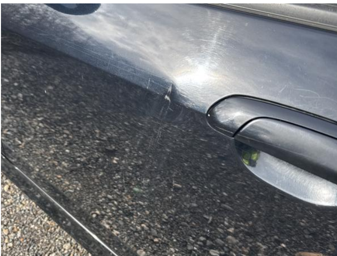
7: Door nsf Dented With Paint Damage