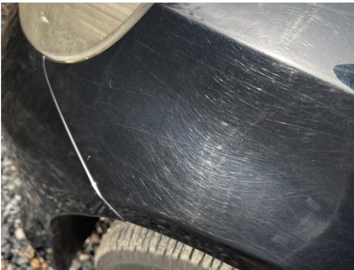
5: Wing nsf Scratched UpTo 25mm Thru Paint