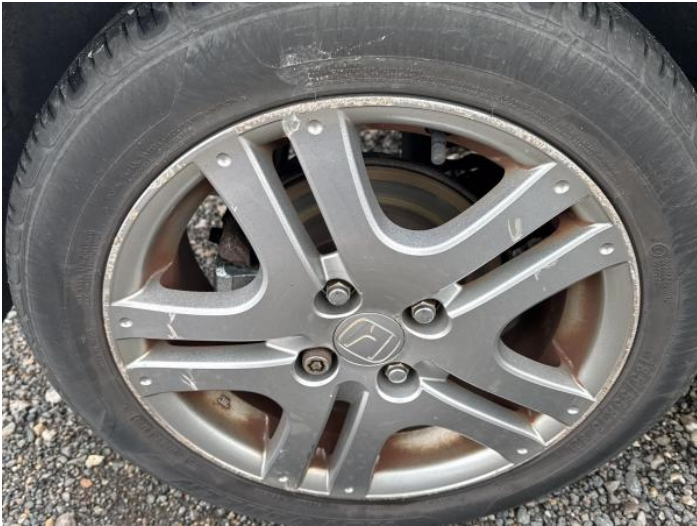
15: Wheel osr Scratched Over 50mm