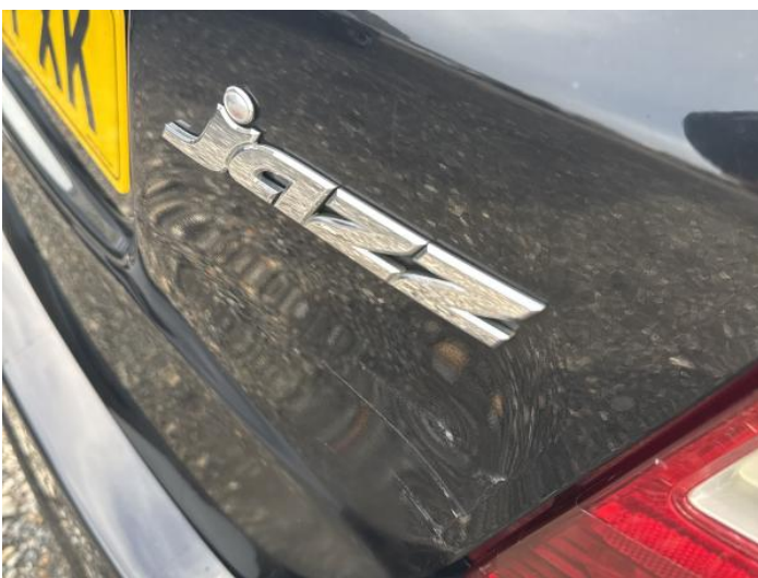
13: Tailgate Dented Over 30mm