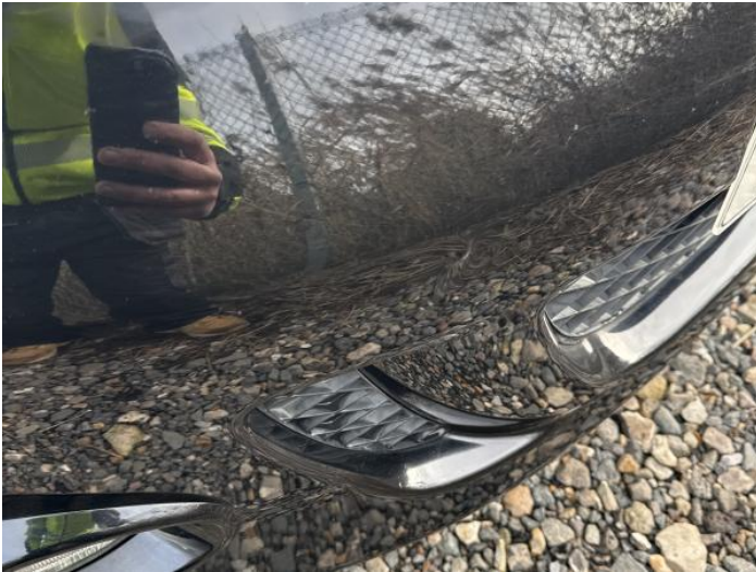
3: Bumper Front Cracked UpTo 25mm