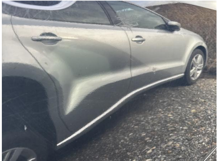
16: Door osr Scratched Over 25mm Thru Paint