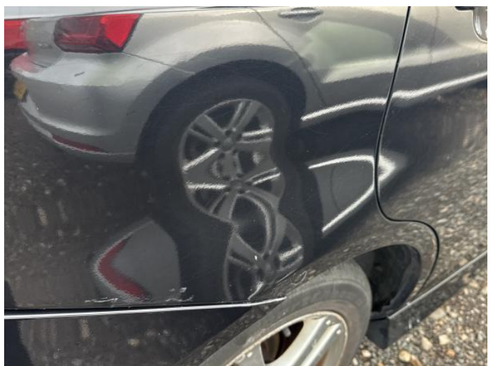
14: Qtr Panel osr Scratched Over 25mm Thru Paint