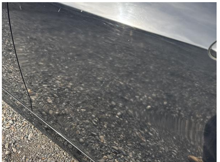
8: Door nsr Poor Previous Repair Poor Colour