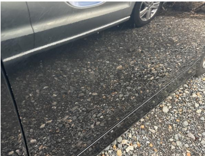
17: Door osf Dented Over 30mm