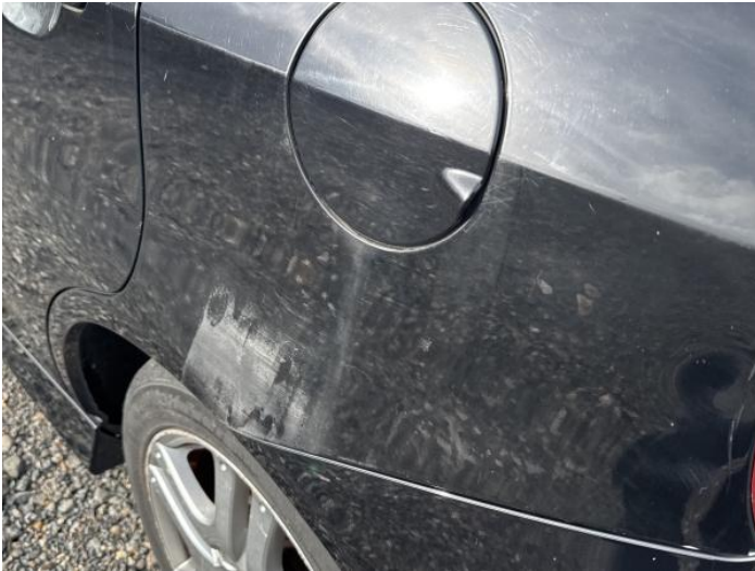
9: Qtr Panel nsr Scratched Over 25mm Thru Paint