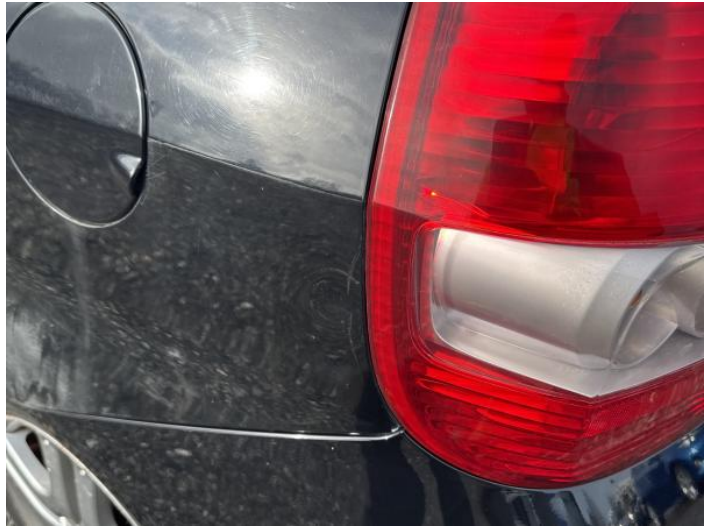
10: Qtr Panel nsr Dented Between 10mm + 30mm