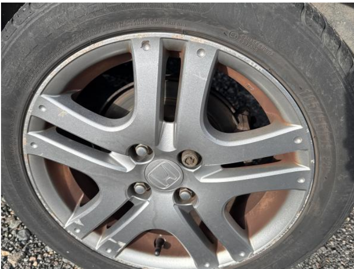
11: Wheel nsr Scratched Over 50mm