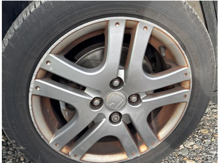
4: Wheel nsf Scratched Over 50mm