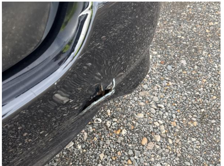
12: Bumper Rear Cracked Over 25mm