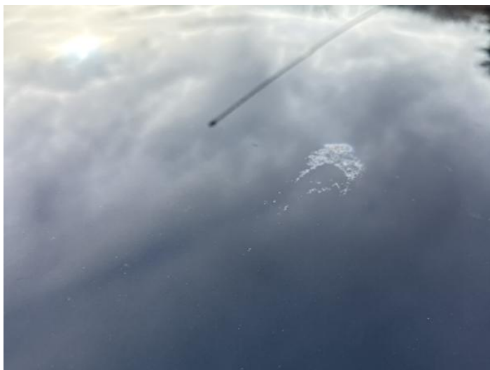
1: Roof Dented Between 10mm + 30mm