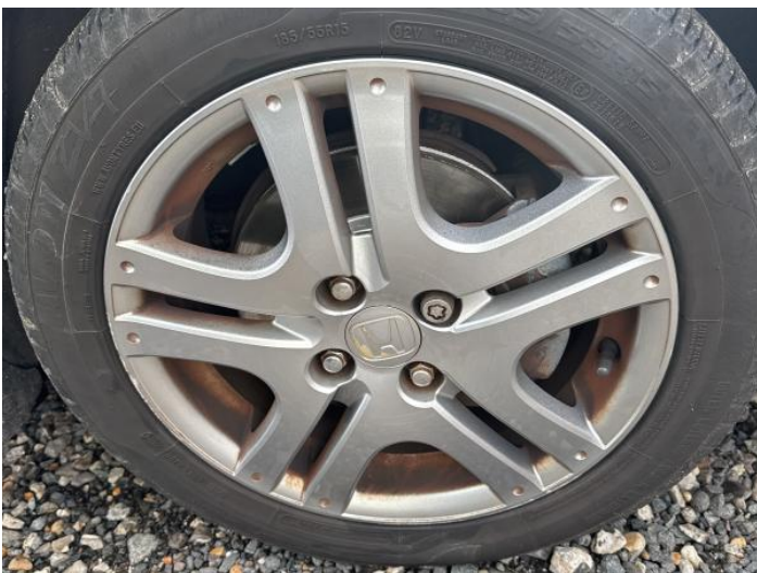
19: Wheel osf Scratched Over 50mm