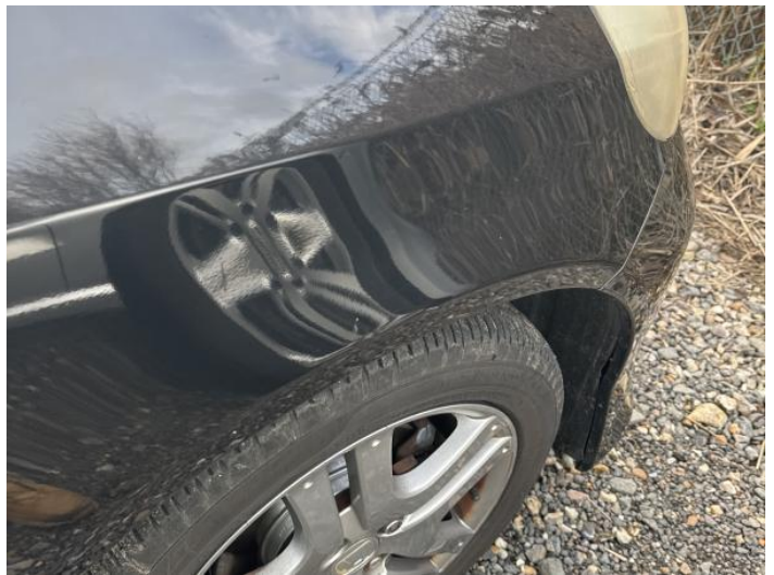
18: Wing osf Scratched Over 25mm Thru Paint