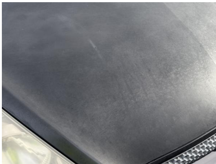
2: Bonnet Poor Previous Repair Paint Flake