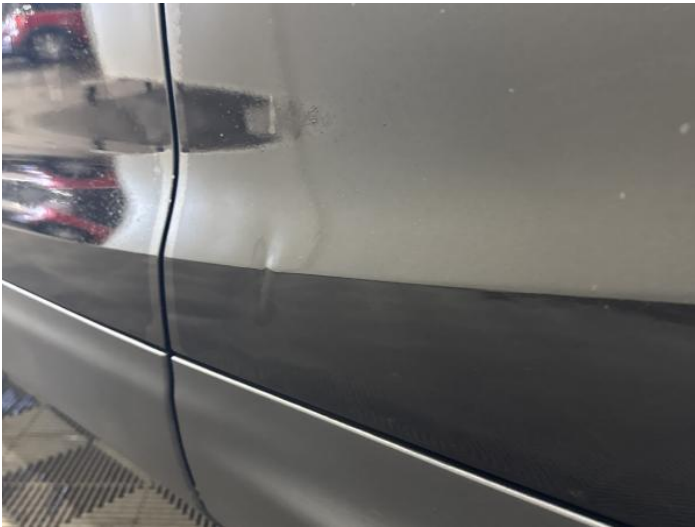
11: Door nsr Dented Over 30mm