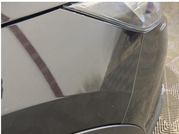
21: Wing osf Chipped 1 To 5