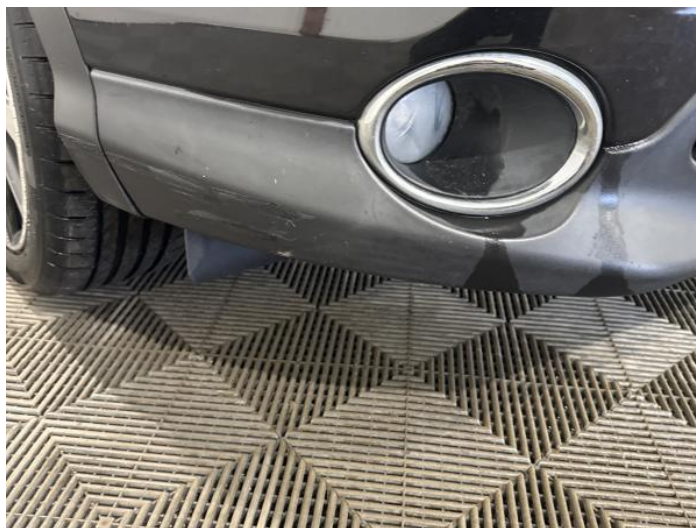
2: Bumper Front Moulding Scuffed (Unpainted) Over 100mm