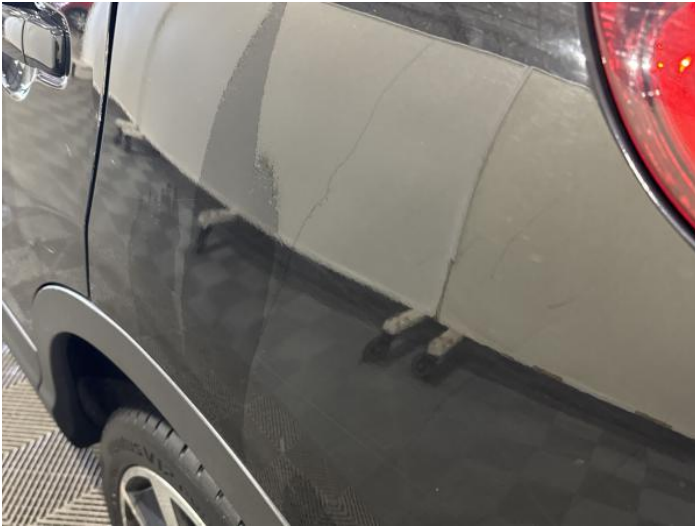
9: Qtr Panel nsr Scratched Over 25mm Thru Paint