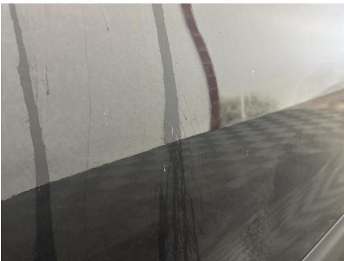
19: Door osf Dented Over 30mm