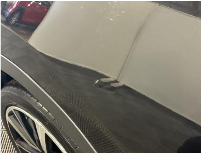
5: Wing nsf Scratched UpTo 25mm Thru Paint