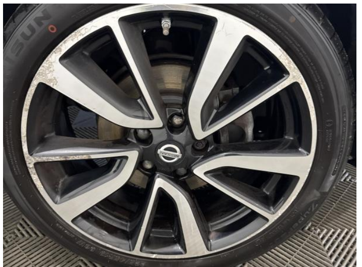
20: Wheel osf Scratched Over 50mm