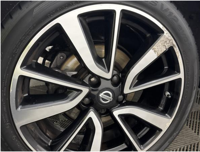
15: Wheel osr Corroded Light