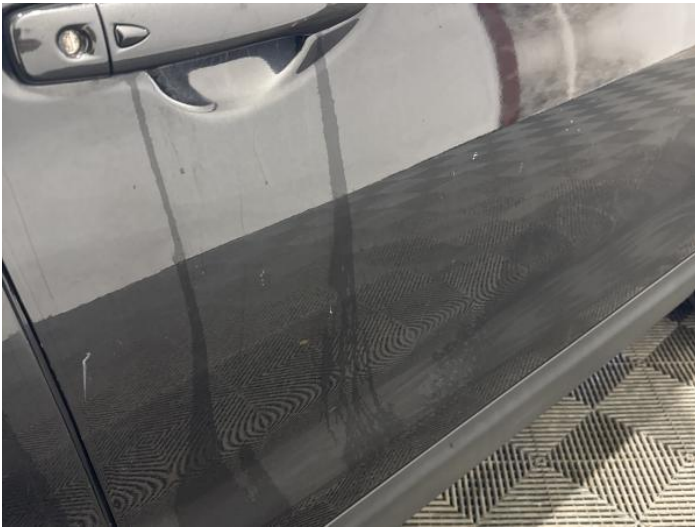
17: Door osf Scratched Over 25mm Thru Paint