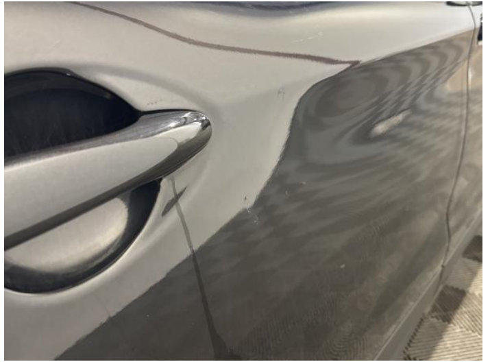
16: Door osr Dented Between 10mm + 30mm