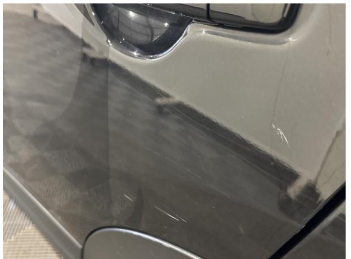
8: Door nsr Scratched Over 25mm Thru Paint