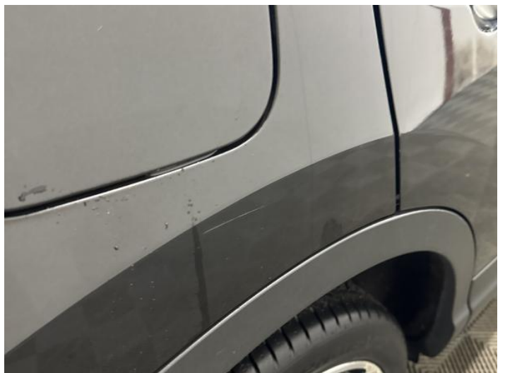
14: Qtr Panel osr Scratched Over 25mm Thru Paint