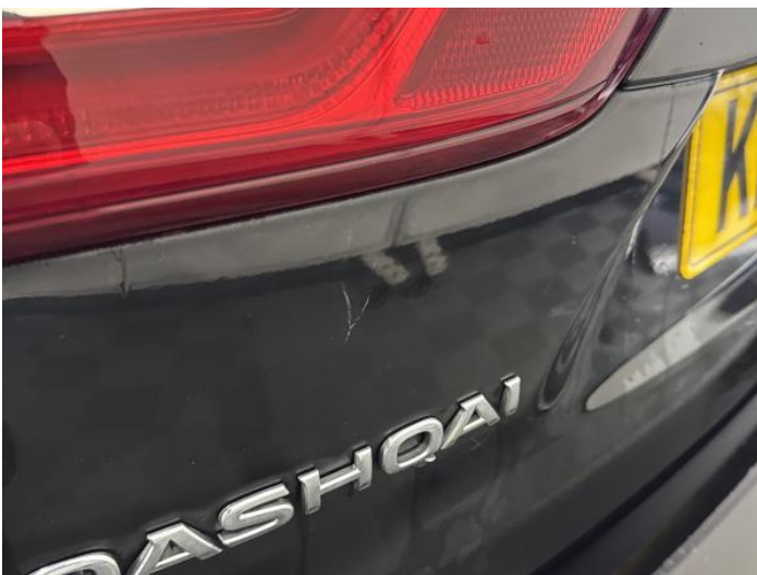
13: Tailgate Scratched UpTo 25mm Thru Paint