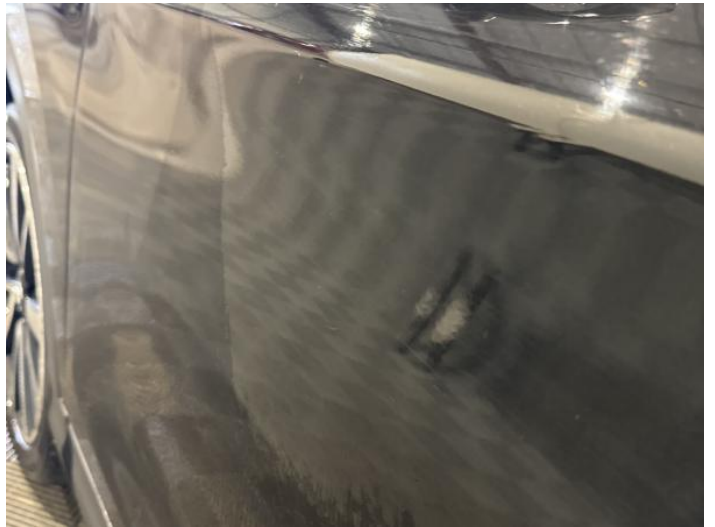
6: Door nsf Scratched Over 25mm Thru Paint