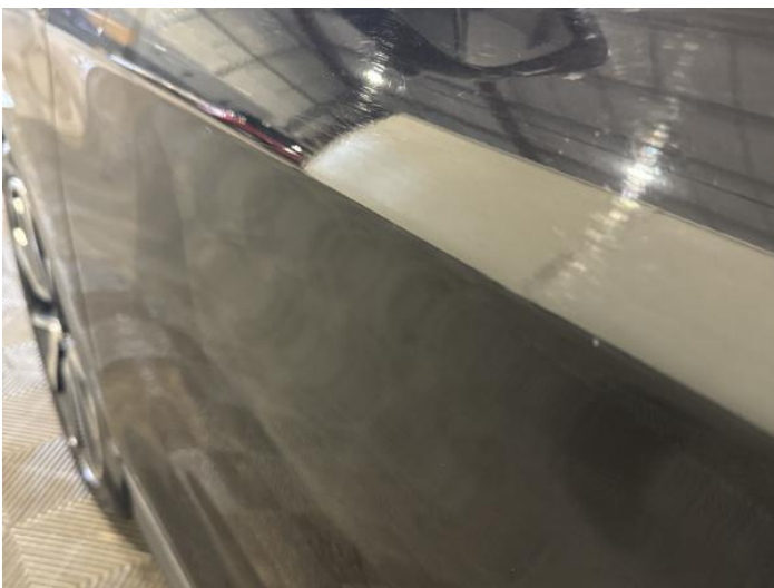
7: Door nsf Dented Between 10mm + 30mm