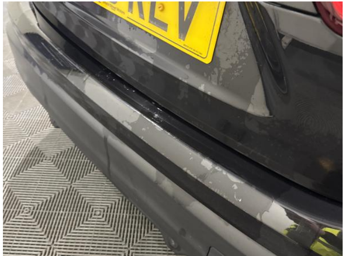
12: Bumper Rear Scratched 25 to 100mm Thru Paint