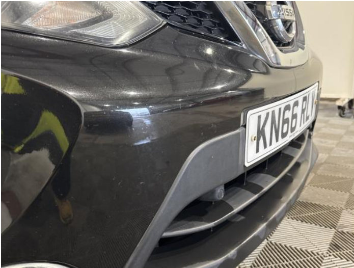
3: Bumper Front Chipped Multiple Chips