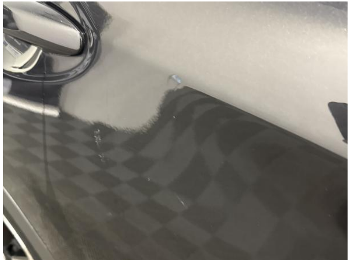
18: Door osr Scratched UpTo 25mm Thru Paint