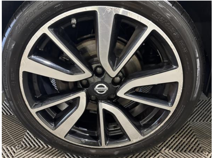
4: Wheel nsf Scratched Over 50mm