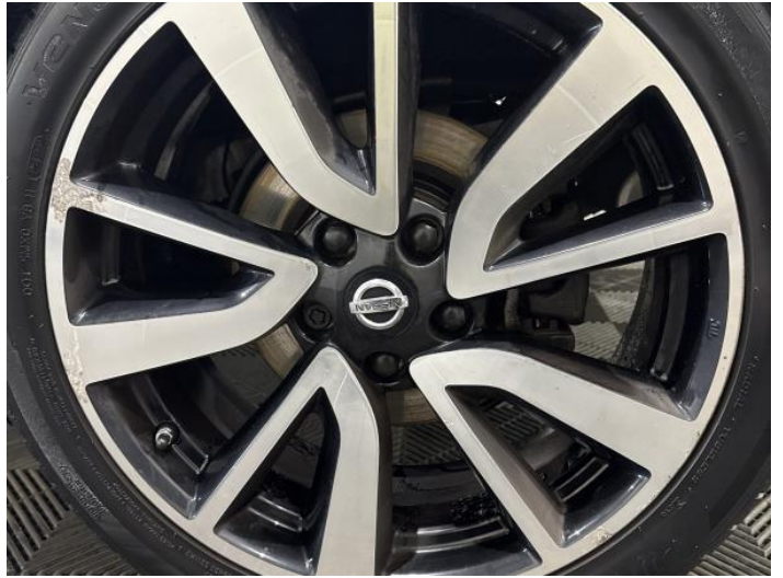
10: Wheel nsr Scratched Over 50mm