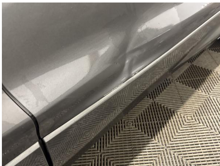
12: Door osf Dented Over 30mm