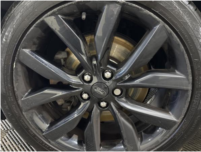
3: Wheel nsf Scratched Over 50mm