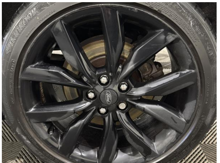
8: Wheel nsr Scratched Over 50mm