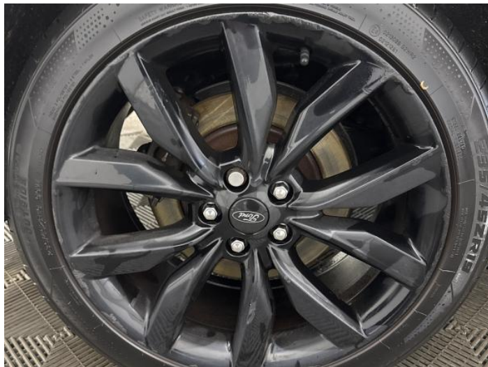
10: Wheel osr Scratched Over 50mm