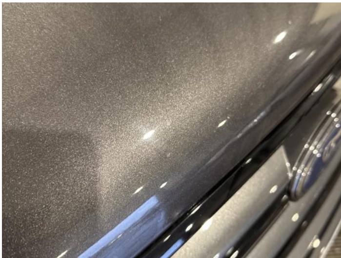
1: Bonnet Chipped 1 To 5