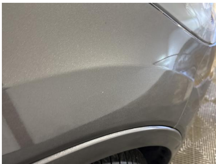
14: Wing osf Chipped 1 To 5