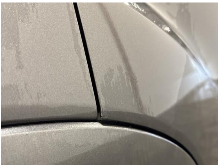
11: Door osr Chipped Edge Chip