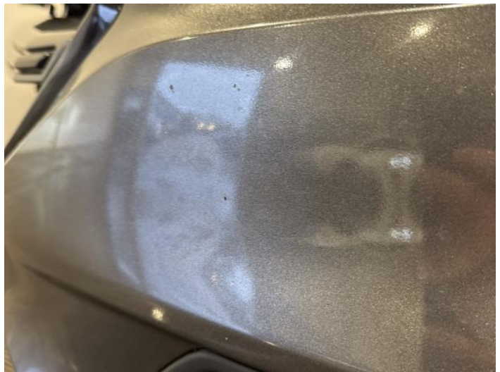
2: Bumper Front Poor Previous Repair Poor Colour