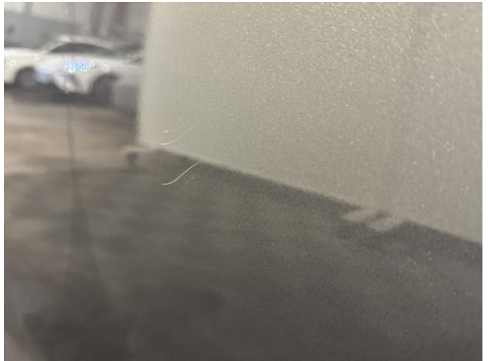
6: Door nsf Scratched Over 25mm Thru Paint