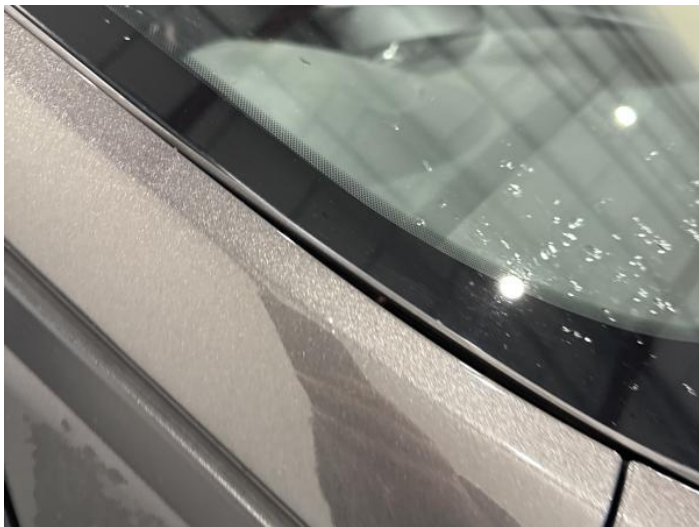
15: A Post os Chipped 1 To 5