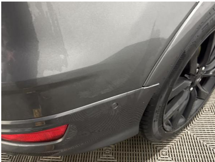
9: Bumper Rear Scratched 25 to 100mm Thru Paint