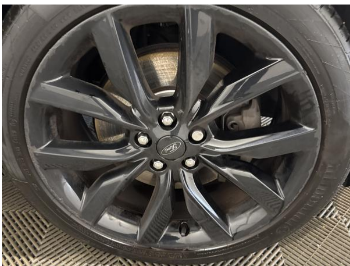
13: Wheel osf Scratched Over 50mm