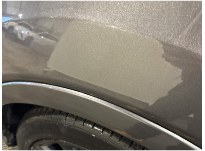
4: Wing nsf Scratched UpTo 25mm Thru Paint