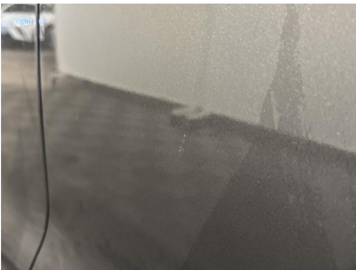
7: Door nsr Scratched UpTo 25mm Thru Paint