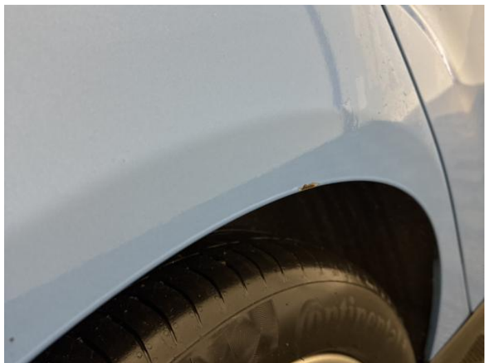
8: Qtr Panel osr Scratched Rusted