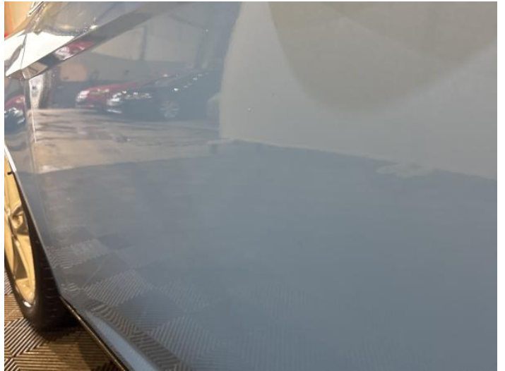
4: Door nsf Dented Over 30mm