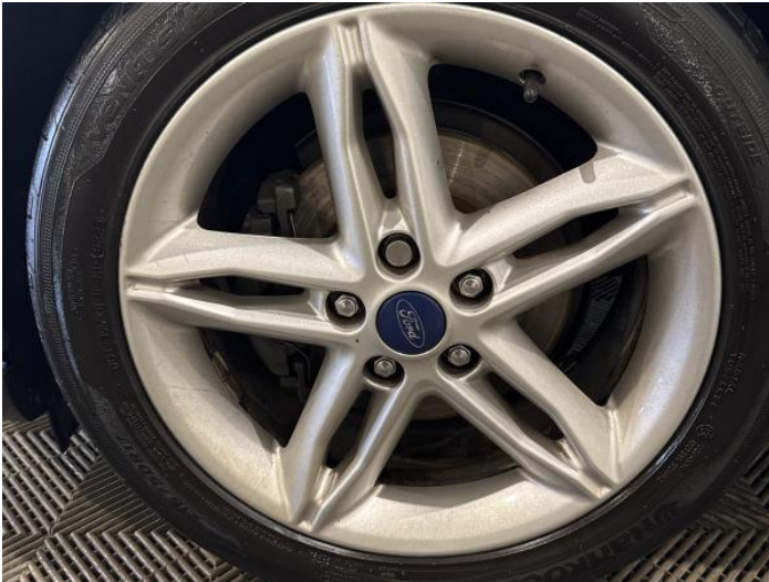
3: Wheel nsf Scratched Up To 50mm