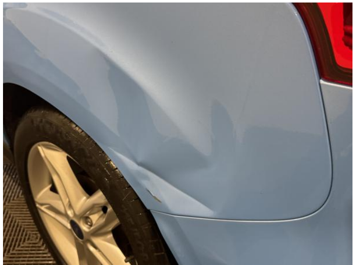
6: Qtr Panel nsr Dented With Paint Damage