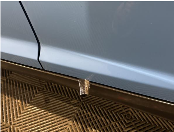
5: Aperture Seal nsr Broken Replace