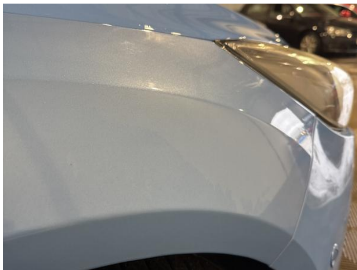
10: Wing osf Poor Previous Repair Poor Colour