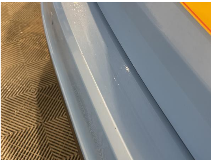
7: Bumper Rear Chipped 1 To 5