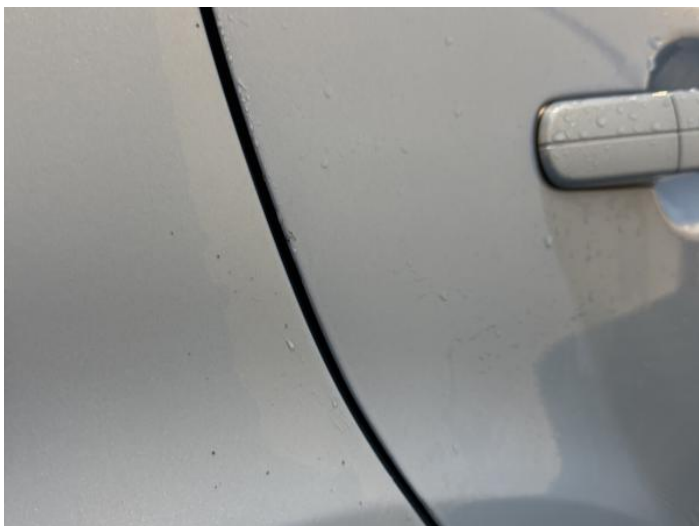
9: Door osr Chipped Edge Chip