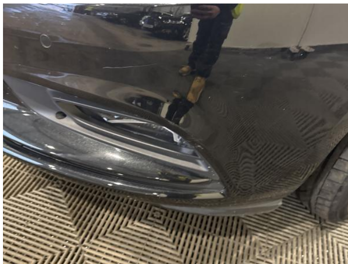
2: Bumper Front Scratched 25 to 100mm Thru Paint