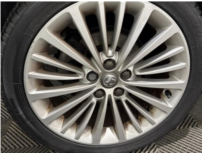
11: Wheel osr Scratched Up To 50mm