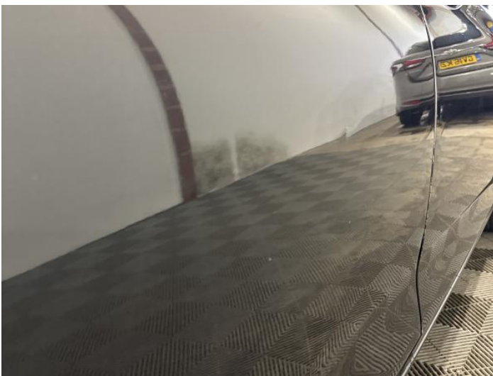
13: Door osr Dented Between 10mm + 30mm