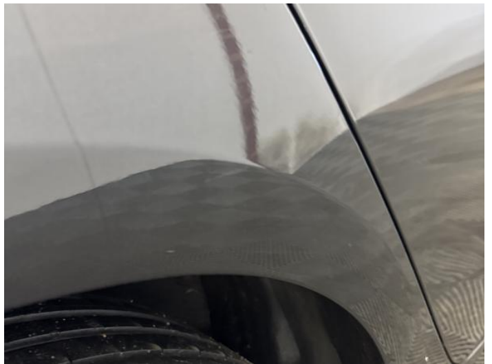
12: Qtr Panel osr Scratched UpTo 25mm Thru Paint