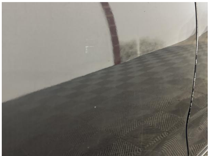
14: Door osr Scratched Over 25mm Thru Paint