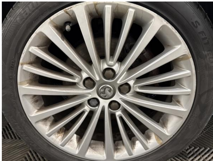
16: Wheel osf Scratched Over 50mm