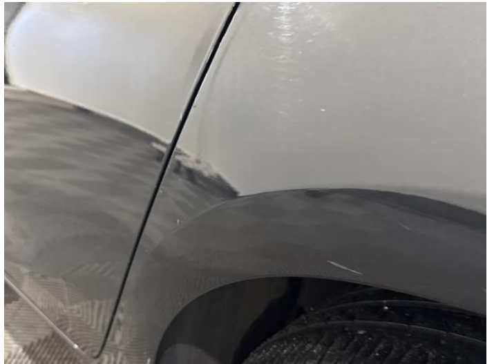
6: Qtr Panel nsr Dented Between 10mm + 30mm