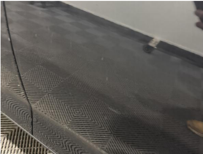
5: Door nsr Scratched Over 25mm Thru Paint