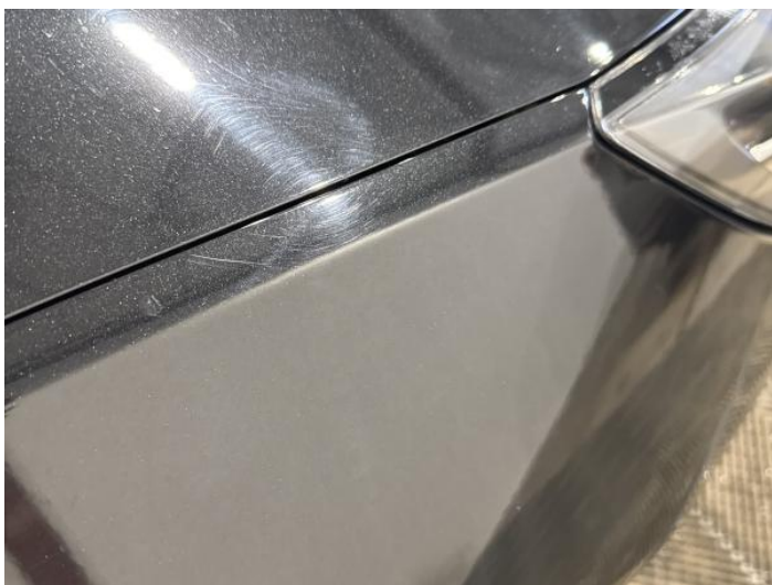
17: Wing osf Scratched UpTo 25mm Thru Paint