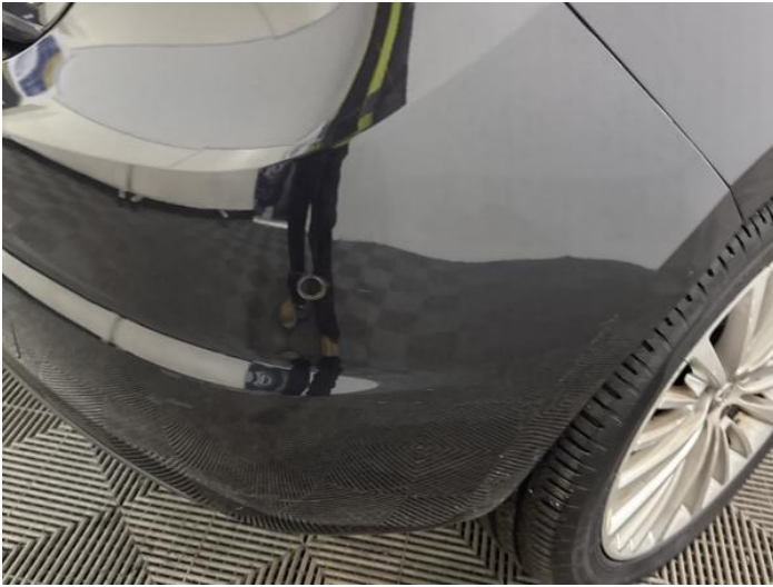
9: Bumper Rear Scratched Over 100mm Thru Paint