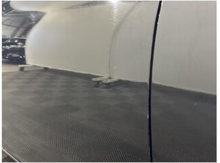
4: Door nsf Chipped 1 To 5