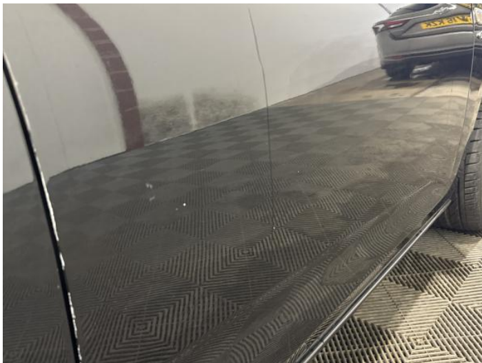
15: Door osf Scratched Over 25mm Thru Paint