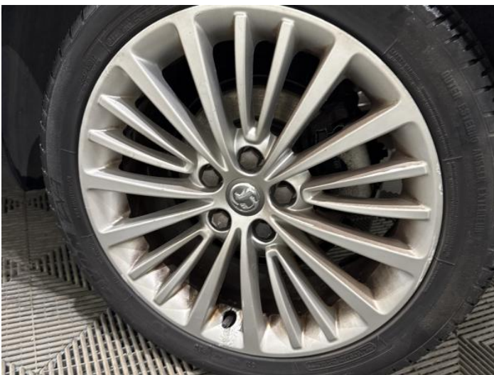
7: Wheel nsr Scratched Over 50mm