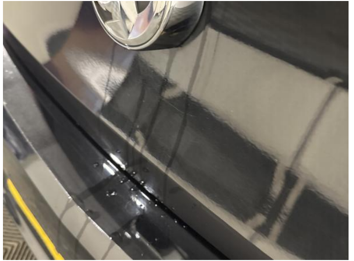
10: Tailgate Scratched UpTo 25mm Thru Paint