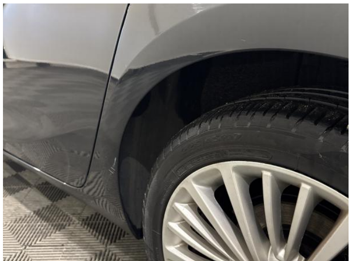
8: Qtr Panel nsr Scratched Over 25mm Thru Paint