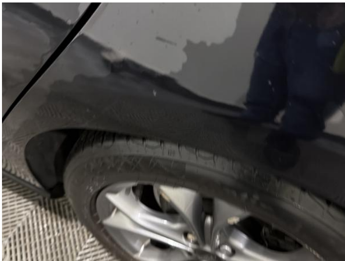
9: Qtr Panel nsr Chipped 1 To 5