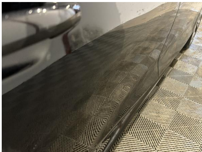
16: Door osr Chipped 1 To 5