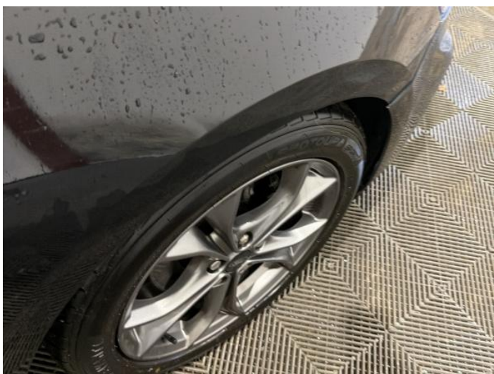
19: Wing osf Dented Over 2 UpTo 10mm