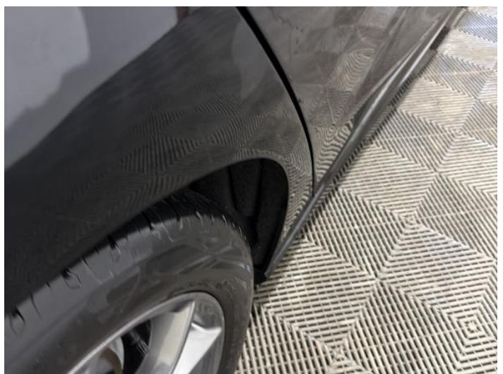
14: Qtr Panel osr Dented 2 Or Less UpTo 10mm