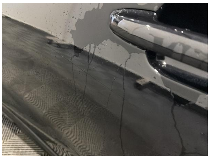
7: Door nsf Scratched Over 25mm Not Thru Paint