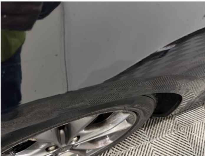
5: Wing nsf Dented Over 2 UpTo 10mm