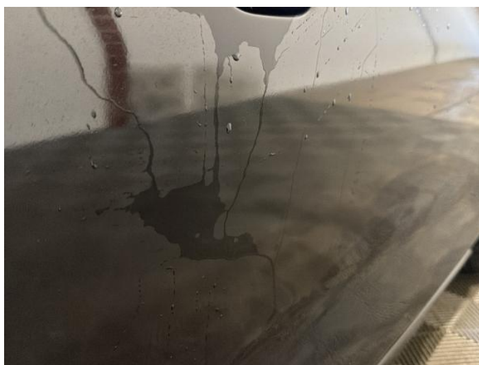
18: Door osf Chipped 1 To 5