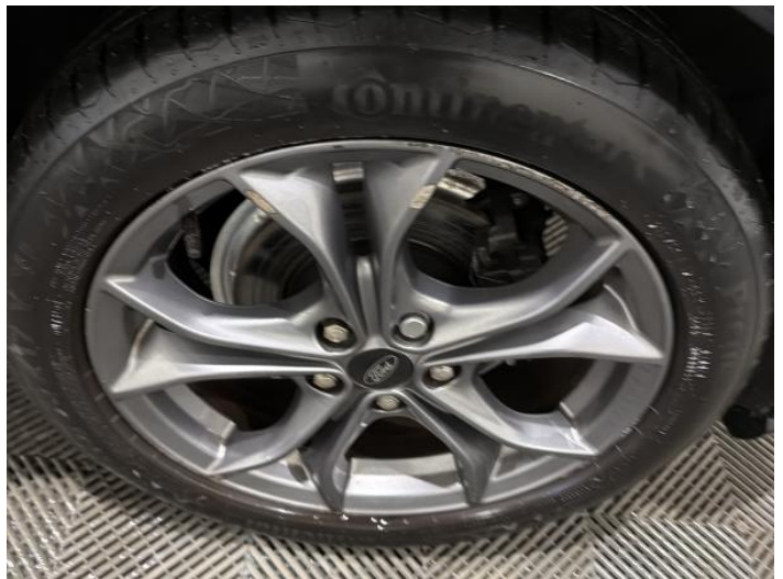
10: Wheel nsr Scratched Over 50mm