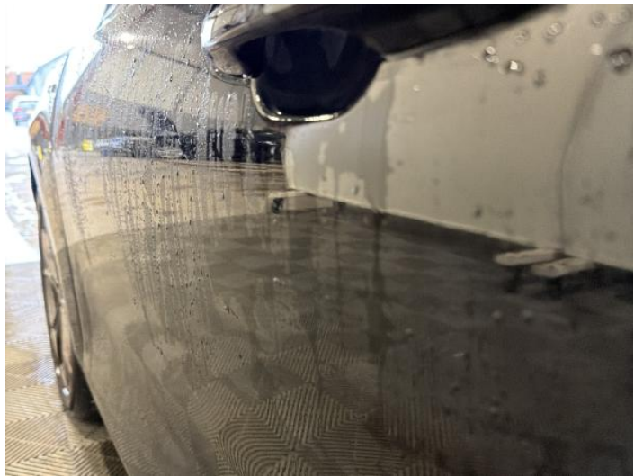
6: Door nsf Chipped 1 To 5