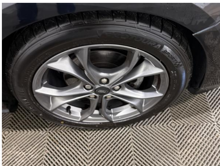
20: Wheel osf Scratched Up To 50mm