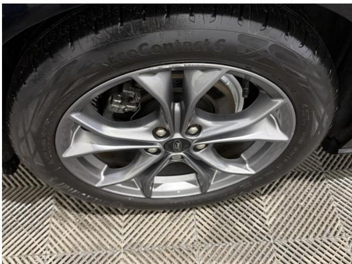
15: Wheel osr Scratched Over 50mm