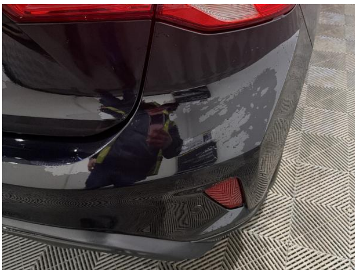
11: Bumper Rear Chipped Multiple Chips