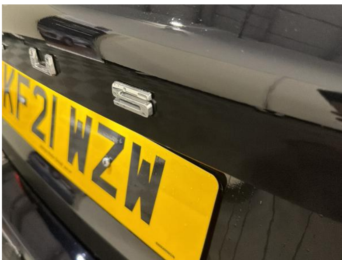
13: Boot Lid Dented Over 2 UpTo 10mm