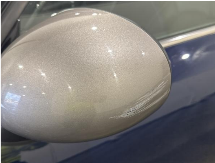
5: Door Mirror Assy nsf Scratched (Painted) Over 25mm Thru Paint