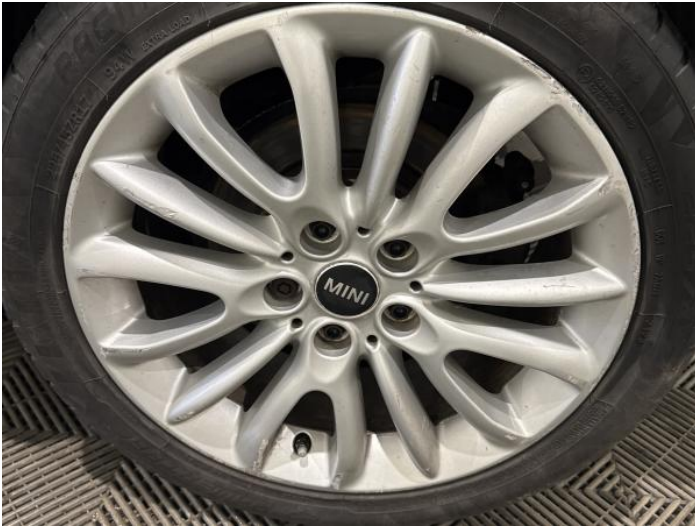
9: Wheel nsr Scratched Over 50mm