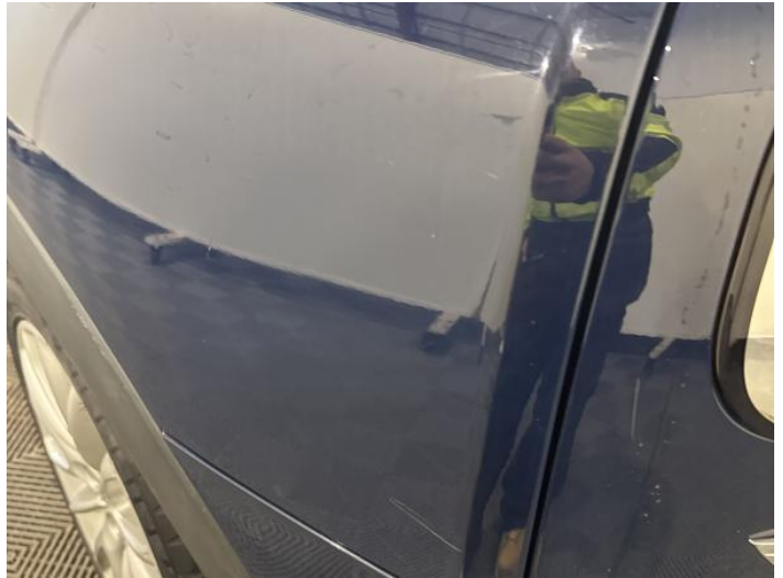
10: Qtr Panel nsr Scratched Over 25mm Thru Paint