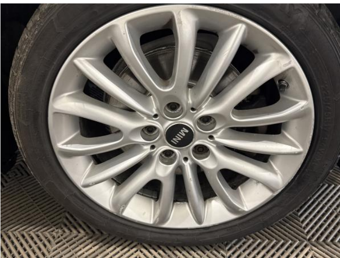
19: Wheel osf Scratched Over 50mm