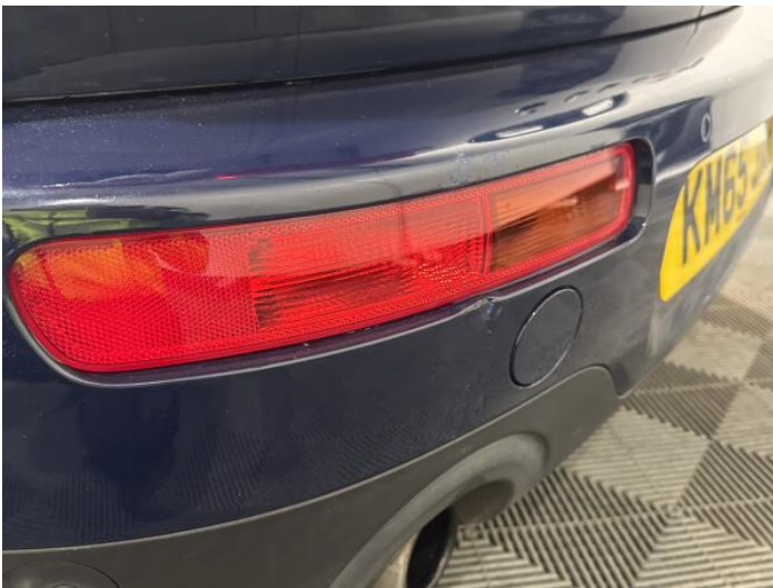
11: Bumper Rear Dented With Paint Damage