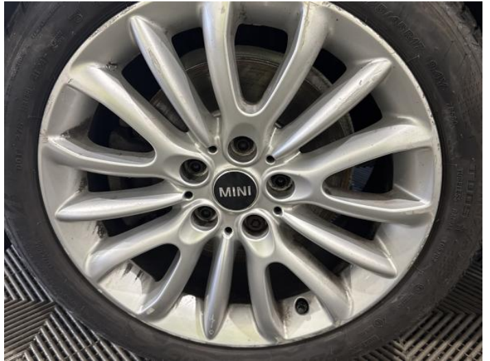
4: Wheel nsf Scratched Over 50mm