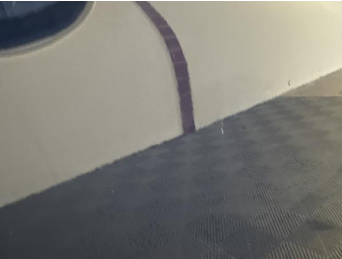
17: Door osf Scratched UpTo 25mm Thru Paint