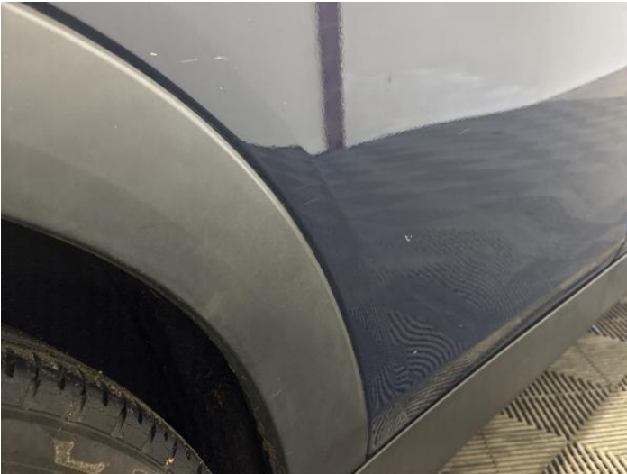
15: Door osr Scratched Over 25mm Thru Paint