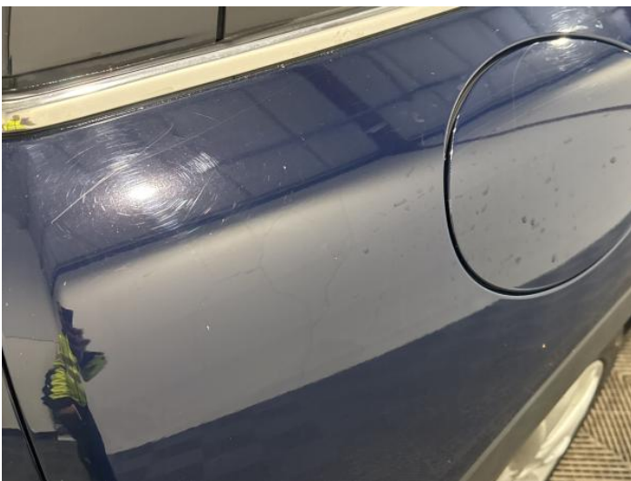
13: Qtr Panel osr Scratched Over 25mm Thru Paint