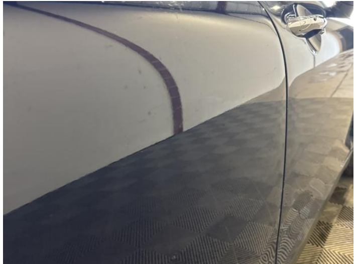
16: Door osr Dented Between 10mm + 30mm