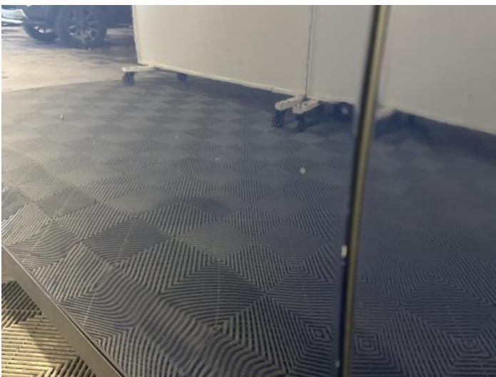
7: Door nsf Chipped 1 To 5