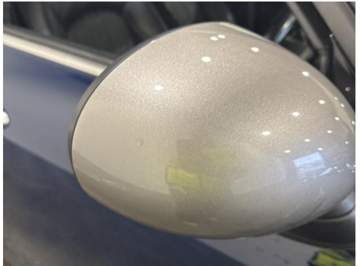
18: Door Mirror Assy osf Scratched (Painted) Over 25mm Thru Paint