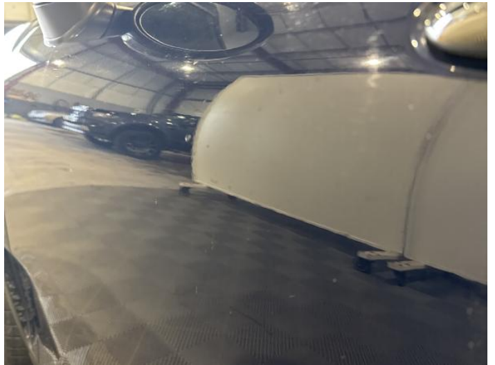
6: Door nsf Dented Between 10mm + 30mm