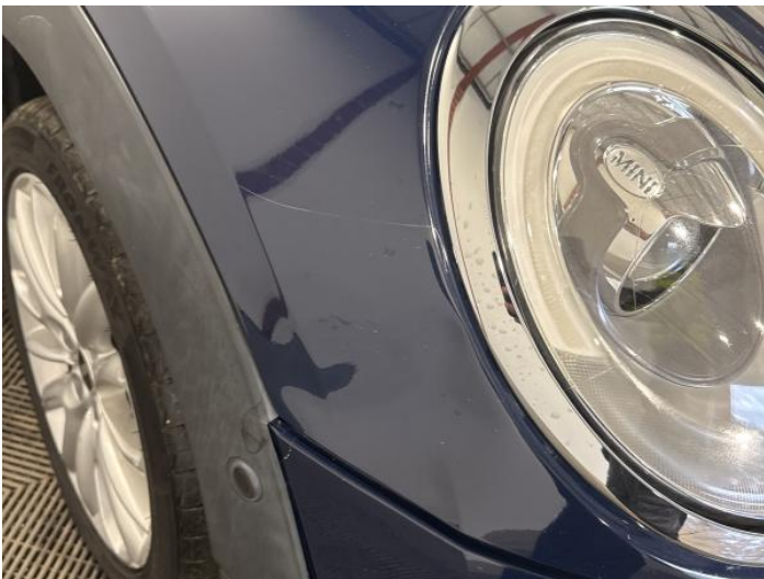
1: Bonnet Dented With Paint Damage