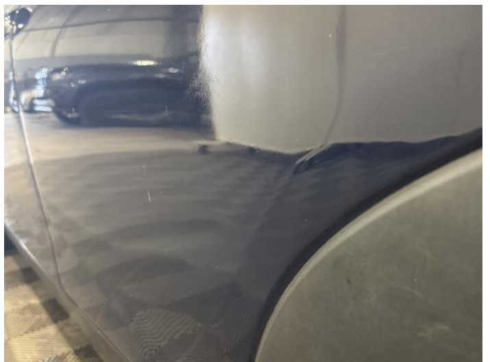
8: Door nsr Poor Previous Repair Rippled Up To 30%