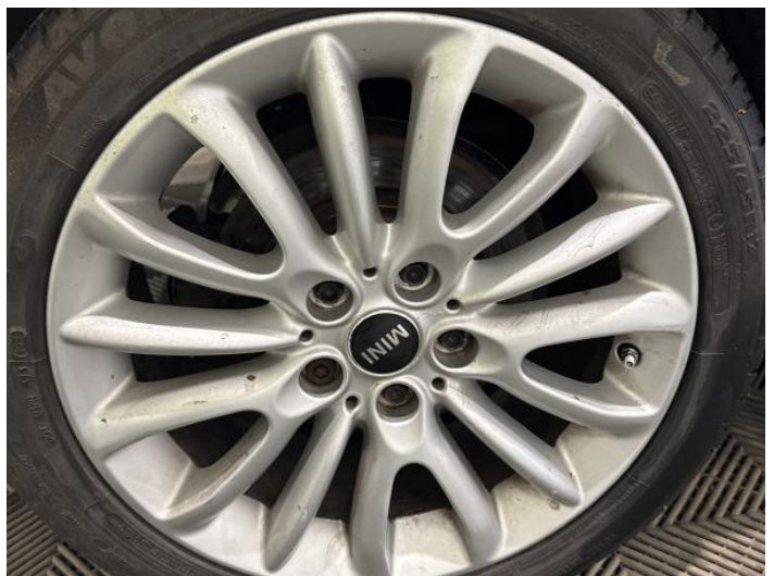
14: Wheel osr Scratched Over 50mm