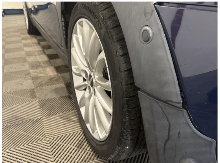
2: Wing Front Arch Extension os Scuffed (Unpainted) Over 100mm