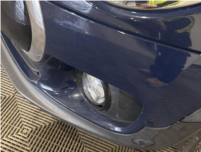
3: Bumper Front Chipped Multiple Chips