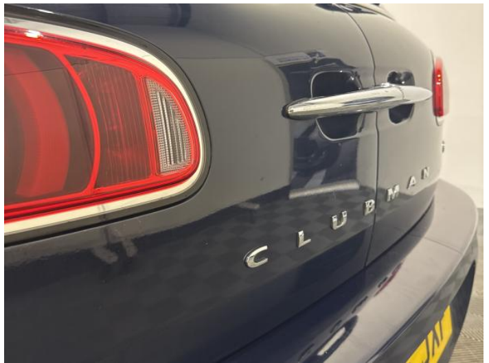
12: Tailgate Dented Over 30mm