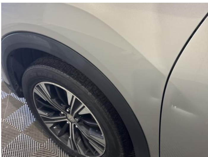
7: Wing nsf Scratched Over 25mm Thru Paint