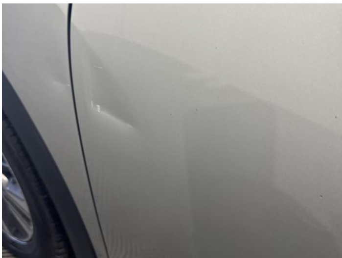
9: Door nsf Dented With Paint Damage