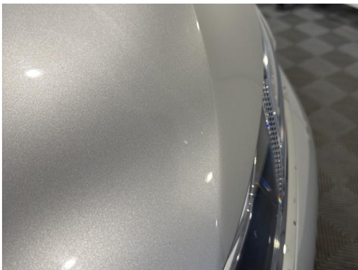
1: Bonnet Chipped 1 To 5