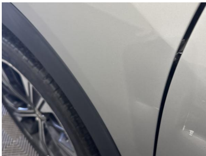
6: Wing nsf Dented Between 10mm + 30mm