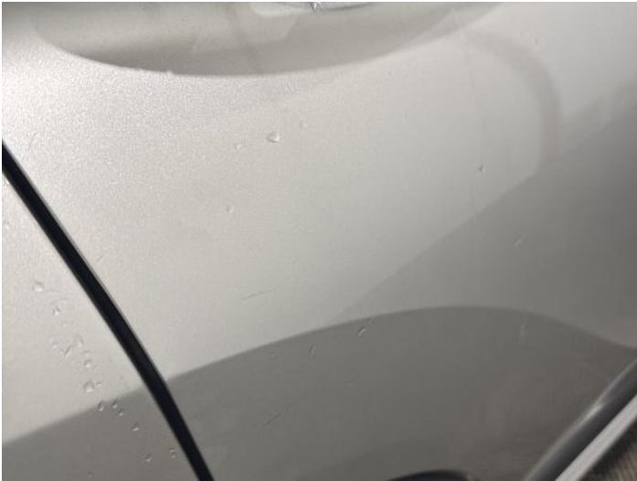
15: Door osr Scratched UpTo 25mm Thru Paint