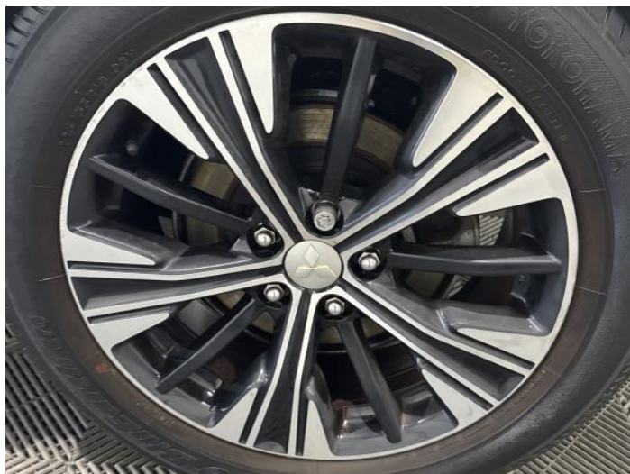
10: Wheel osr Scratched Over 50mm