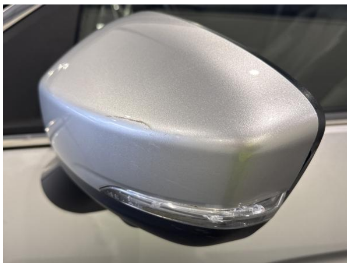
8: Door Mirror Assy nsf Scratched (Painted) UpTo 25mm Thru Paint