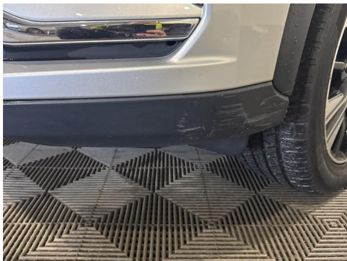
4: Bumper Front Moulding Scuffed (Unpainted) Over 100mm