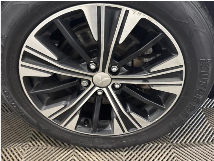
17: Wheel osf Scratched Over 50mm