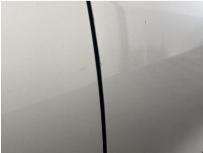
16: Door osf Dented Between 10mm + 30mm