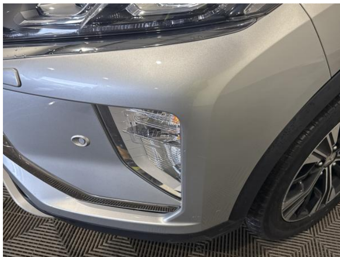
2: Bumper Front Scratched Over 100mm Thru Paint