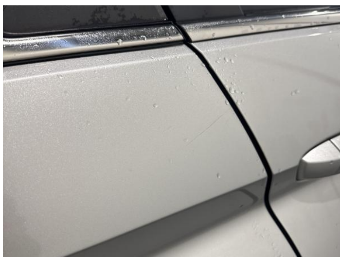
14: Qtr Panel osr Scratched Over 25mm Thru Paint