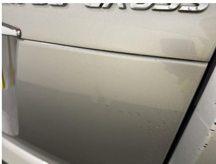
12: Tailgate Scratched Over 25mm Thru Paint