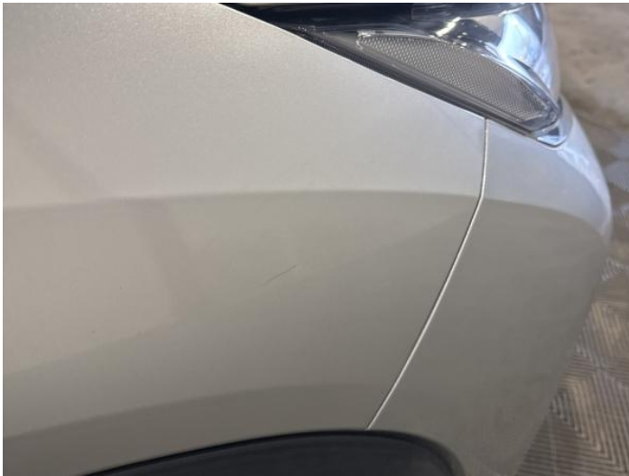
18: Wing osf Scratched UpTo 25mm Thru Paint

Carpet Condition Average Seat Condition Average