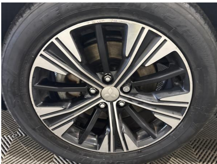
5: Wheel nsf Scratched Over 50mm