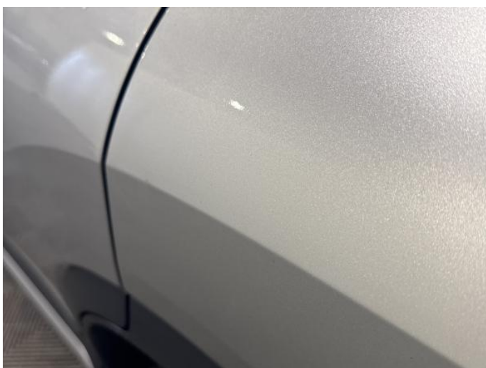
11: Qtr Panel nsr Dented Between 10mm + 30mm