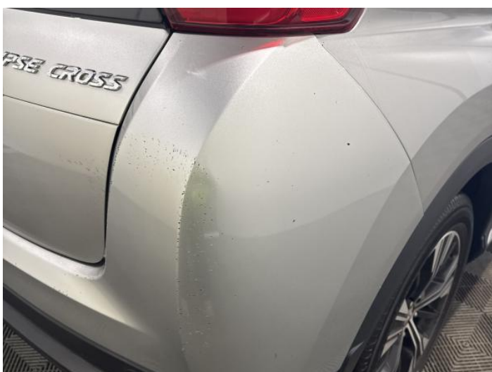
13: Bumper Rear Scratched 25 to 100mm Thru Paint