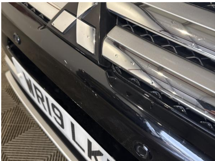
3: Bumper Front Moulding Scratched (Painted) Over 25mm Thru Paint