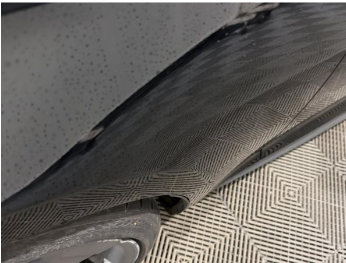
5: Wing nsf Chipped 1 To 5