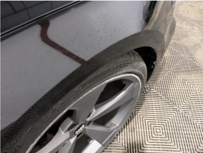
22: Wing osf Chipped 1 To 5