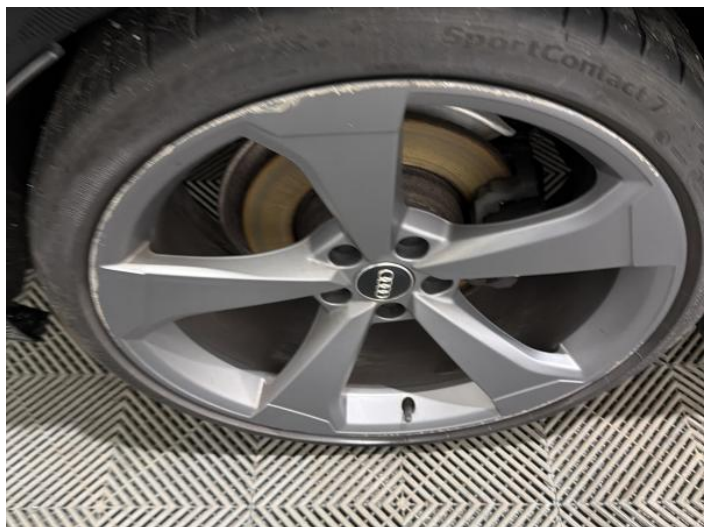
20: Wheel osr Scratched Over 50mm