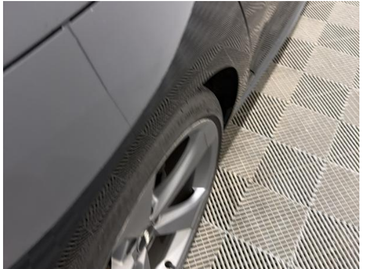
16: Qtr Panel osr Dented 2 Or Less UpTo 10mm