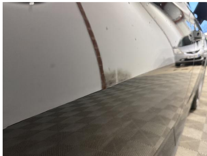
19: Door osr Dented Over 2 UpTo 10mm