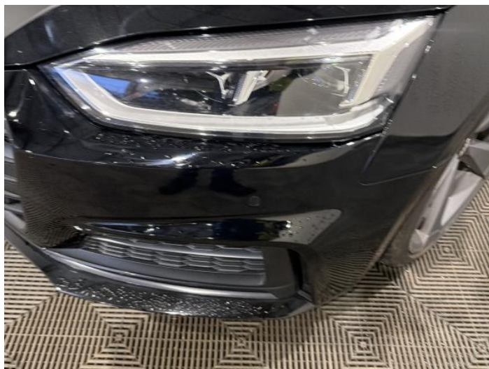
2: Bumper Front Chipped Multiple Chips