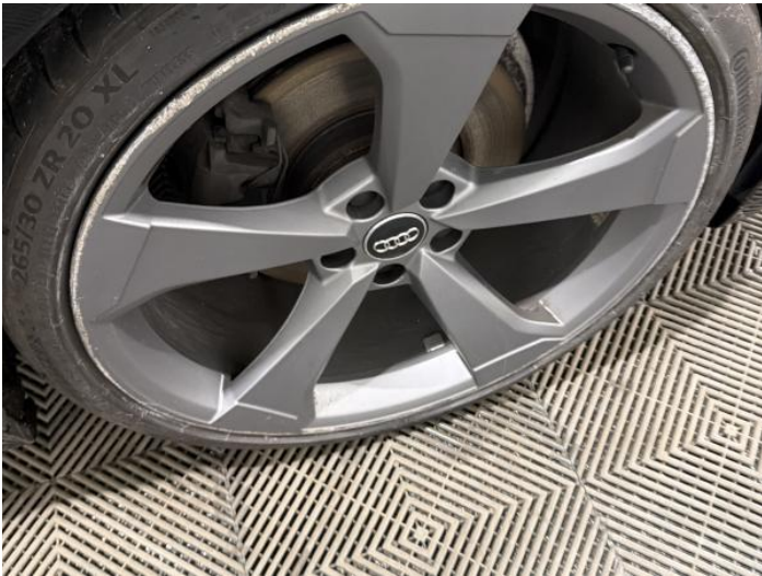
23: Wheel osf Scratched Over 50mm

Carpet Condition Average Seat Condition Average