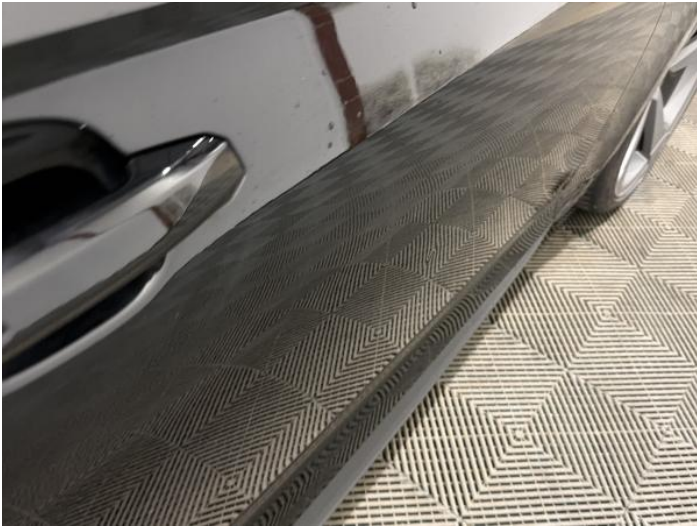
21: Door osf Poor Previous Repair Poor Paint