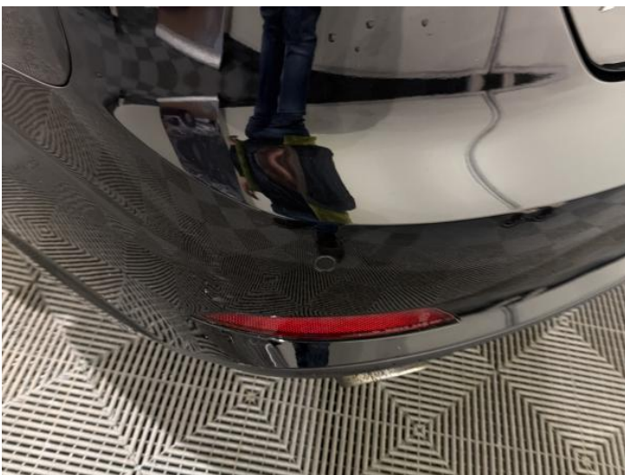
13: Bumper Rear Scratched 25 to 100mm Thru Paint