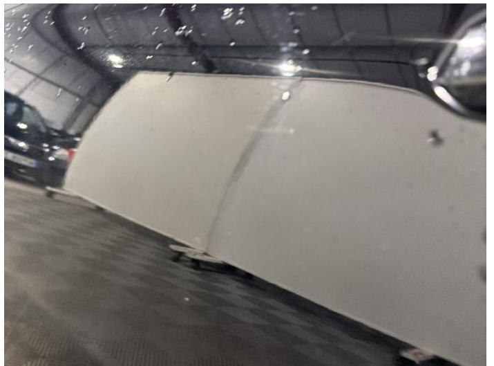
6: Door nsf Chipped 1 To 5