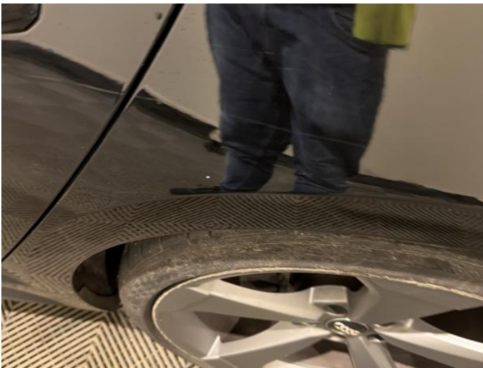
11: Qtr Panel nsr Dented Over 2 UpTo 10mm