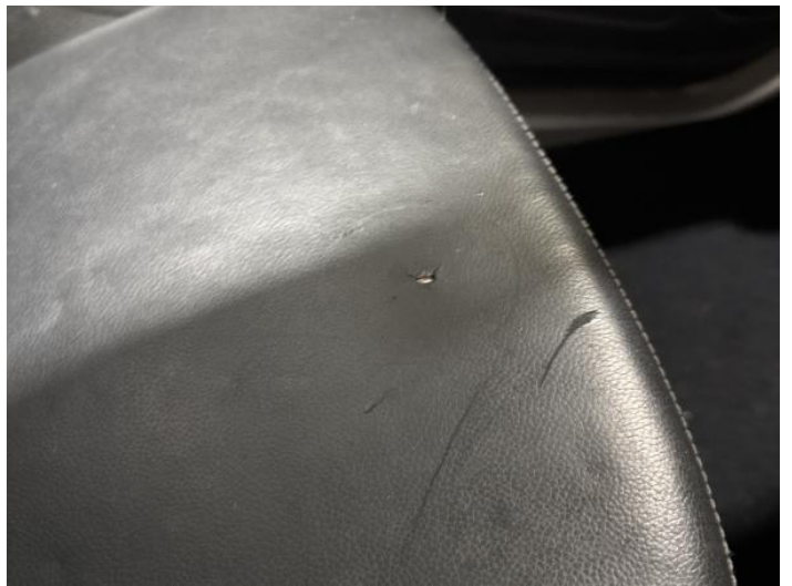
12: Seat Base Cover nsf Holed Over 3mm