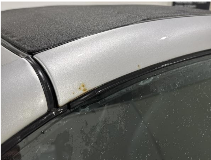
11: A Post ns Scratched Rusted