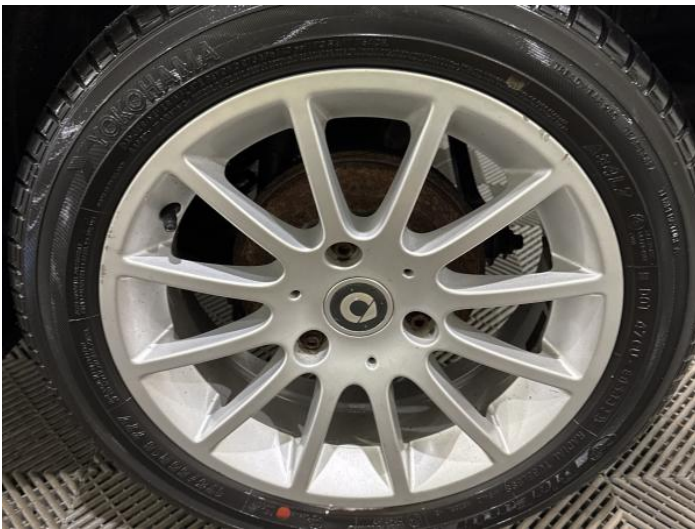
5: Wheel nsr Scratched Up To 50mm