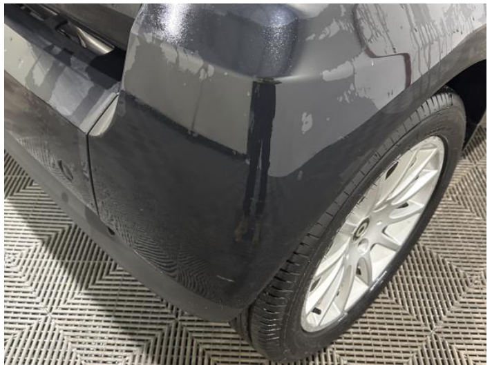
6: Bumper Rear Scratched Over 100mm Thru Paint