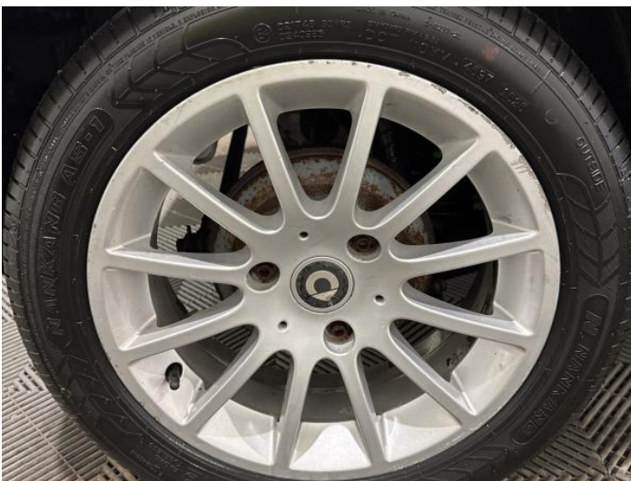
7: Wheel osr Scratched Over 50mm