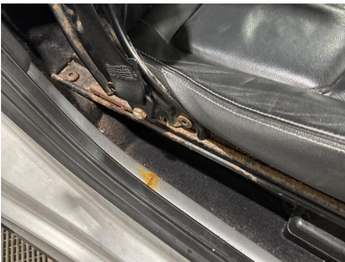
13: Other N/A N/A