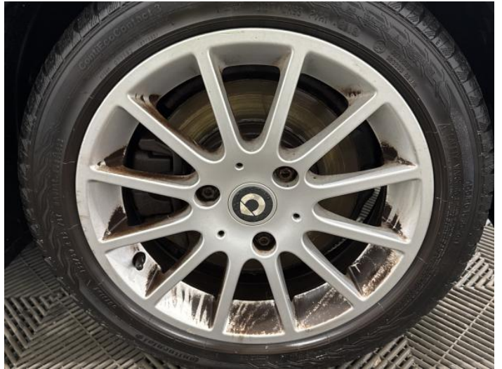
10: Wheel osf Scratched Up To 50mm