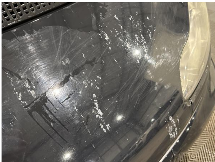
1: Bonnet Scratched Over 25mm Thru Paint