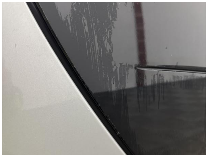
8: Door osf Chipped Edge Chip