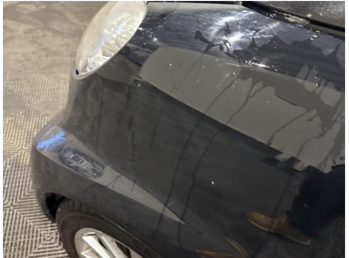
4: Wing nsf Scratched Over 25mm Thru Paint