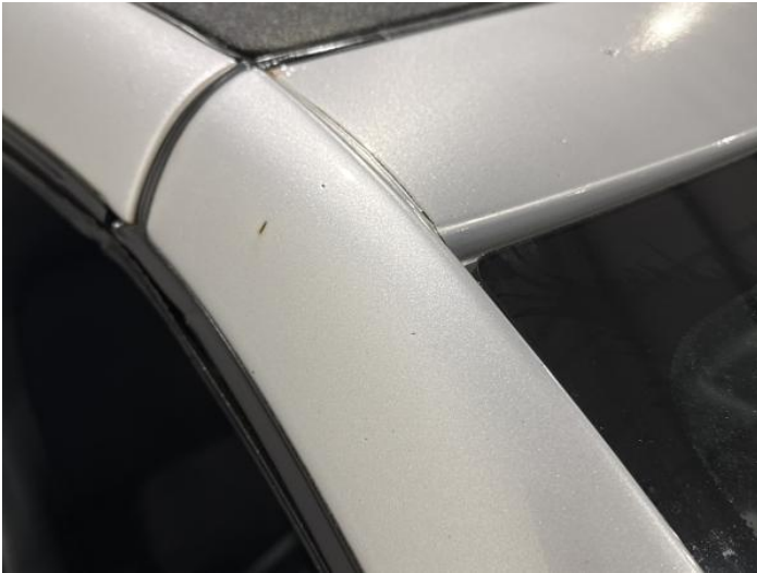
9: A Post os Scratched Up To 25mm Thru Paint