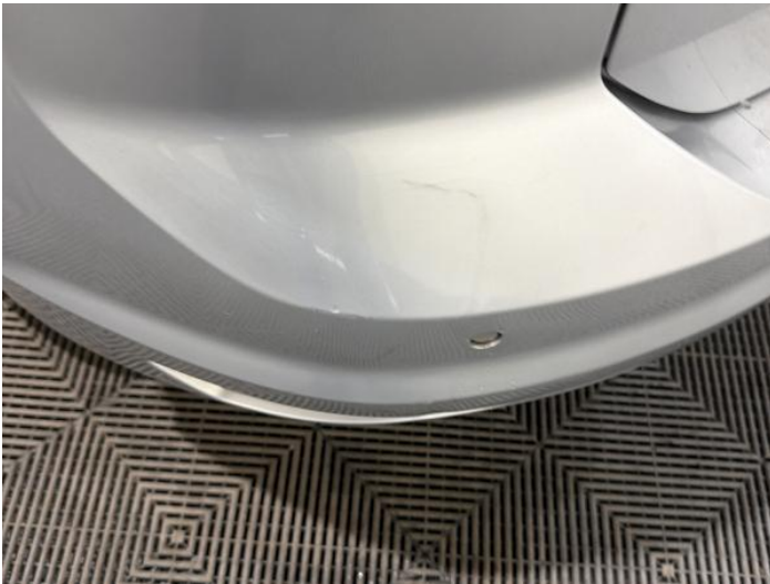
11: Bumper Rear Poor Previous Repair Poor Paint