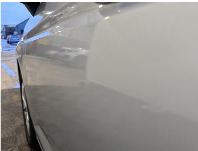
7: Door nsf Poor Previous Repair Poor Paint