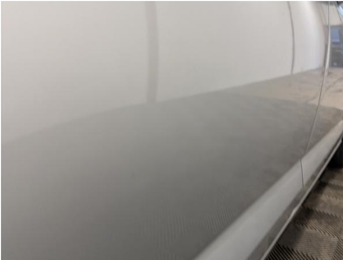
15: Door osr Chipped 1 To 5