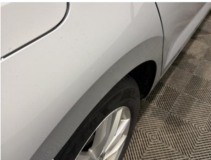
13: Qtr Panel osr Dented Between 10mm + 30mm