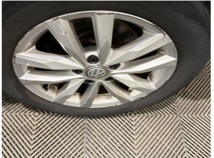
10: Wheel nsr Scratched Over 50mm