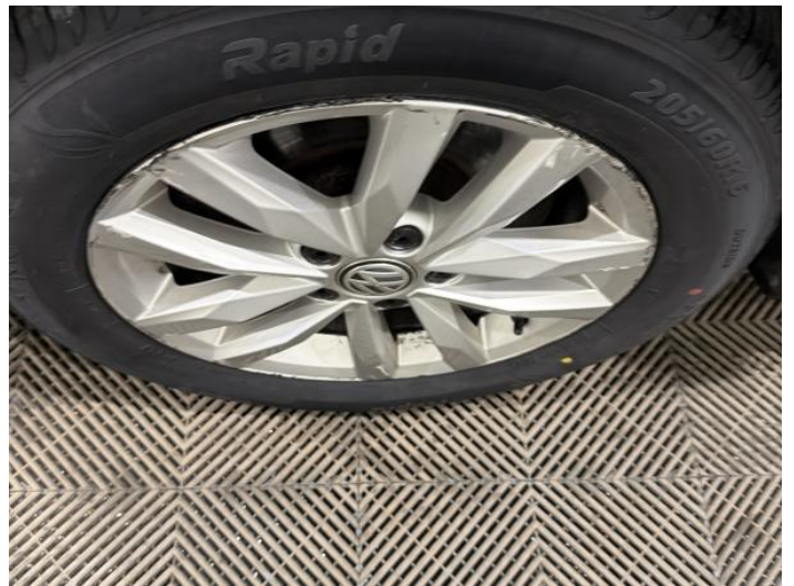
6: Wheel nsf Scratched Over 50mm