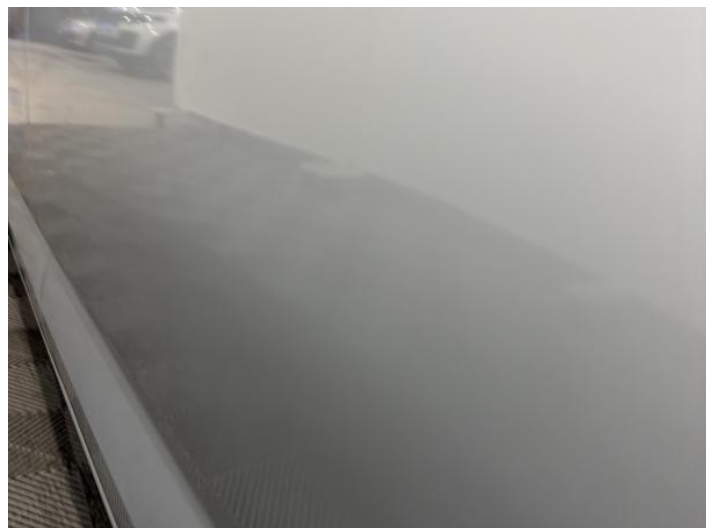
8: Door nsr Poor Previous Repair Poor Paint