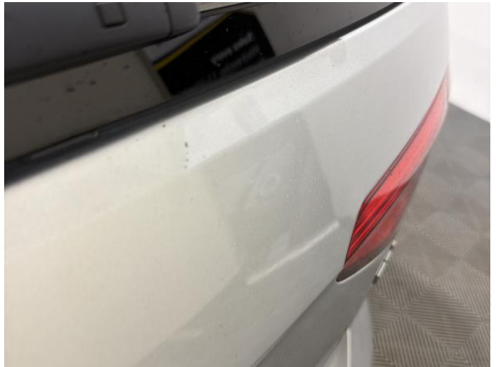
12: Boot Lid Dented Between 10mm + 30mm