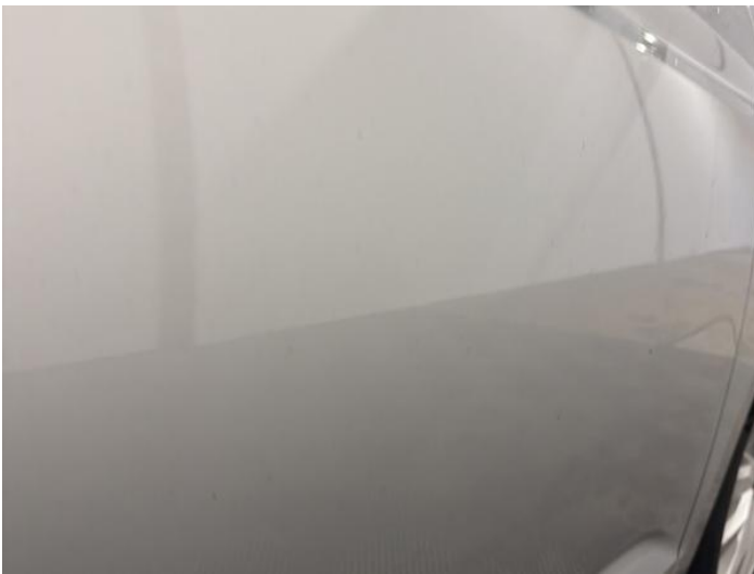
17: Door osf Poor Previous Repair Poor Paint