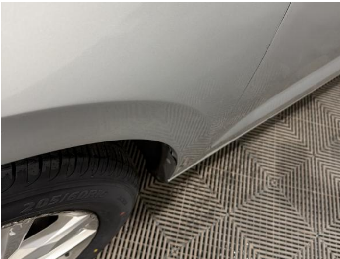
5: Wing nsf Dented Over 2 UpTo 10mm