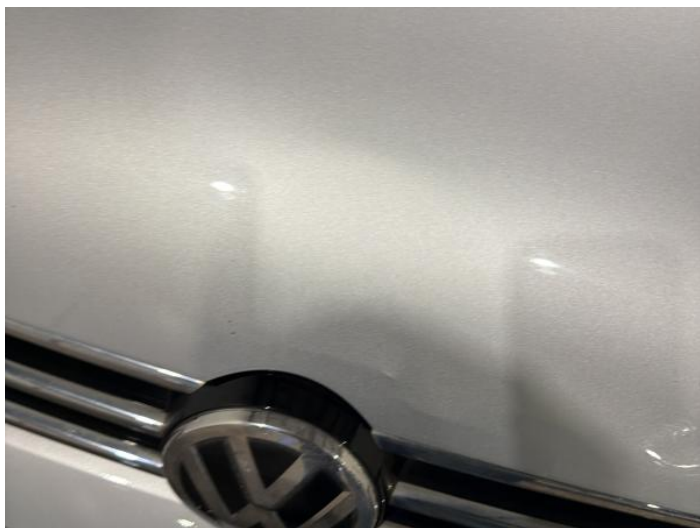
1: Bonnet Dented With Paint Damage