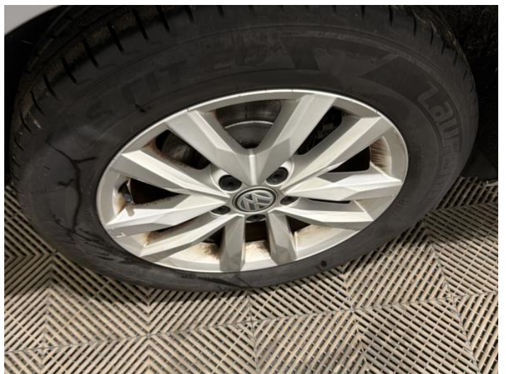
14: Wheel osr Scratched Over 50mm