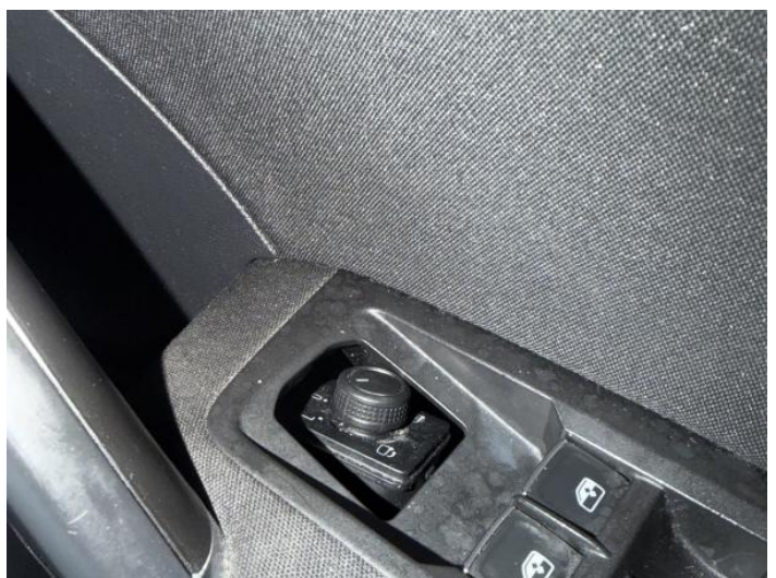
20: Other N/A N/A