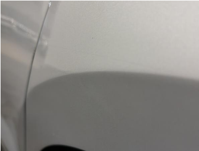
9: Qtr Panel nsr Poor Previous Repair Poor Paint