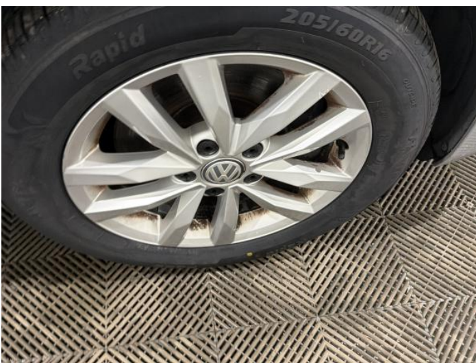
19: Wheel osf Scratched Over 50mm