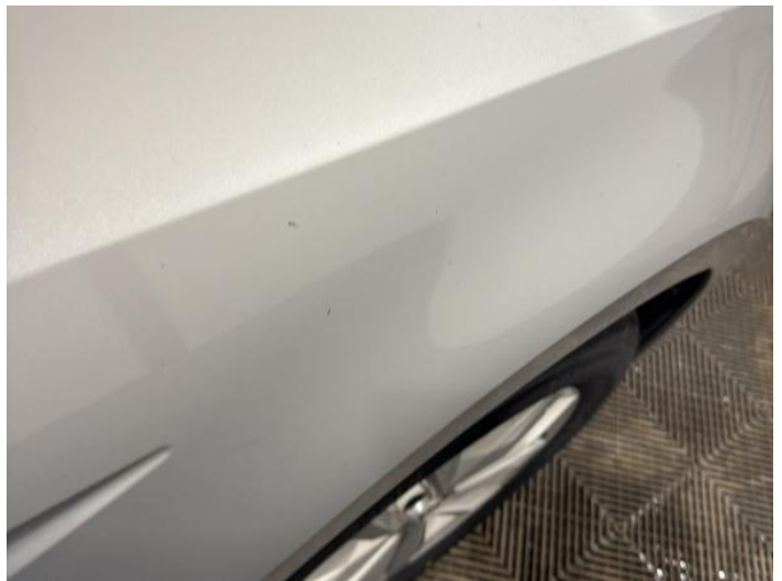
18: Wing osf Chipped 1 To 5