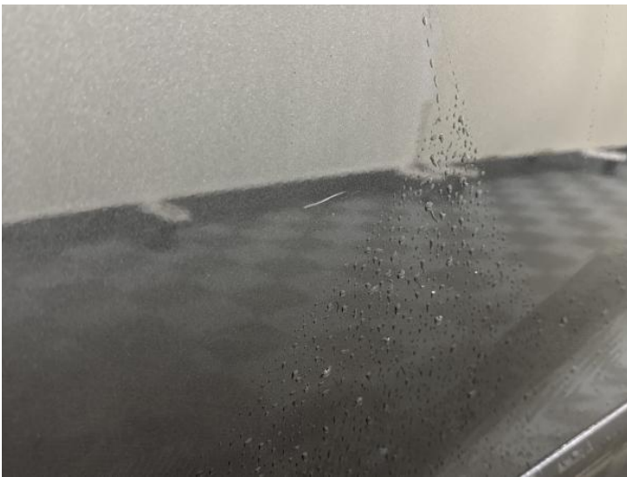
5: Door nsf Scratched UpTo 25mm Thru Paint