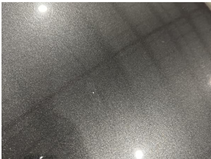
1: Bonnet Chipped 1 To 5