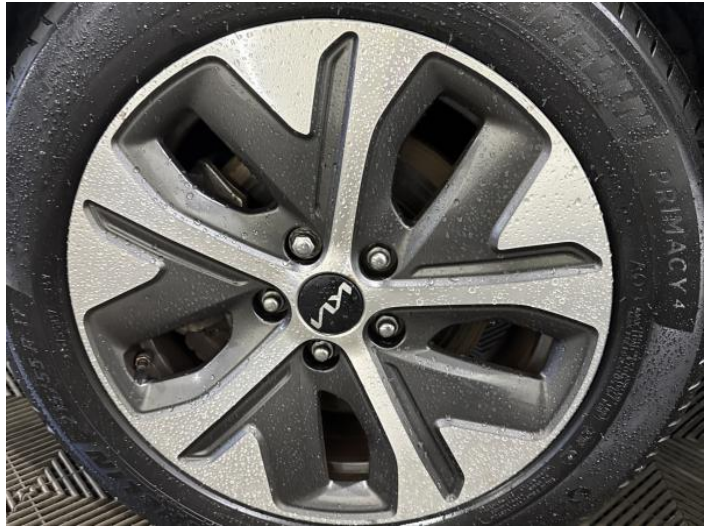
4: Wheel nsf Scratched Up To 50mm