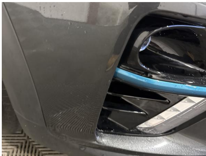
2: Bumper Front Scratched UpTo 25mm Thru Paint