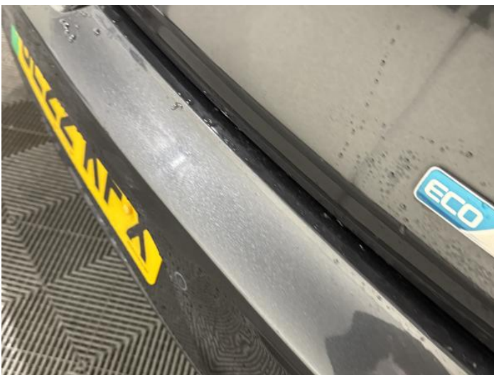
7: Bumper Rear Scratched Up To 25mm Thru Paint