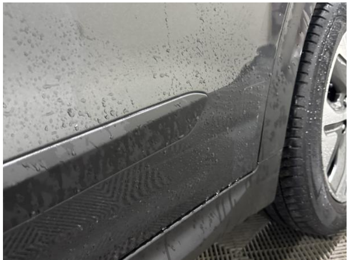
6: Door nsr Dented Over 30mm