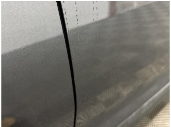
9: Door osr Scratched UpTo 25mm Thru Paint