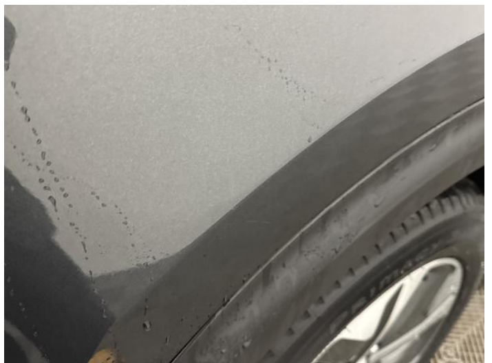
8: Qtr Panel osr Scratched UpTo 25mm Thru Paint