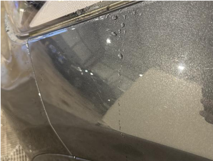
3: Wing nsf Scratched UpTo 25mm Thru Paint