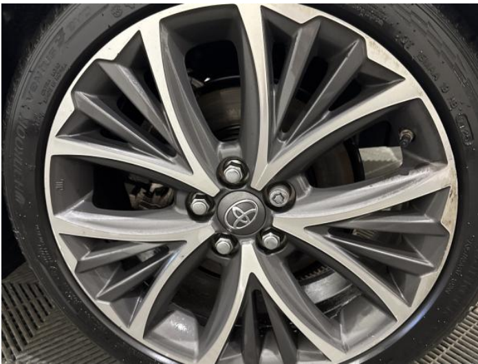
5: Wheel nsr Scratched Up To 50mm