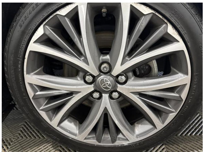
8: Wheel osf Scratched Over 50mm