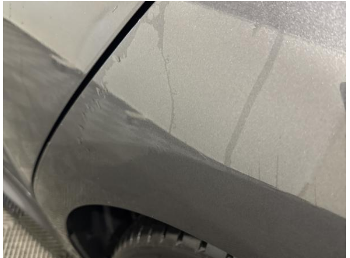
4: Qtr Panel nsr Scratched UpTo 25mm Thru Paint