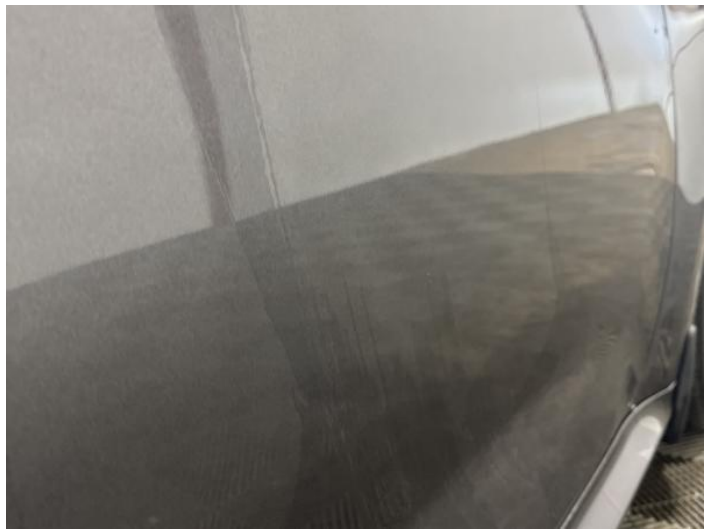
6: Door osf Dented Over 30mm