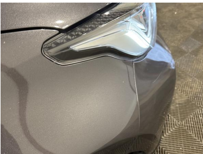
7: Wing osf Chipped 1 To 5