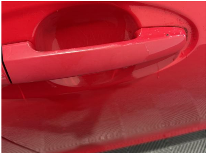
5: Other N/A N/A