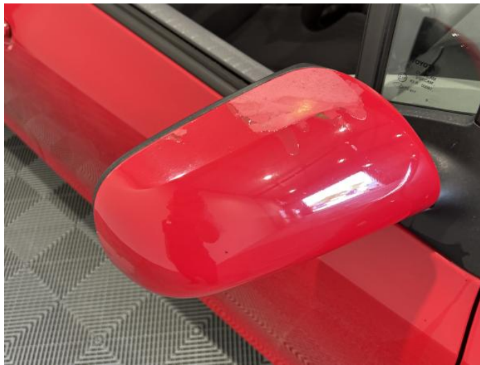
4: Door Mirror Assy osf Scratched (Painted) Over 25mm Thru Paint