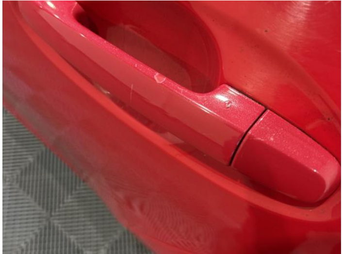
8: Other N/A N/A