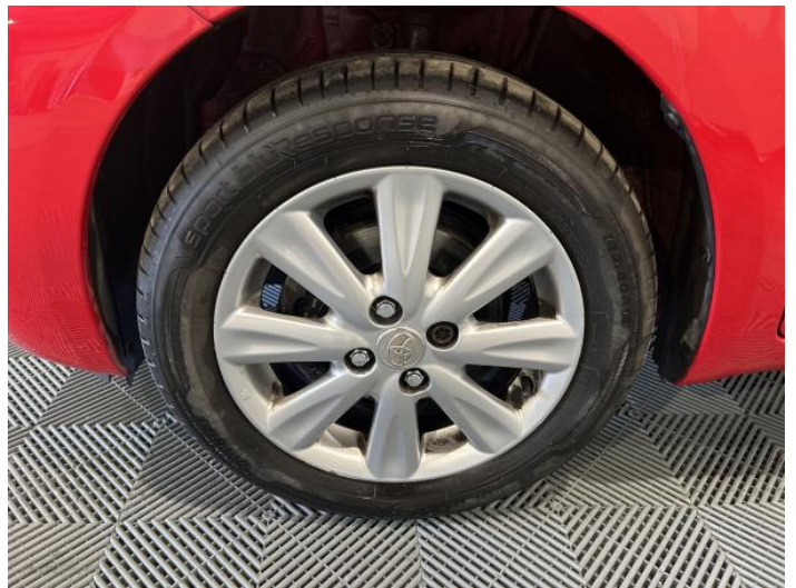
3: Wheel nsf Scratched Up To 50mm