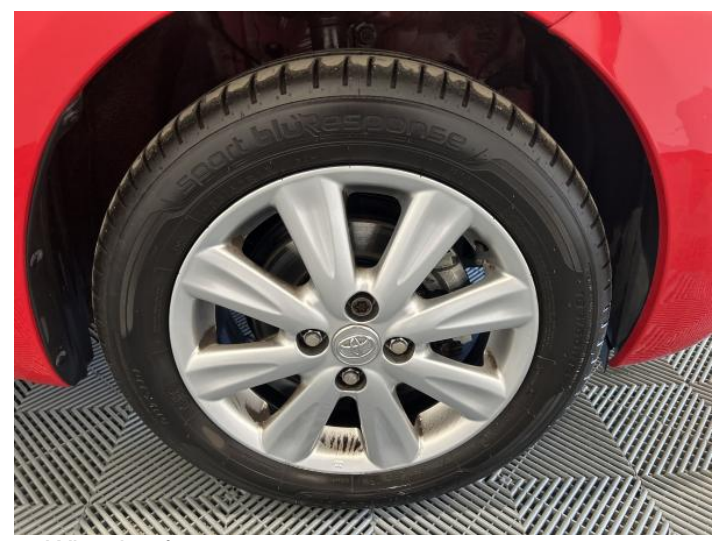
1: Wheel osf Scratched Over 50mm