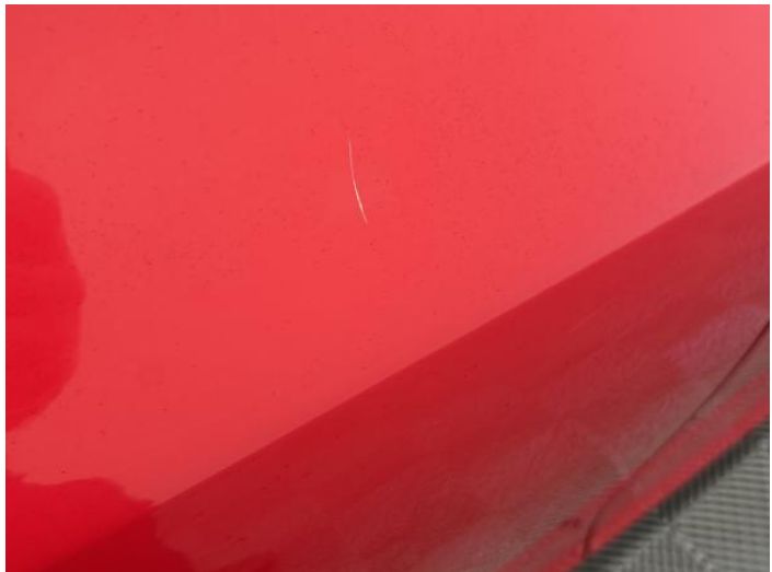
6: Door osr Scratched UpTo 25mm Thru Paint