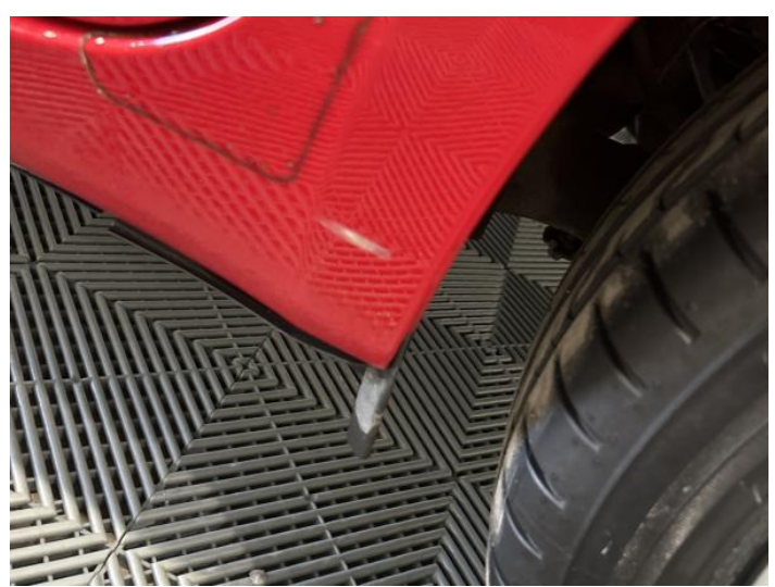
10: Sill ns Scratched UpTo 25mm Thru Paint