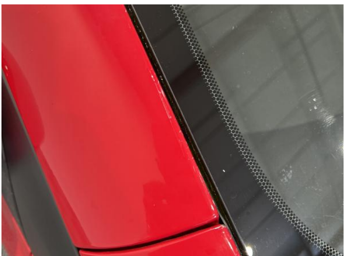
14: A Post os Poor Previous Repair Paint Flake