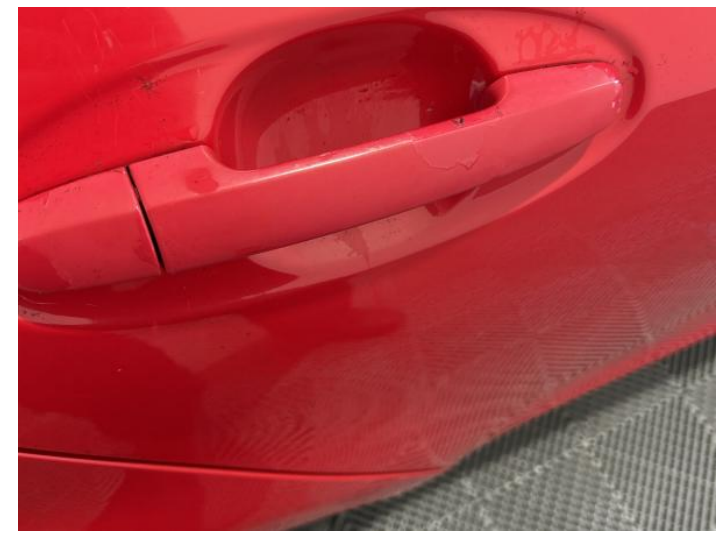
7: Other N/A N/A