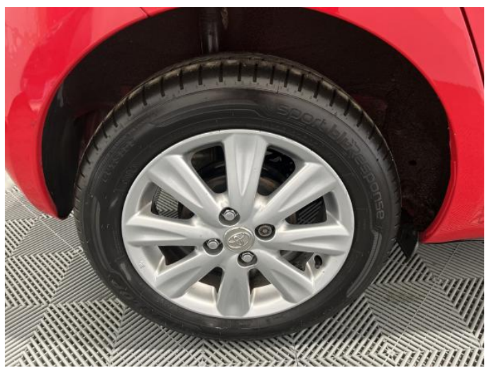
2: Wheel osr Scratched Up To 50mm