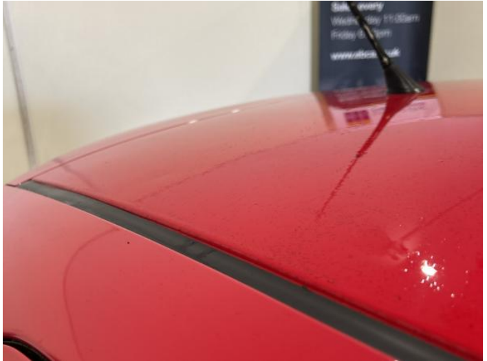
11: Roof Dented Over 2 UpTo 10mm