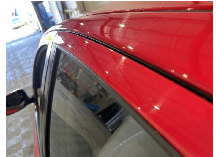
13: C Post ns Dented Between 10mm + 30mm