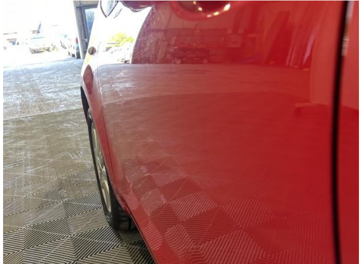
12: Door nsf Dented Over 2 UpTo 10mm