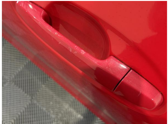
9: Other N/A N/A